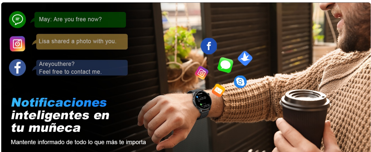
Image: A person viewing smart notifications from social media and messaging apps on the zhizhi S67 Smartwatch, highlighting its ability to keep users informed.