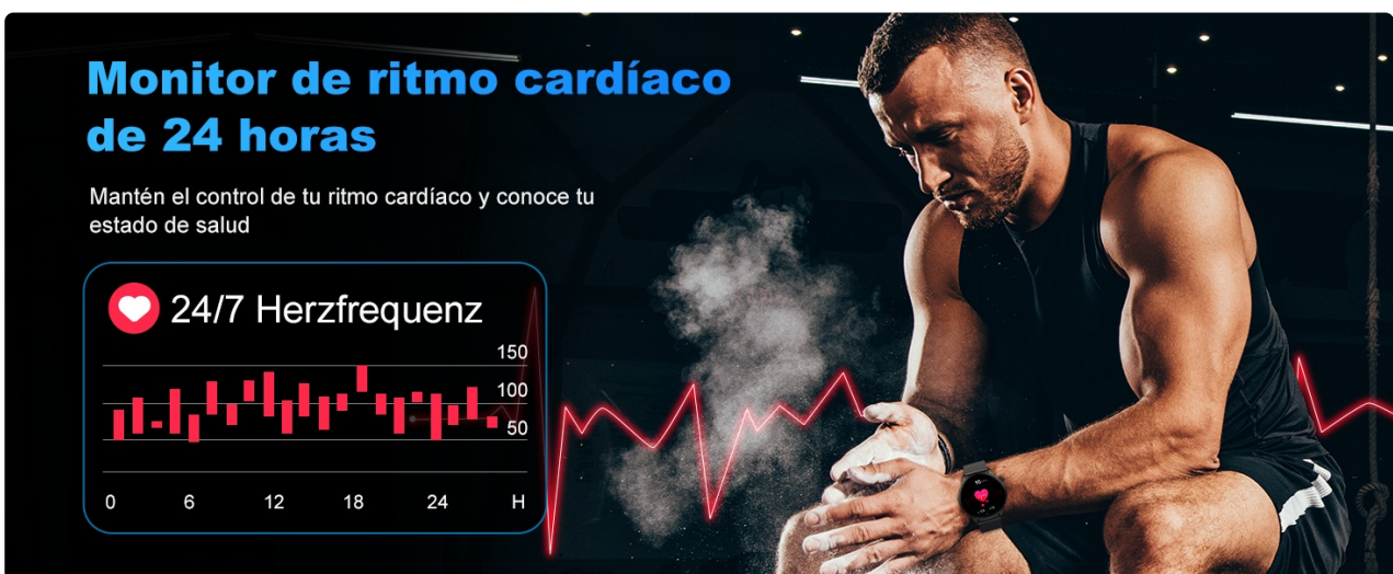
Image: A person exercising while wearing the zhizhi S67 Smartwatch, with an overlay showing a graph of 24-hour heart rate monitoring data.