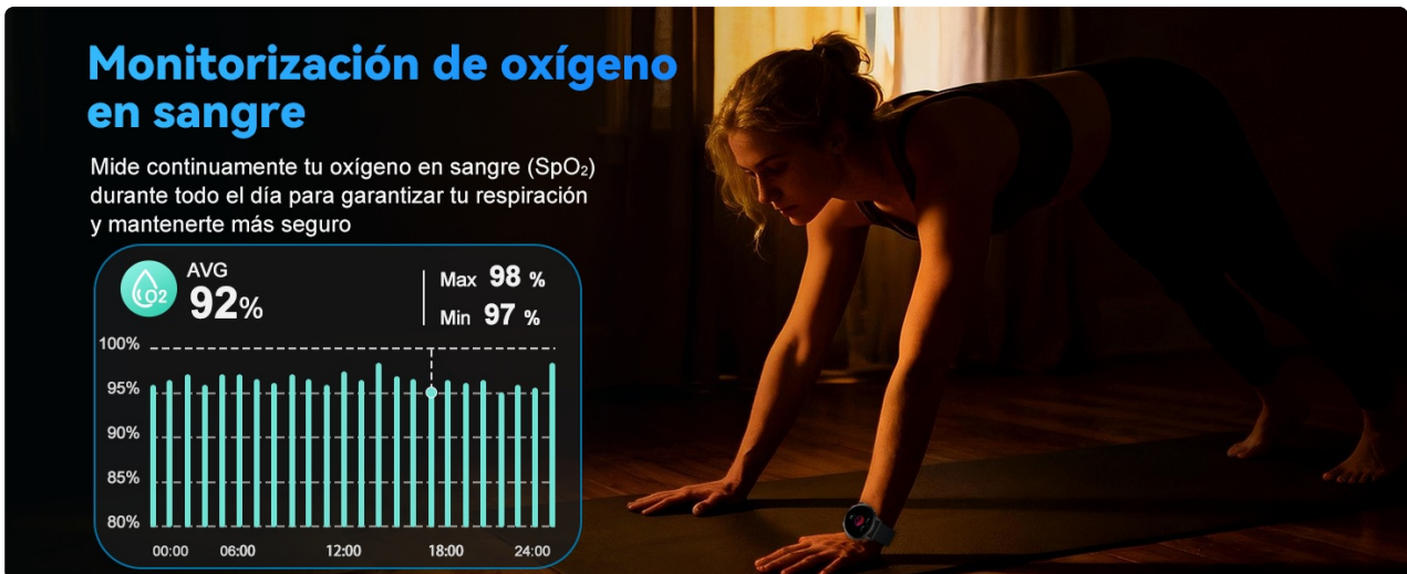
Image: A person performing yoga while wearing the zhiphi S67 Smartwatch, with an overlay showing a graph of continuous blood oxygen monitoring data.