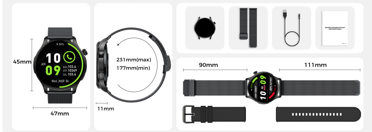
Image: Illustration of the zhizhi S67 Smartwatch and its included accessories, such as the watch body, two different straps, a magnetic charging cable, and the user manual.