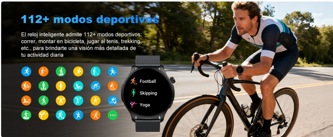
Image: A person cycling outdoors while wearing the zhizhi S67 Smartwatch, with an overlay showing a selection of over 112 sports mode icons available on the device.