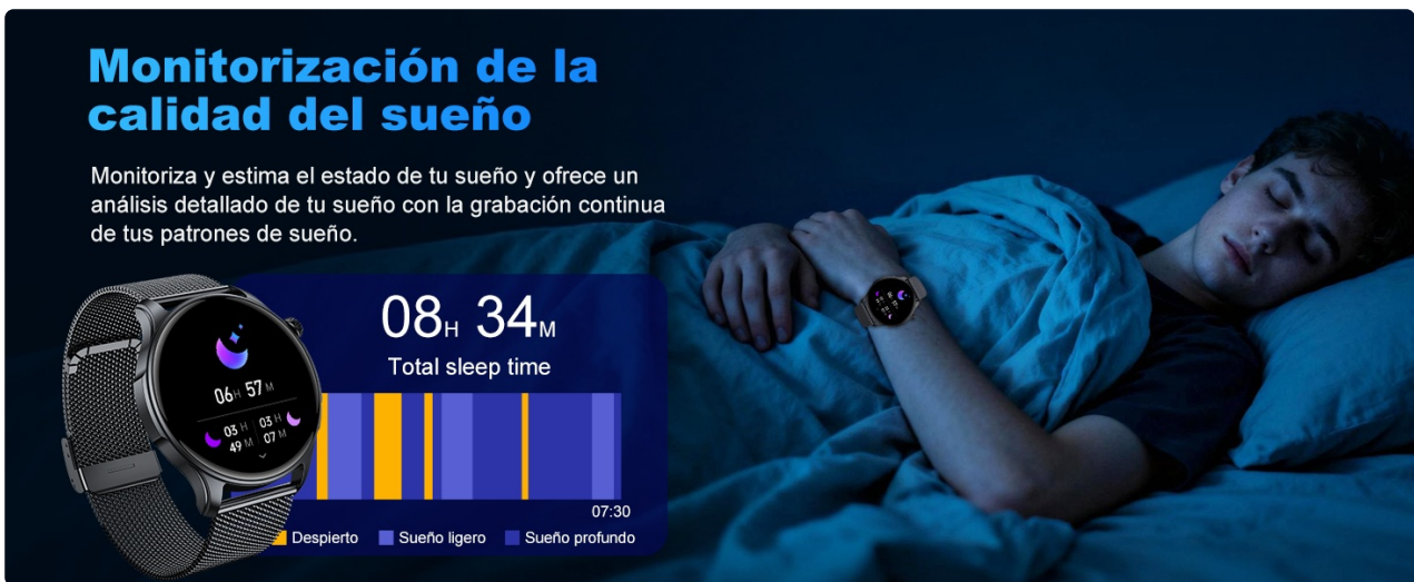
Image: A person sleeping while wearing the zhiphi S67 Smartwatch, with an overlay showing a detailed breakdown of sleep quality, including deep, light, and awake periods.