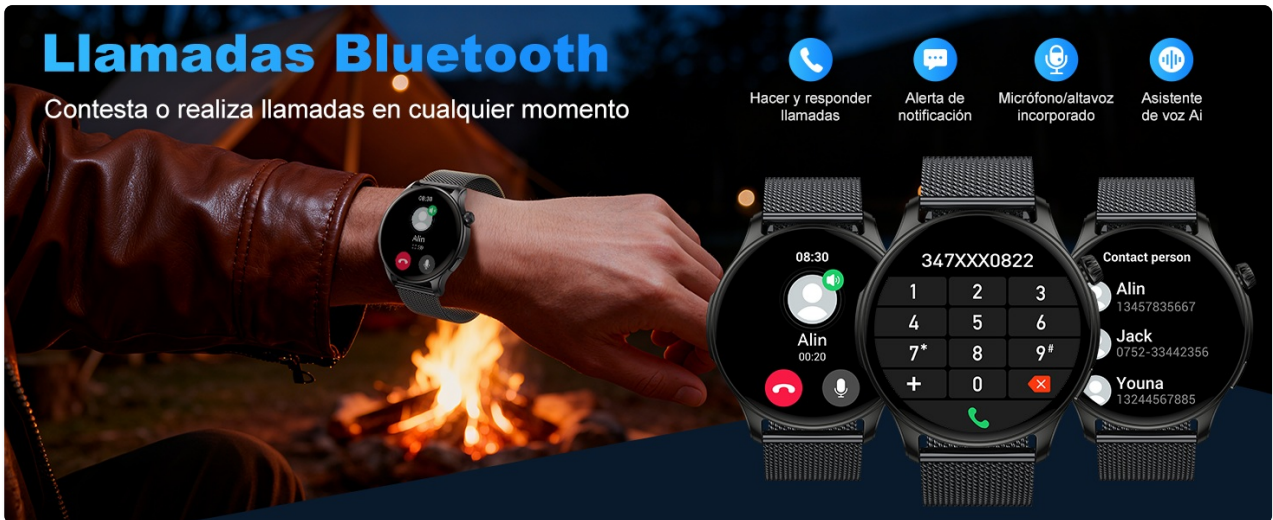
Image: A person wearing the zhizhi S67 Smartwatch, demonstrating its Bluetooth call feature with a clear display of the dial pad and recent call logs on the watch screen.