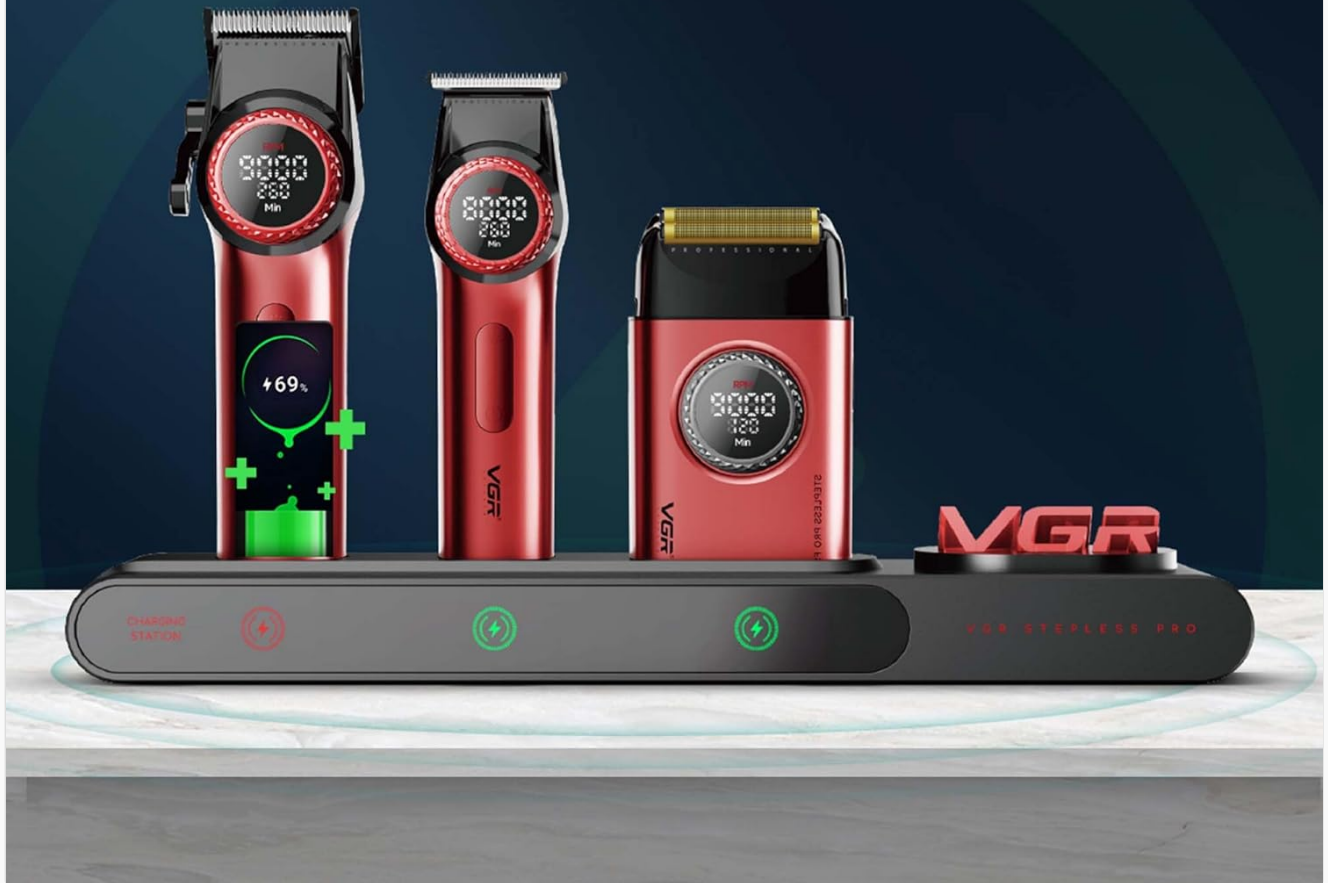
Image: Detailed view of the charging station with LED status.

Recharge simultanée de plusieurs appareils Conçu pour les professionnels