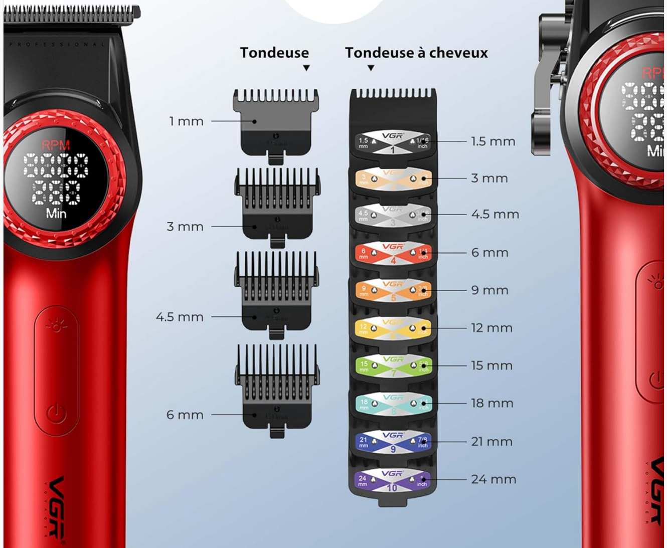
Image: Guide comb selection for different cutting lengths.