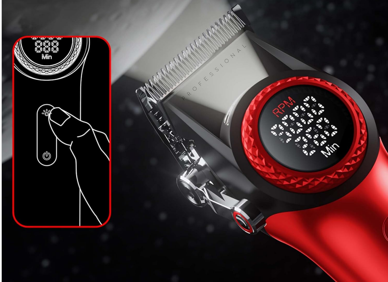
Image: LED spotlight feature on the VGR clipper.

OFF : Cliquez à nouveau et un bip retentit