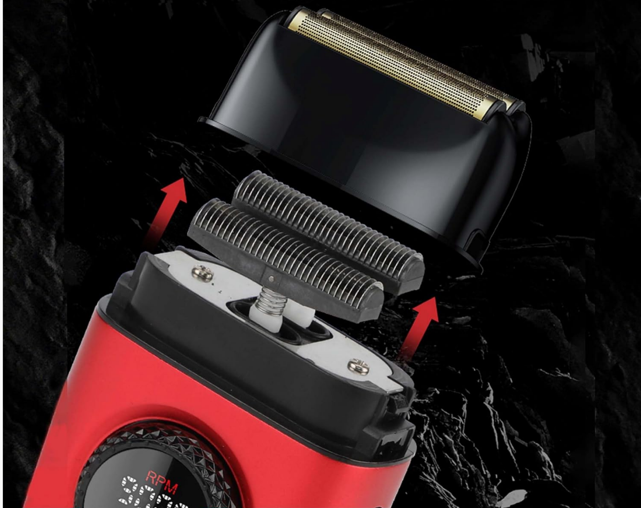
Image: Removable shaver head for easy cleaning.

Appuyez sur le bouton de déverrouillage et maintenez-le enfoncé, puis retirez la tête du rasoir pour un nettoyage facile de la barbe et des débris avec une brosse.