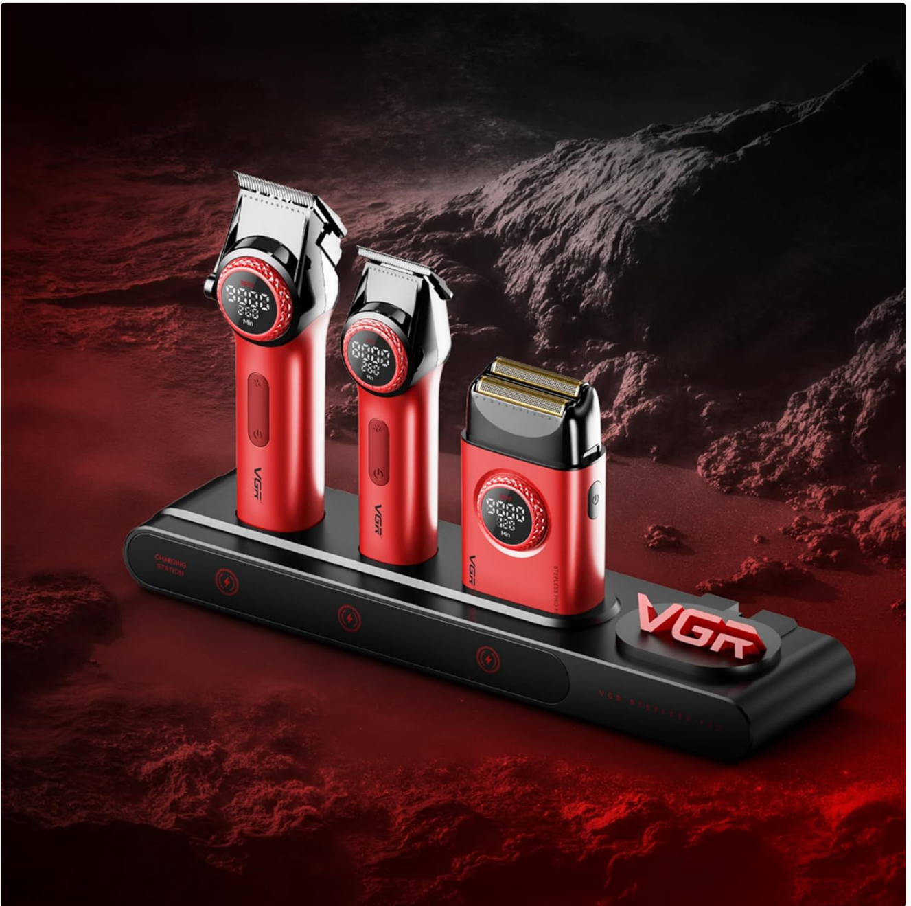
Image: VGR grooming kit on its charging station.