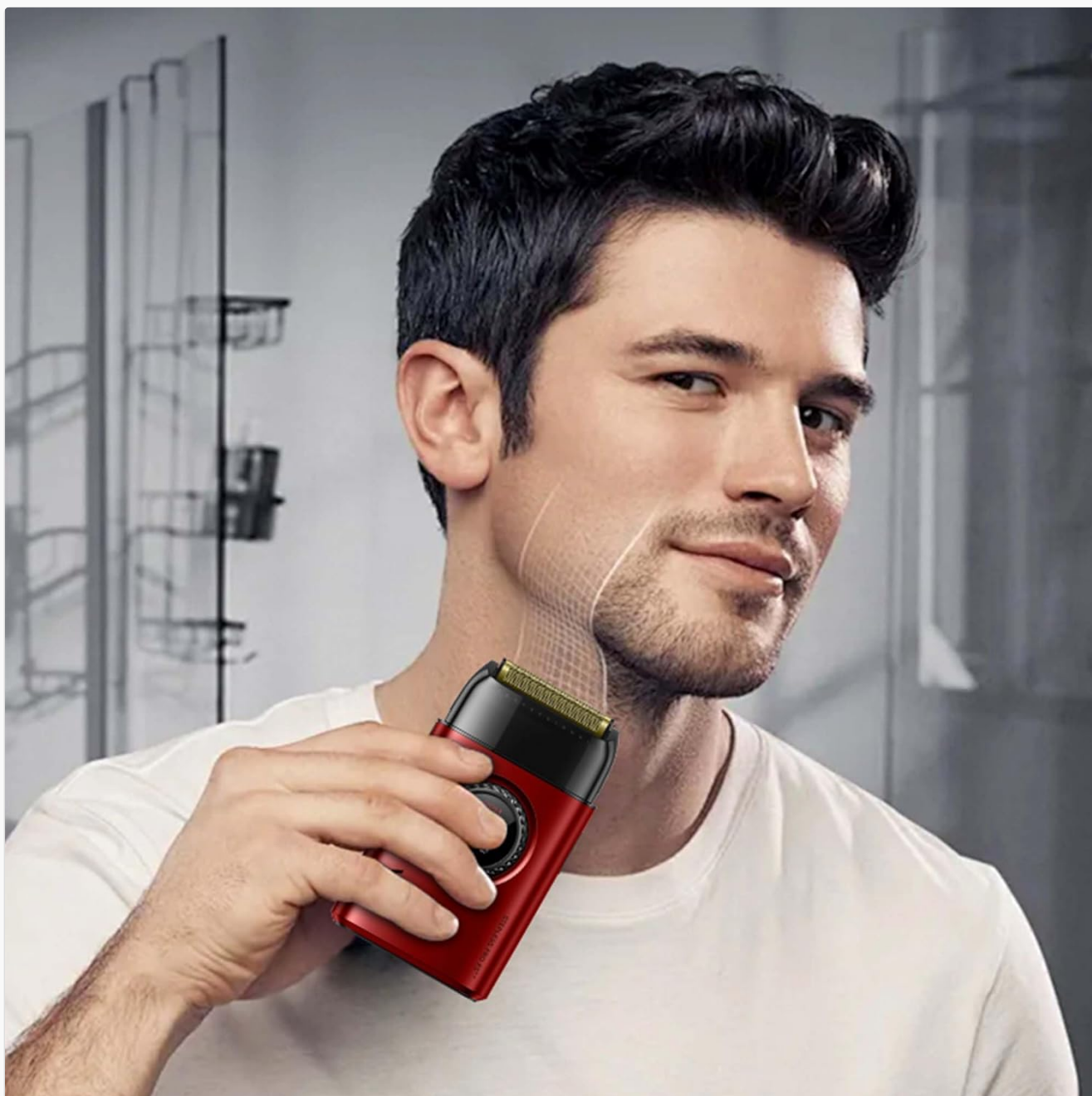
Image: Demonstrating the use of the VGR electric shaver.

For a close shave, press the shaver gently against your skin and move it in short, circular motions or against the direction of hair growth. The flexible head will adapt to facial contours.