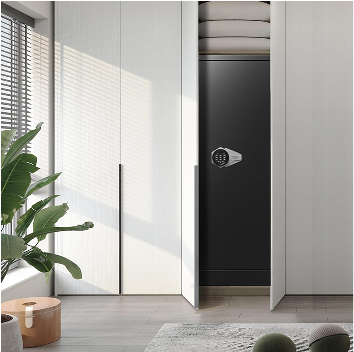
Figure 2: The Marcree 8-10 Gun Safe can be discreetly placed and mounted in various home environments, such as a closet.