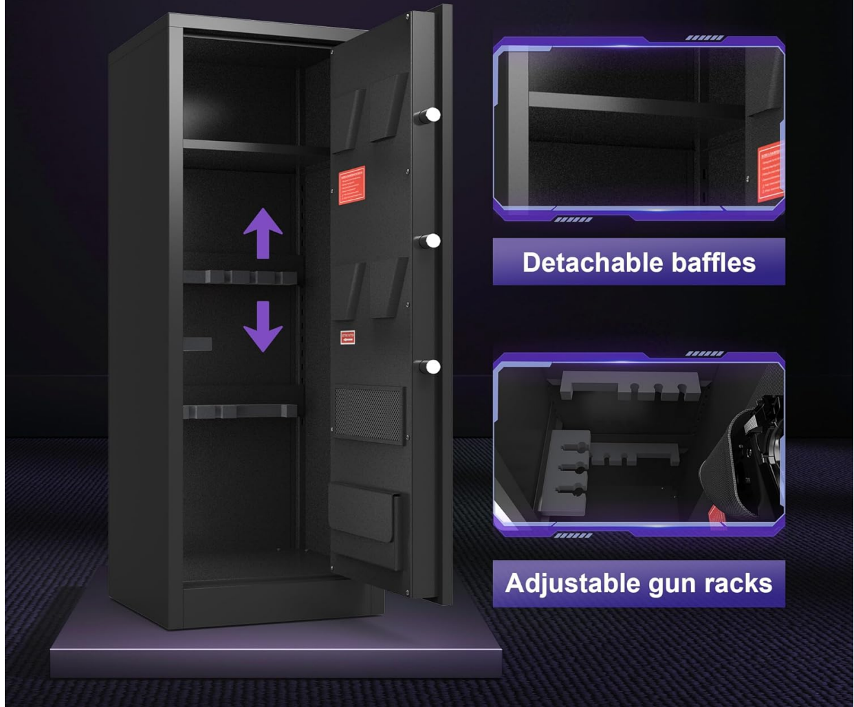
Figure 5: Adjustable interior components for flexible storage.