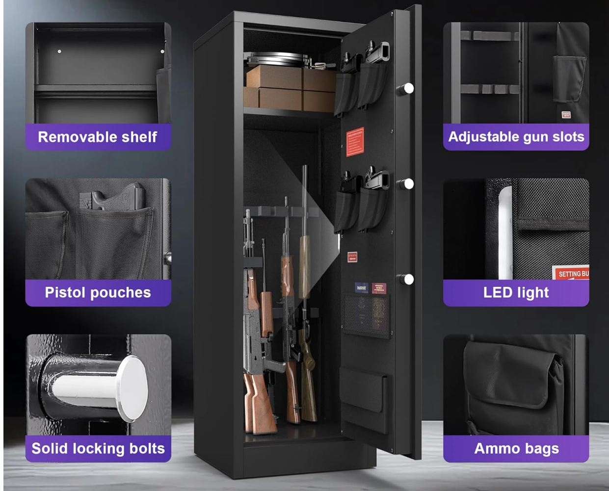
Figure 3: Interior features of the Marcree 8-10 Gun Safe.