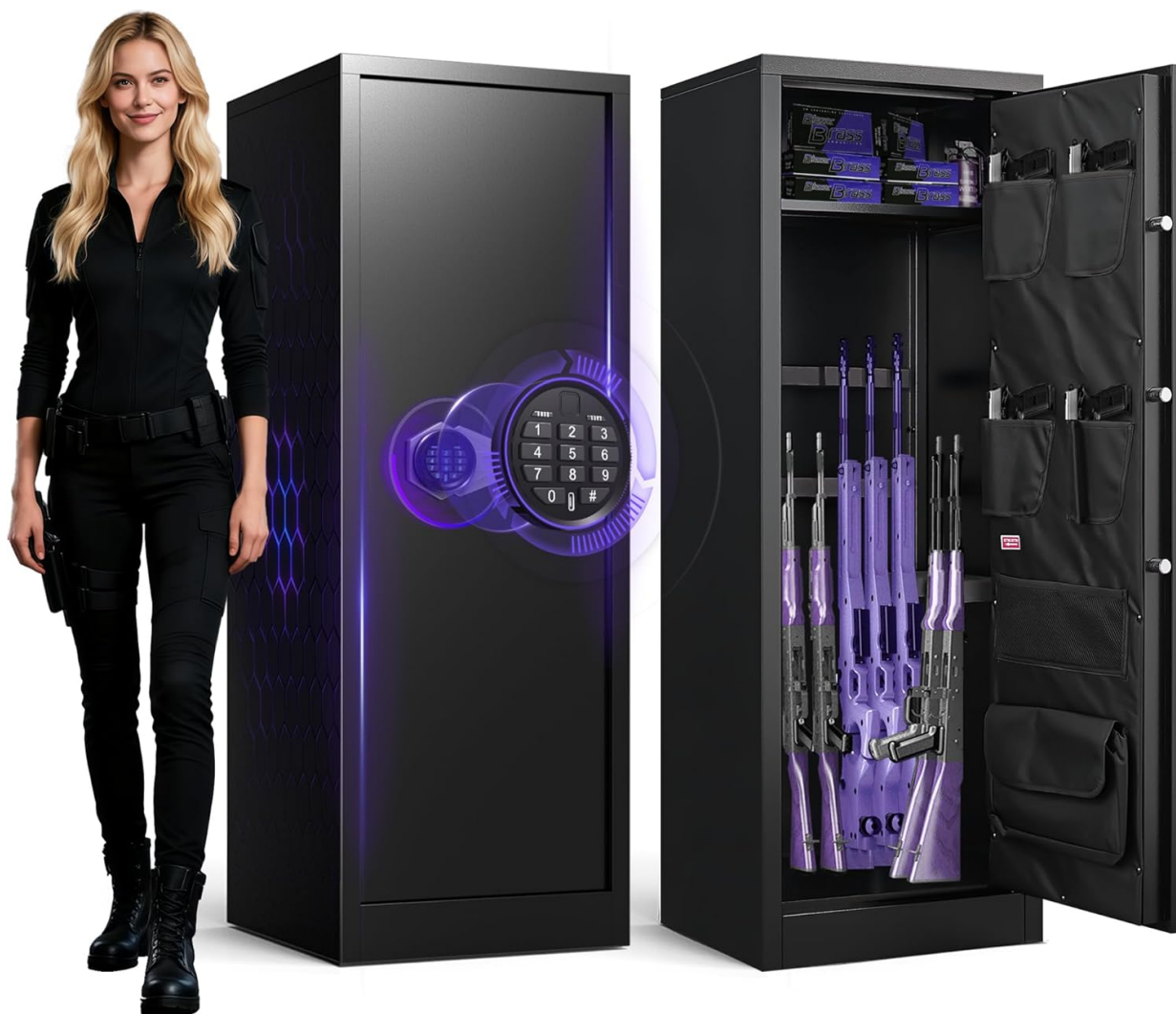
Figure 1: Marcree 8-10 Gun Safe, showing both closed and open interior views.

This manual provides comprehensive instructions for the assembly, operation, and maintenance of your Marcree B3-10D-5 8-10 Gun Safe. Designed for secure storage of firearms, this cabinet features robust construction, an intelligent digital locking system, and flexible interior organization. Please read this manual thoroughly before installation and use to ensure proper functionality and safety.