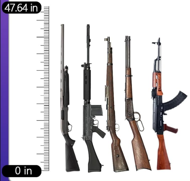
Figure 6: Visual representation of the safe's capacity and dimensions.

i THIS GUN SAFE HOLDS 8 - 10 LONG GUNS AND 4 HANDGUNS. WITH DETACHABLE PARTITIONS, IT ADAPTS TO FIREARM LENGTHS.