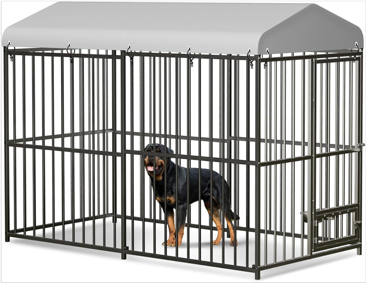
Image 1: Gaderth 8x4x6 FT Heavy-Duty Outdoor Metal Dog Kennel with a large dog inside.