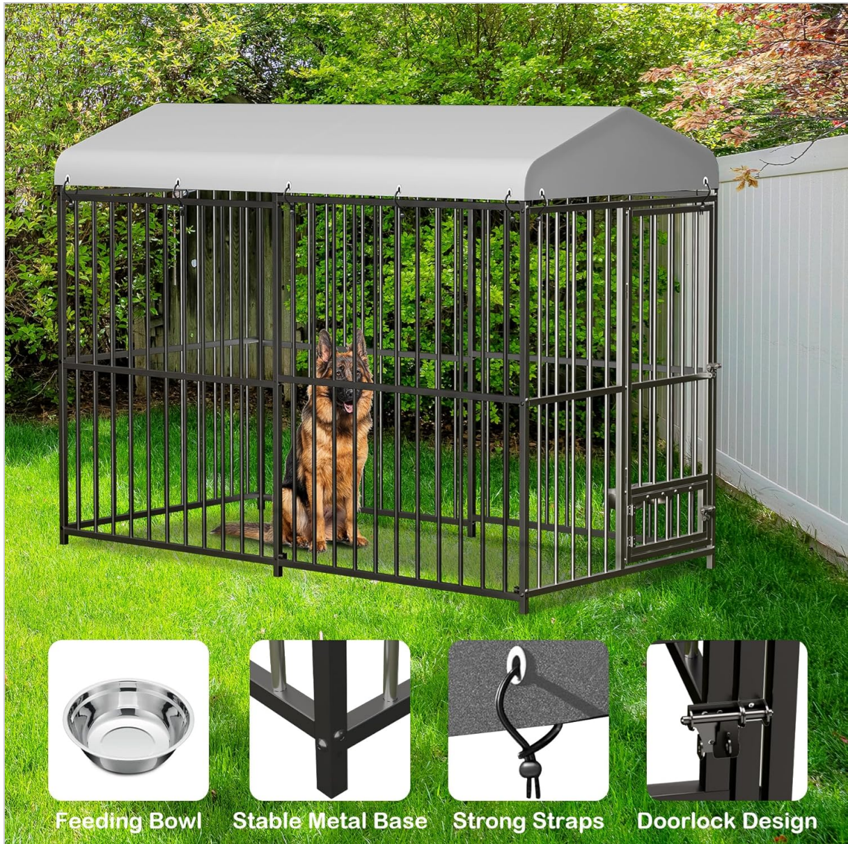
Image 2: Key features of the Gaderth kennel, highlighting the feeding bowls, stable base, roof straps, and door lock.