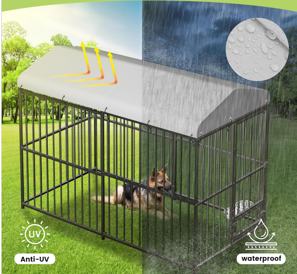
Image 3: The kennel's waterproof and anti-UV roof provides essential protection from the elements.