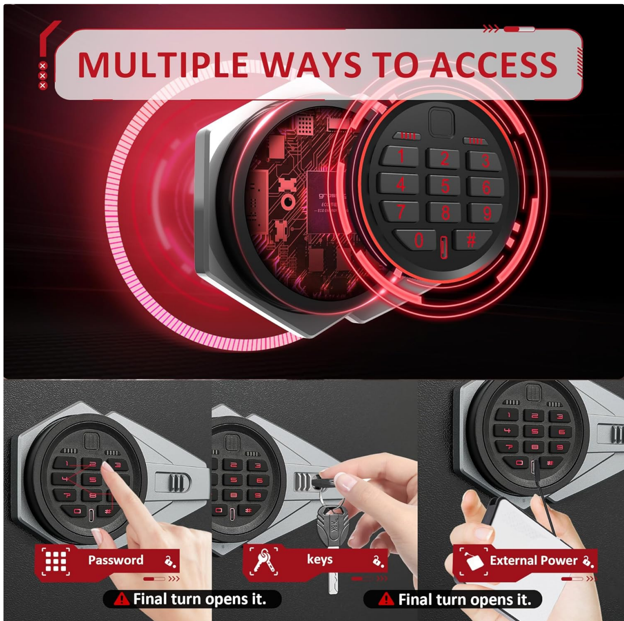
Image 5.1: Multiple access methods for the Marcree B3-8D-1 Rifle Safe.

If the internal batteries are depleted, connect the emergency battery box to the external power port on the keypad. This will provide temporary power to enter your code and open the safe. Replace internal batteries immediately after gaining access.