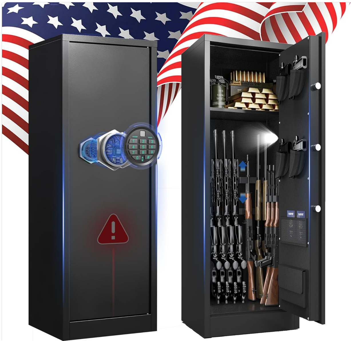
Image 1.1: Marcee B3-8D-1 Rifle Safe, illustrating its design and internal storage capacity.