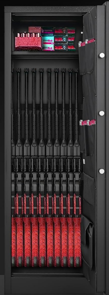
Image 2.1: Overview of the safe's robust construction and security elements.