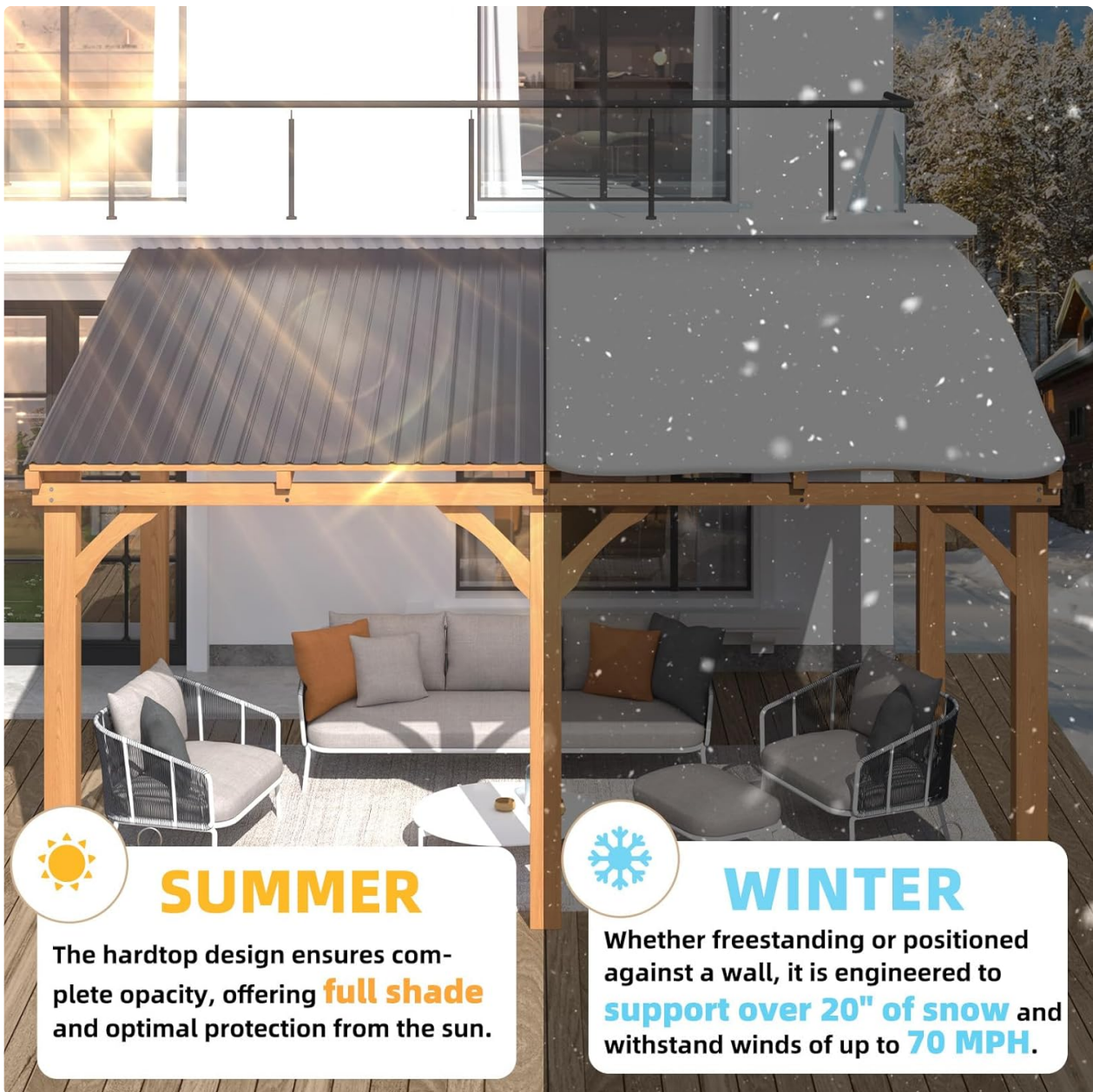
Image: Depiction of the gazebo's hardtop design providing full shade in summer and supporting snow in winter.