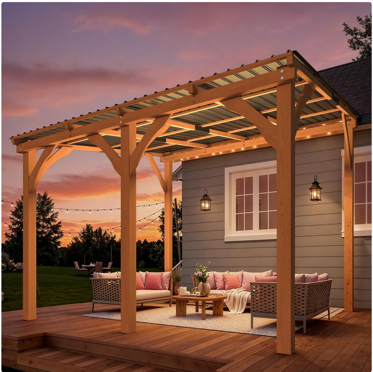
Image: The gazebo configured as a wall-mounted lean-to, extending living space from a home.