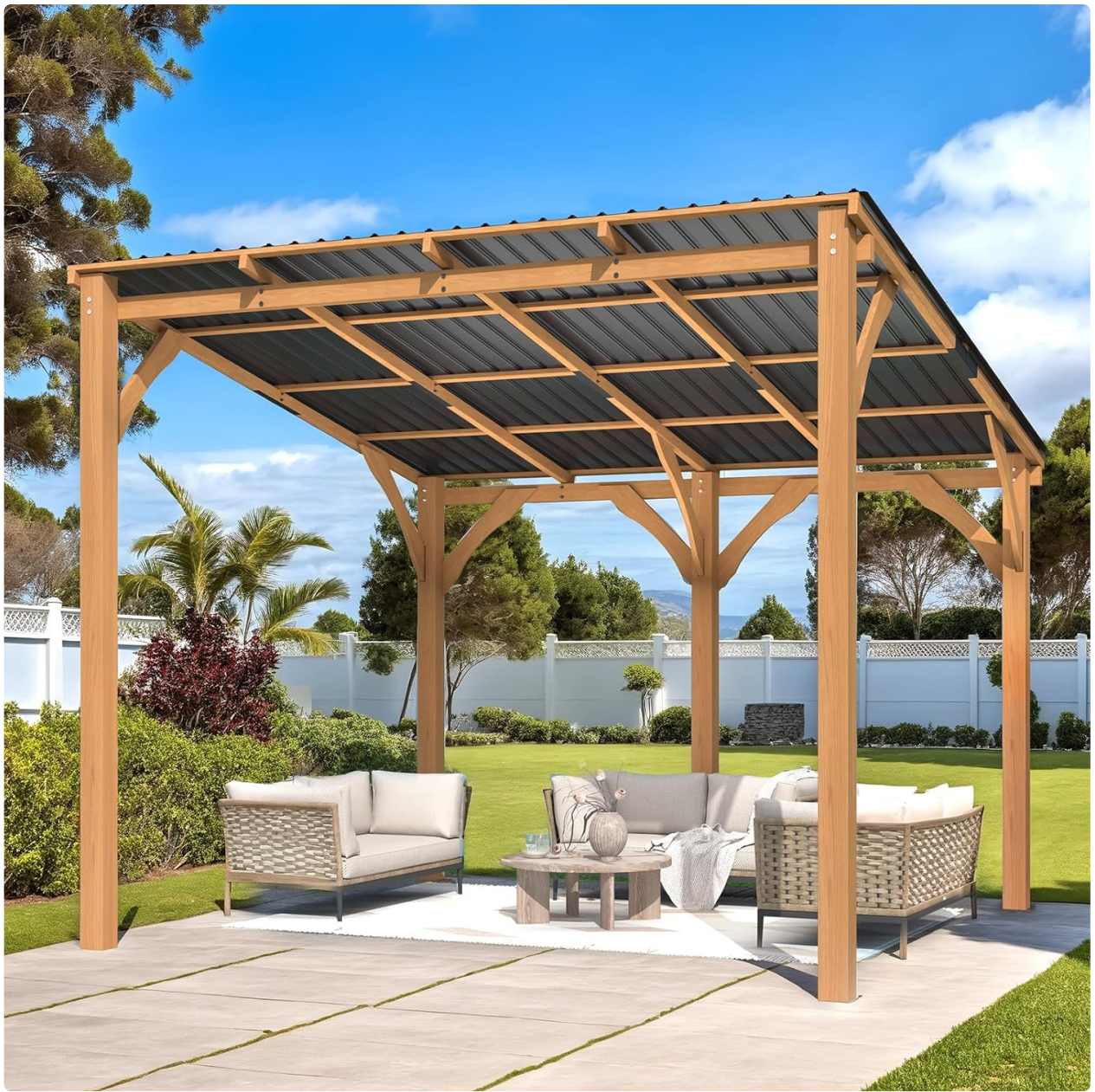
Image: AECOJOY 10' x 10' Wood Cedar Gazebo providing shade in a spacious backyard.