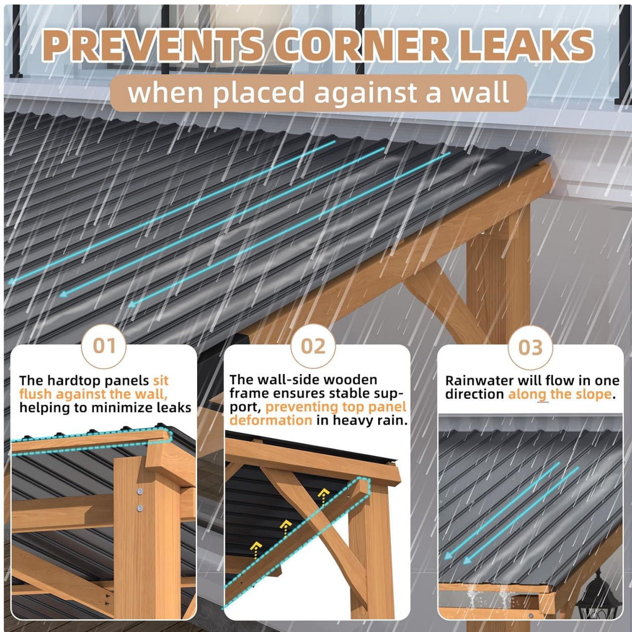
Image: Illustration detailing the design features that prevent corner leaks and ensure effective rainwater drainage.