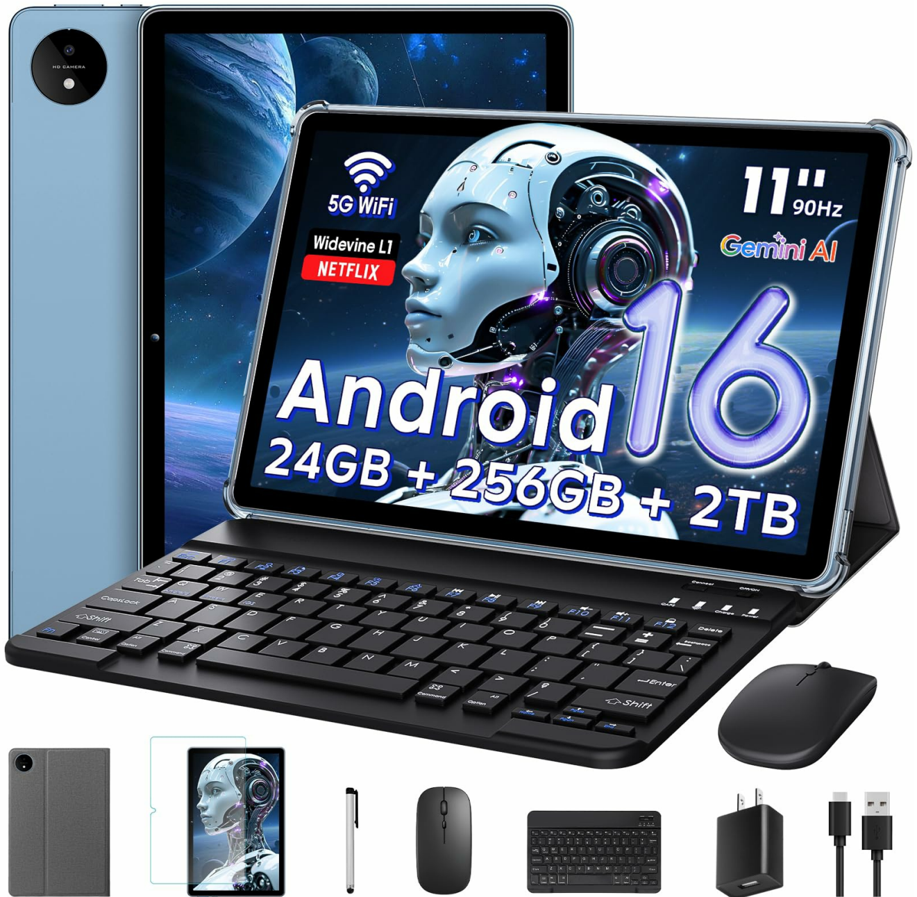
Figure 1: Raemond M70 11-inch Android 16 Tablet.