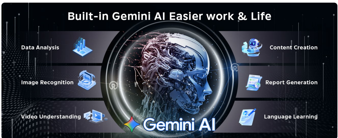
Figure 4: Gemini AI capabilities for enhanced productivity.