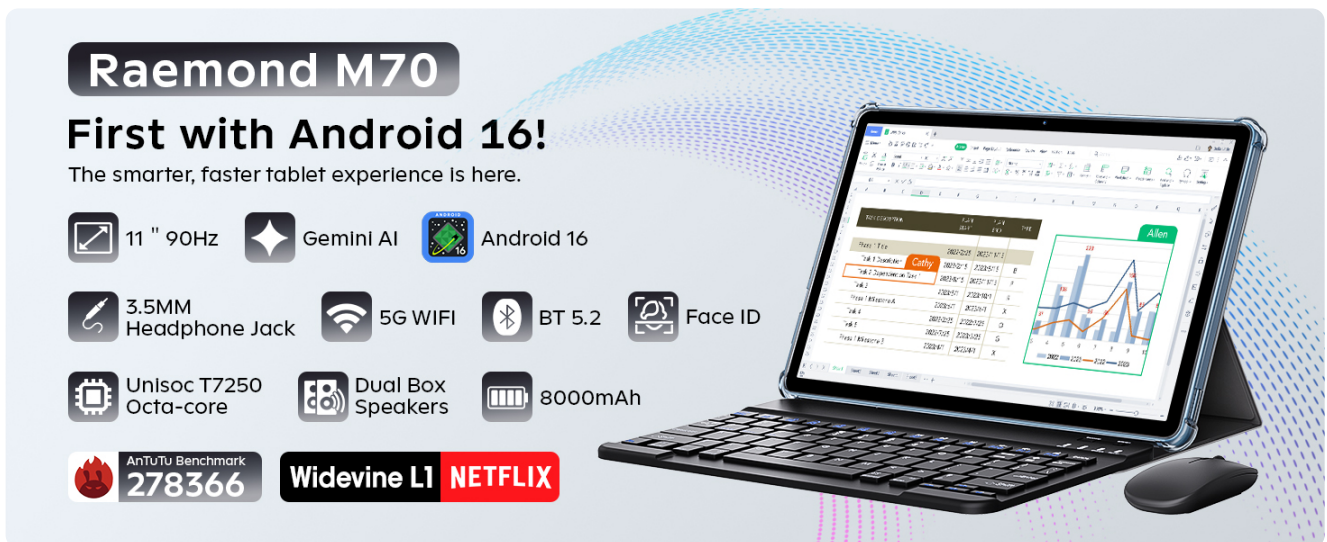
Figure 3: Overview of Android 16 features on the tablet.