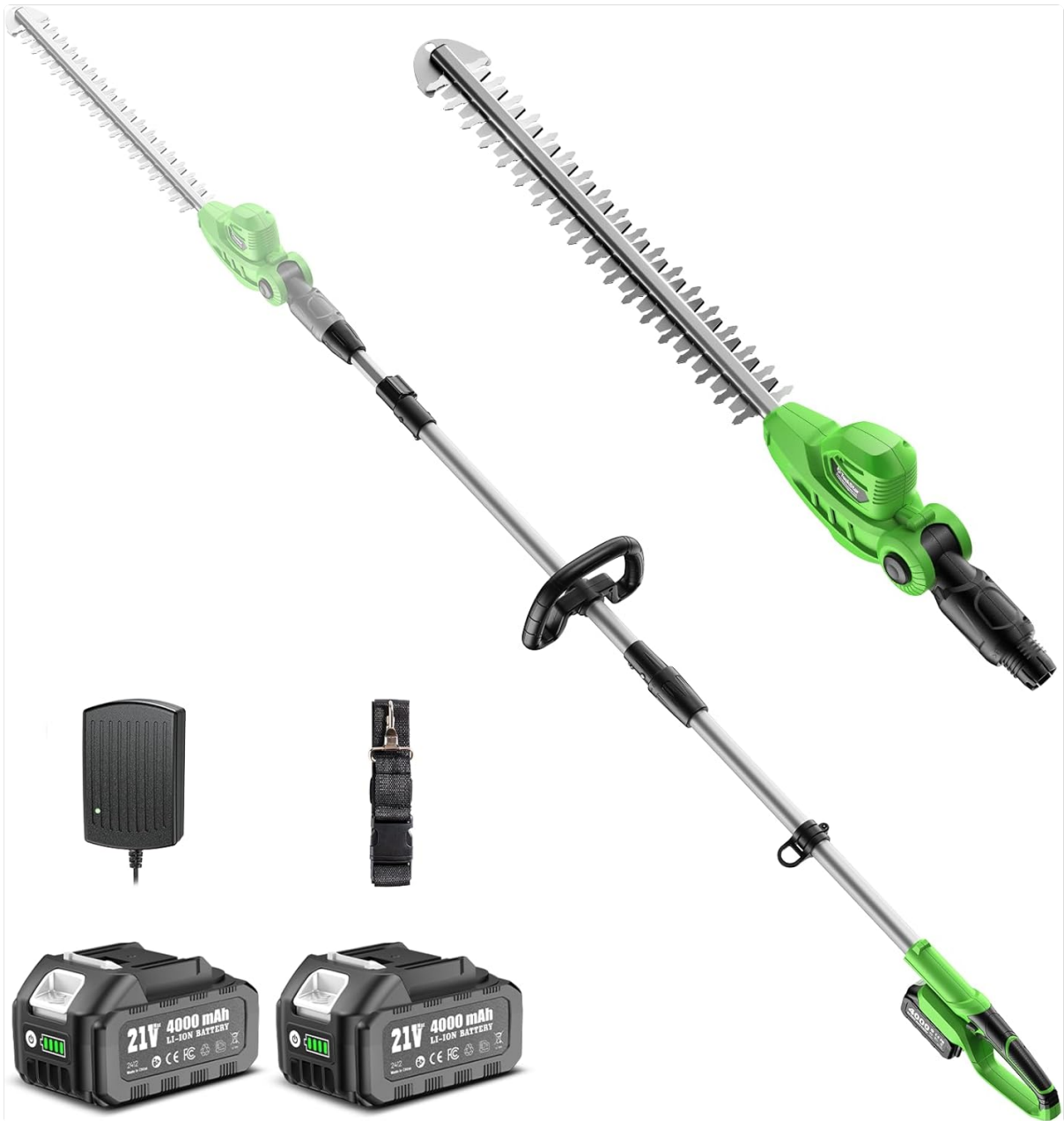
Image: All components of the TaskStar Cordless Pole Hedge Trimmer kit, including the trimmer head, telescopic pole, power grip, batteries, charger, handle, shoulder strap, and blade cover.