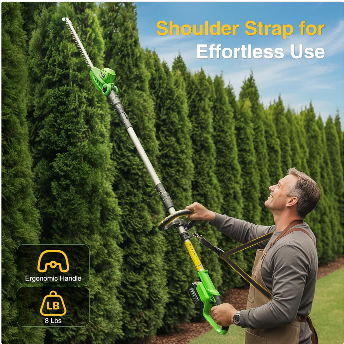
Image: A person operating the hedge trimmer with the shoulder strap attached and holding the ergonomic handle, demonstrating comfortable use.