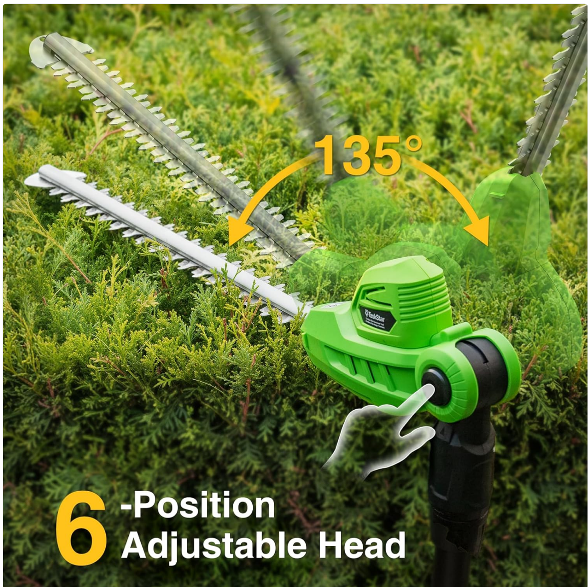
Image: The hedge trimmer head shown rotating up to 135 degrees, highlighting its adjustable positions for various cutting angles.