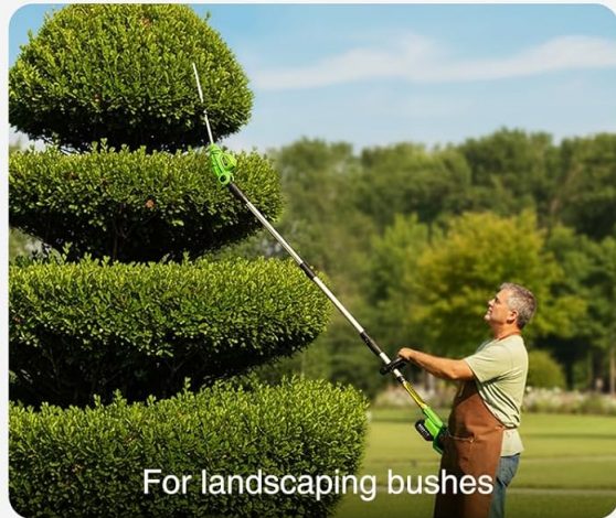
Image: A collage showing the hedge trimmer being used in various scenarios, including trimming tall hedges, shaping small trees, maintaining garden shrubs, and landscaping bushes.