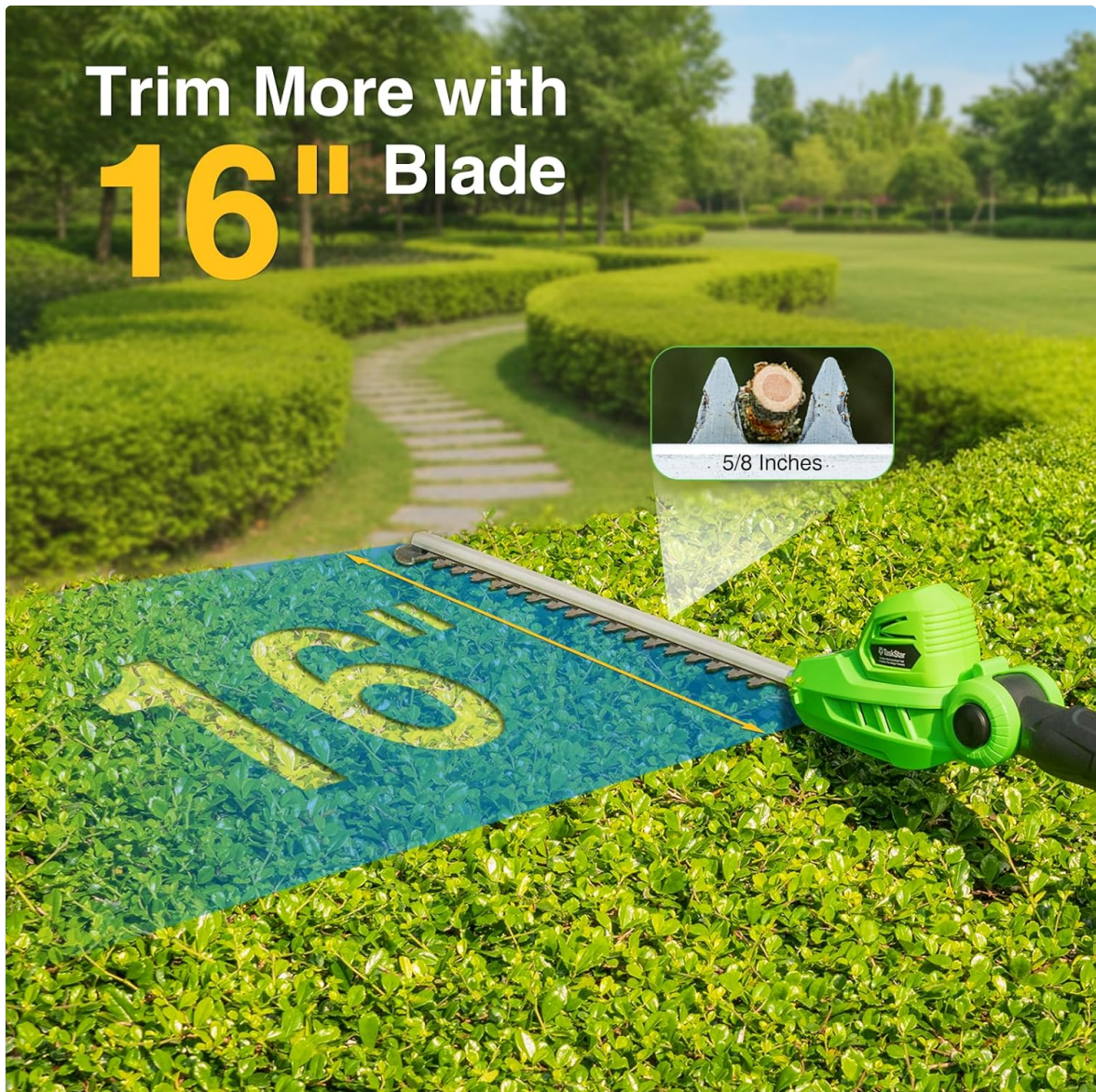
Image: Close-up of the 16-inch dual-action blade cutting through a hedge, illustrating its 5/8-inch cutting capacity.