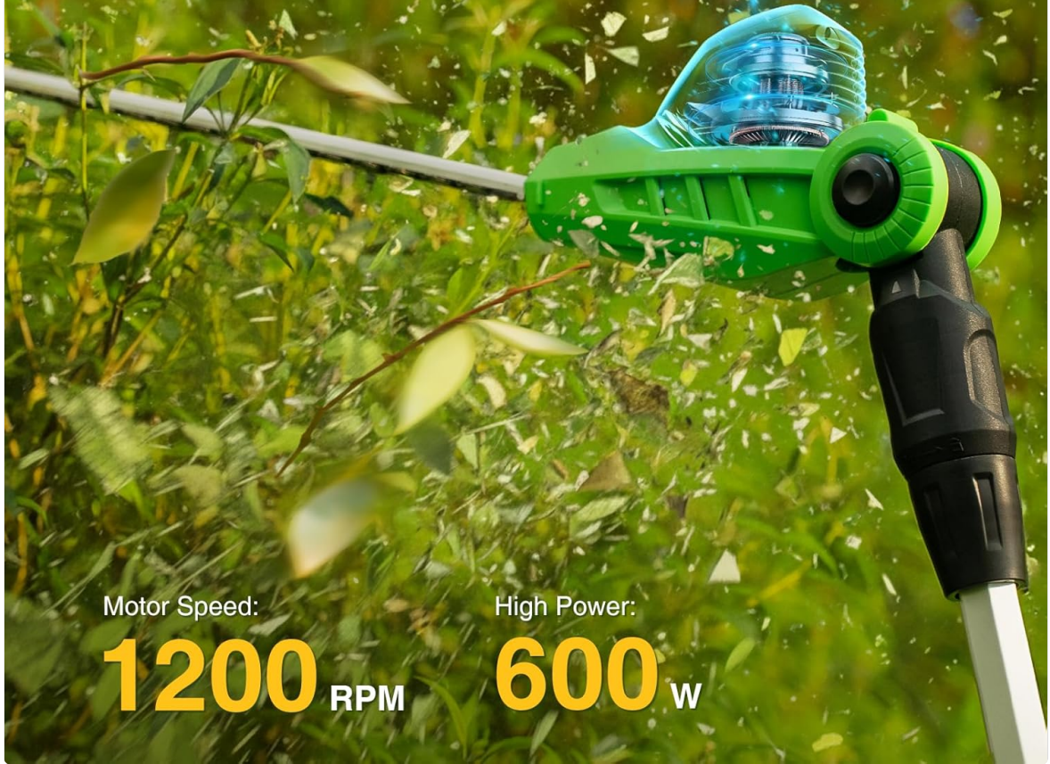
Image: A visual representation of the hedge trimmer's motor, indicating its 600W power and 1200 RPM speed for efficient cutting.