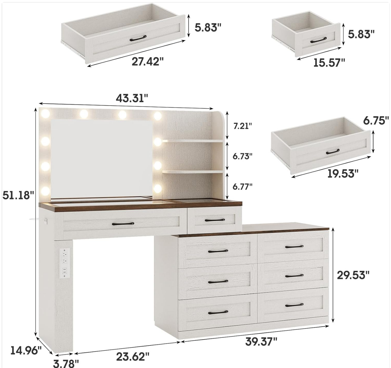
Image: Detailed diagram illustrating the overall dimensions of the vanity desk and its components, including the mirror, shelves, and various drawers.