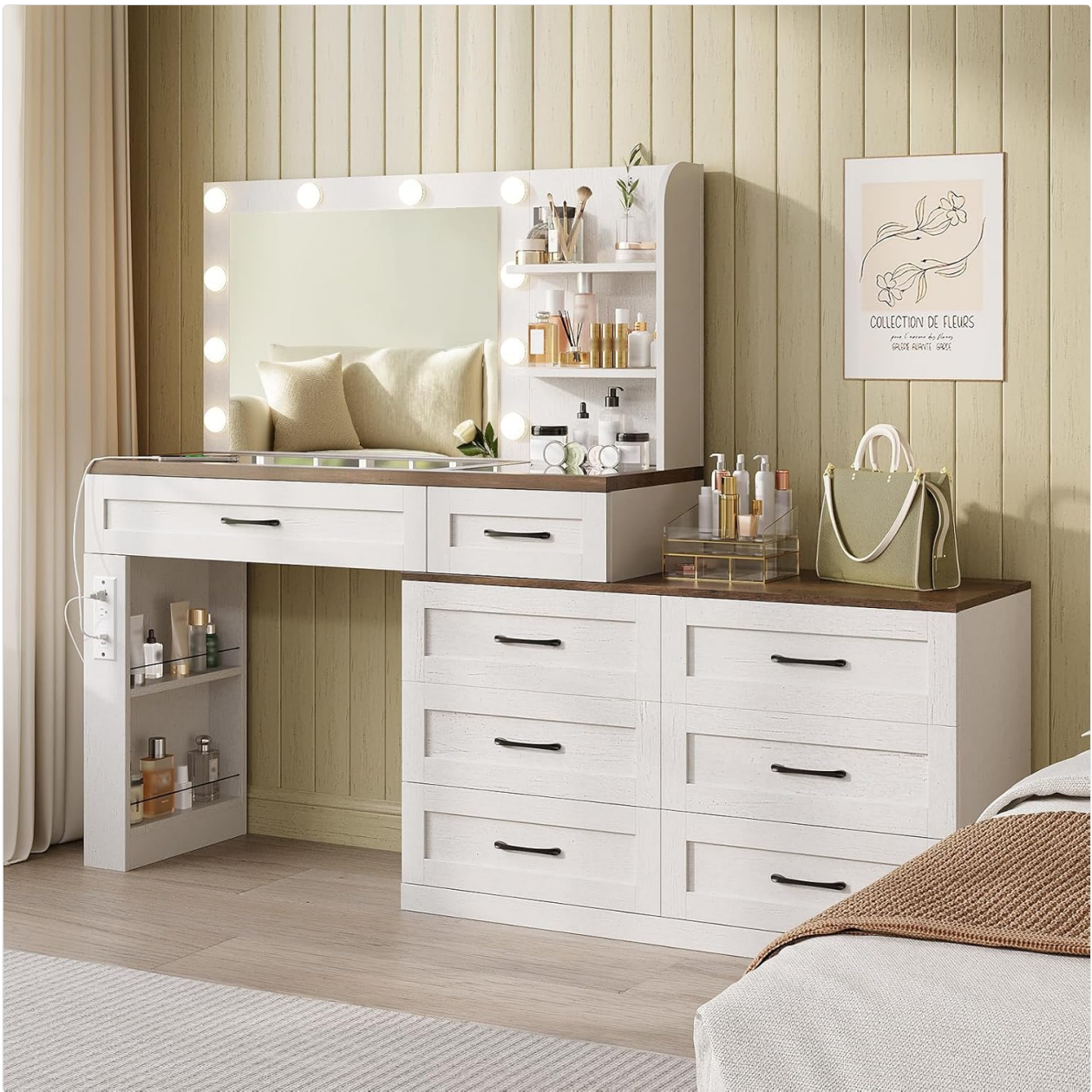
Image: A fully assembled Vabches Farmhouse Large Makeup Vanity Desk, showcasing its design and placement within a room.