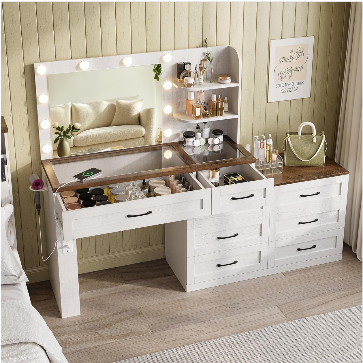
Image: The vanity desk with all drawers pulled open, revealing various compartments and organized beauty products, jewelry, and accessories.