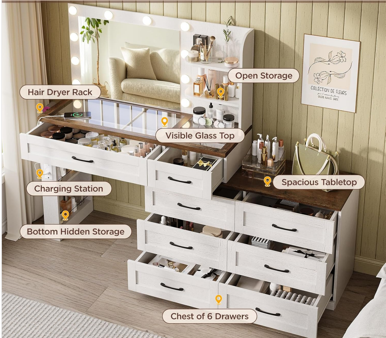
Image: An aerial view of the vanity desk, pointing out features like the visible glass top, open storage shelves, hair dryer rack, charging station, bottom hidden storage, and a chest of 6 drawers.

Designed to keep your everyday beauty essentials well organized