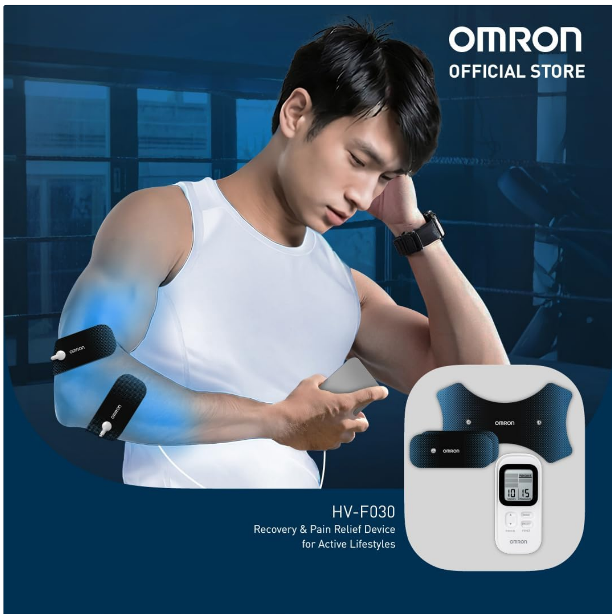
Figure 4.4: Device in Use. This image shows an individual utilizing the HV-F030 device, with the pads correctly positioned on the arm for targeted stimulation, illustrating a common application for muscle recovery.