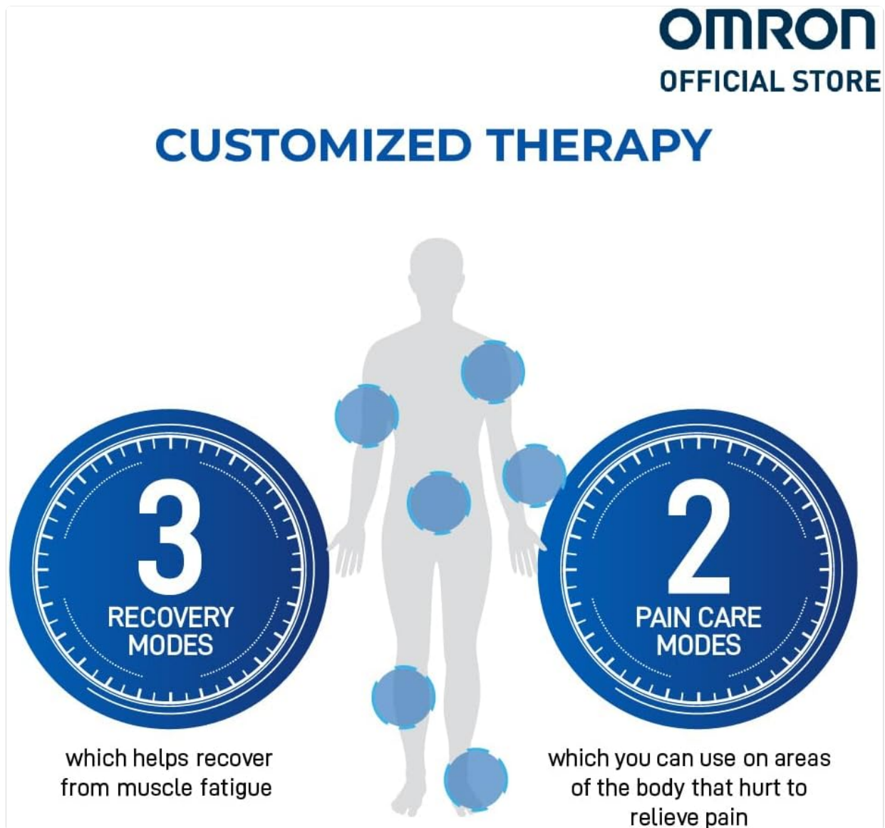
Figure 4.3: Optimal Usage Scenarios for HV-F030. This image illustrates two primary applications for the device: aiding recovery after exercise and providing relief for sports-related discomfort.

The HV-F030 is recommended for active lifestyles and sports recovery, including post-exercise muscle fatigue and general sports-related pain relief.