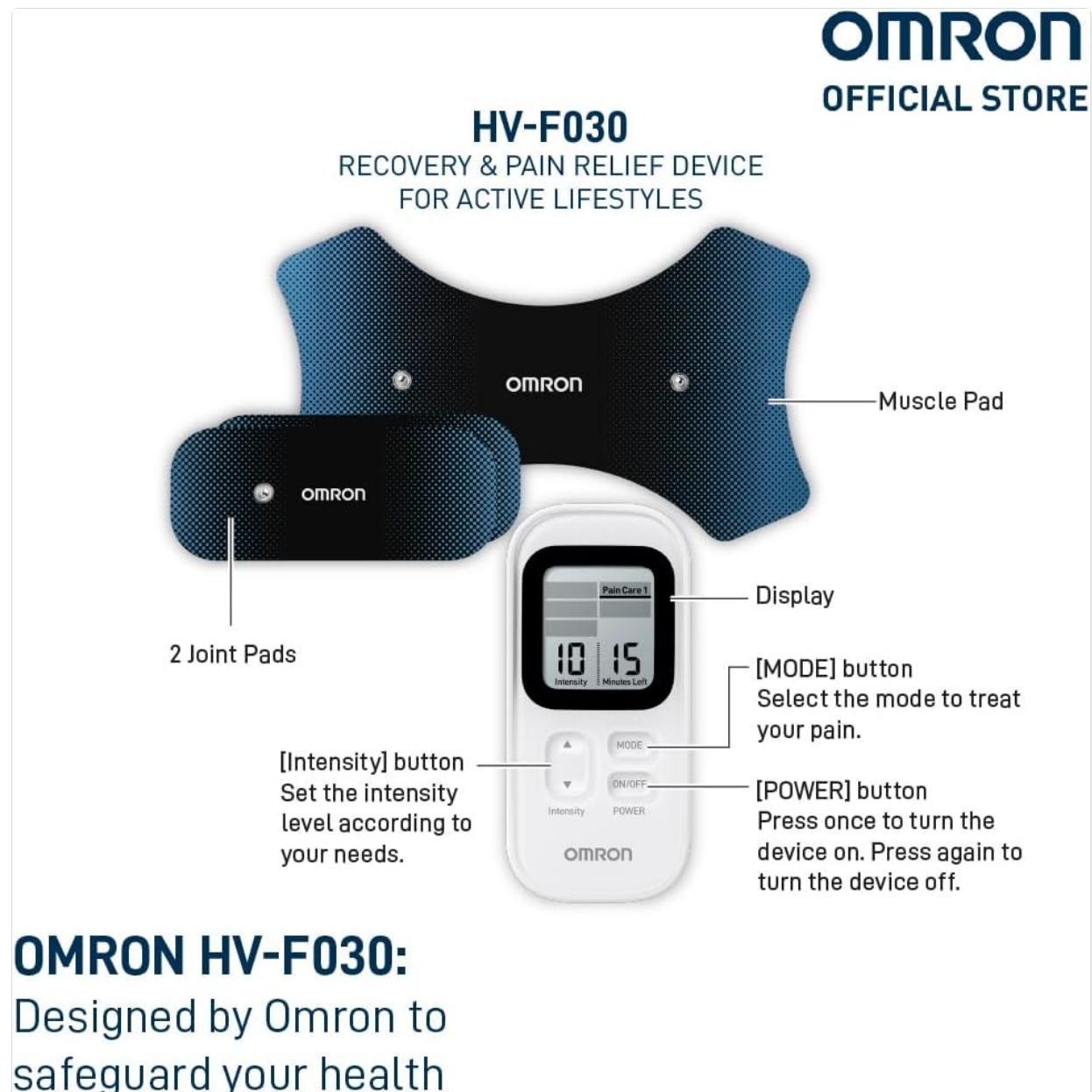
Figure 3.1: OMRON HV-F030 Device and Pads. This image displays the main components of the HV-F030 system, including the compact control unit, a large pad designed for major muscle groups, and two smaller pads suitable for joint areas.