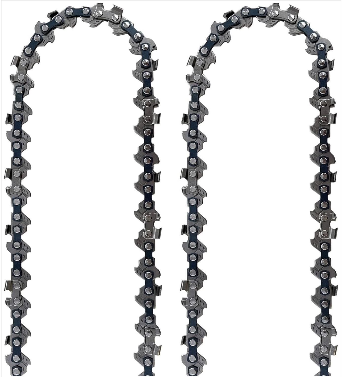
Image: Two new Opladuo 6-inch chainsaw chains are shown in a coiled state, illustrating their compact form before being stretched onto a guide bar. The chains are made of durable metal with sharp cutting teeth.