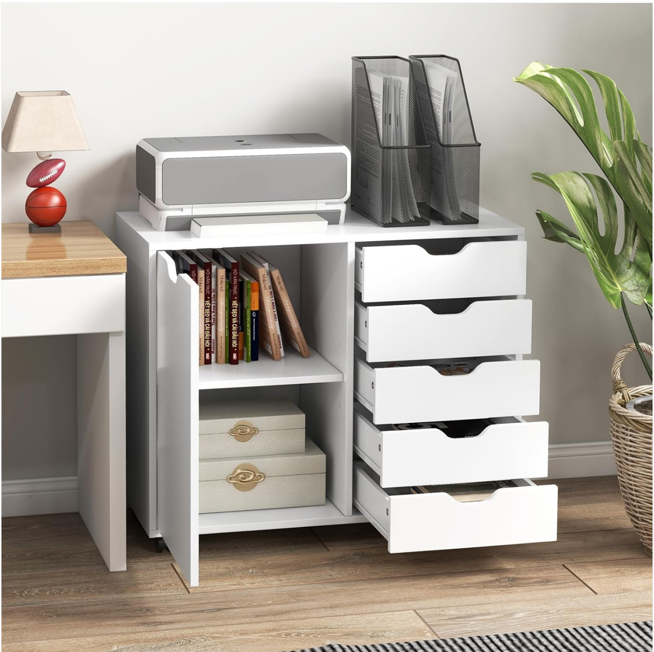
Figure 6: The desk cabinet integrates seamlessly into various office environments, providing practical storage.