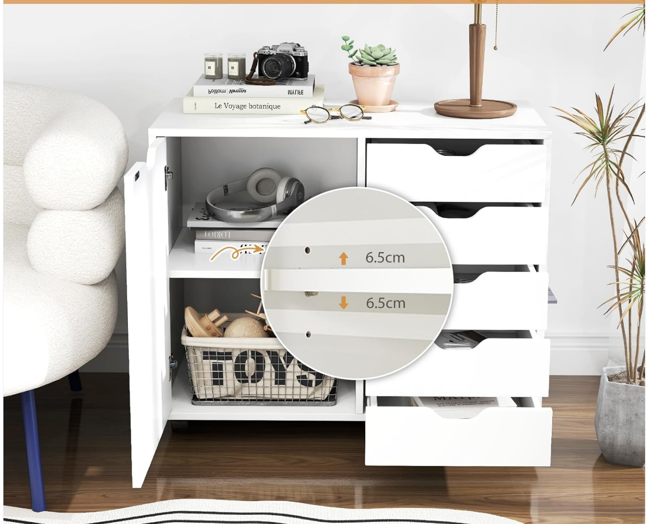
Figure 2: Product dimensions. The cabinet measures approximately 78 cm (width) x 40 cm (depth) x 65 cm (height).