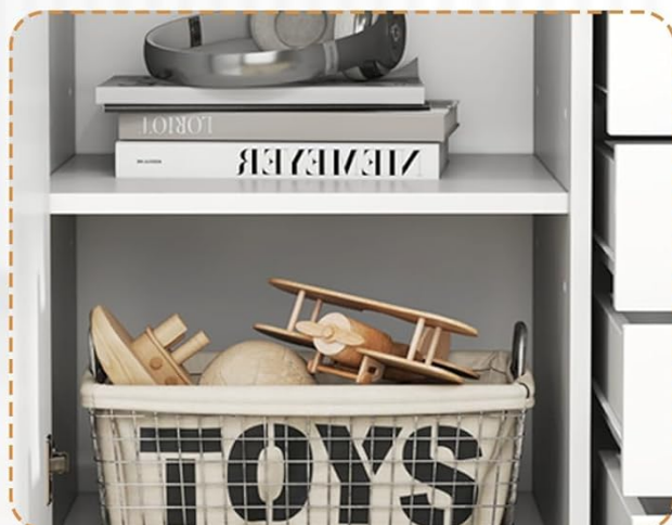
Figure 3: The cabinet features five drawers and a side cabinet with an adjustable shelf, providing ample storage for various items.