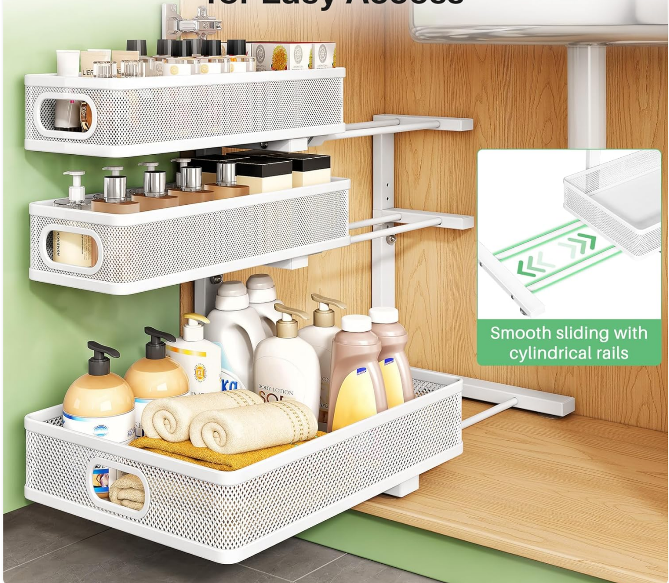
Image 6.1: The smooth sliding mechanism of the drawers, allowing easy access to stored items.

Your browser does not support the video tag.