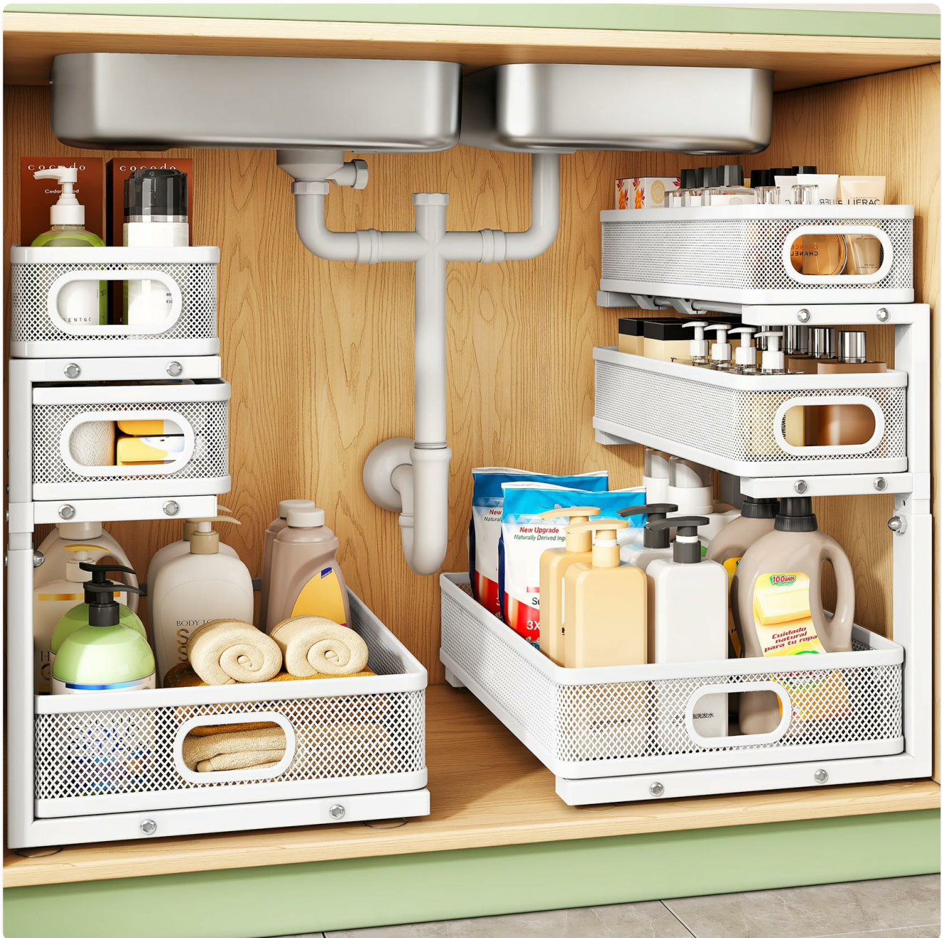
Image 1.1: The Kitstorack 3-Tier Under Sink Organizer shown installed in a kitchen cabinet, demonstrating its space-saving design.