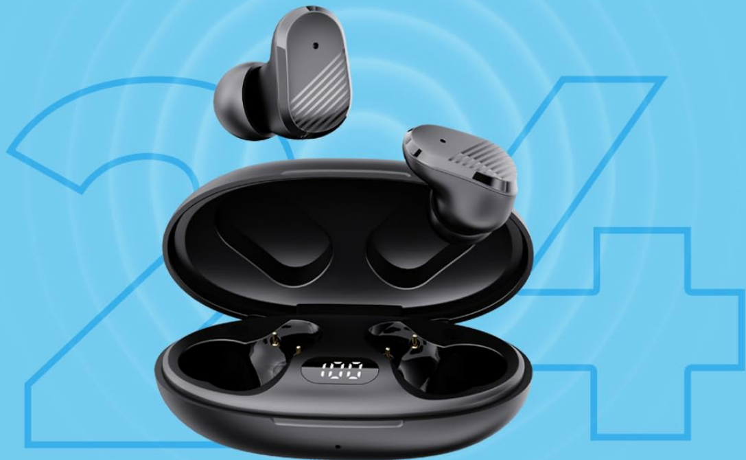
Image: The pTron Basspods P11 earbuds are designed for a snug and lightweight fit, with each bud weighing only 4 grams.