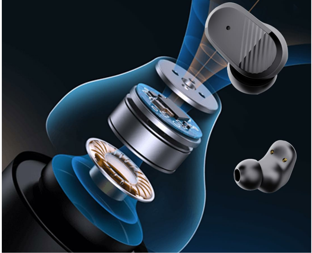
Image: The pTron Basspods P11 earbuds and their charging case, showcasing key features such as Passive Noise Cancellation, IPX4 Water/Sweat-Resistance, and convenient Type-C Charging.