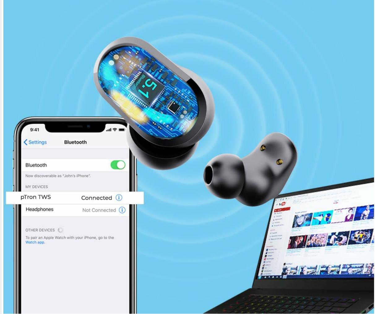
Image: The pTron Basspods P11 earbuds and charging case positioned near a smartphone displaying a video, demonstrating the seamless audio and video synchronization provided by the built-in Movie and Music modes.

BT5.1 | Stable Connectivity | Wide Compatibility