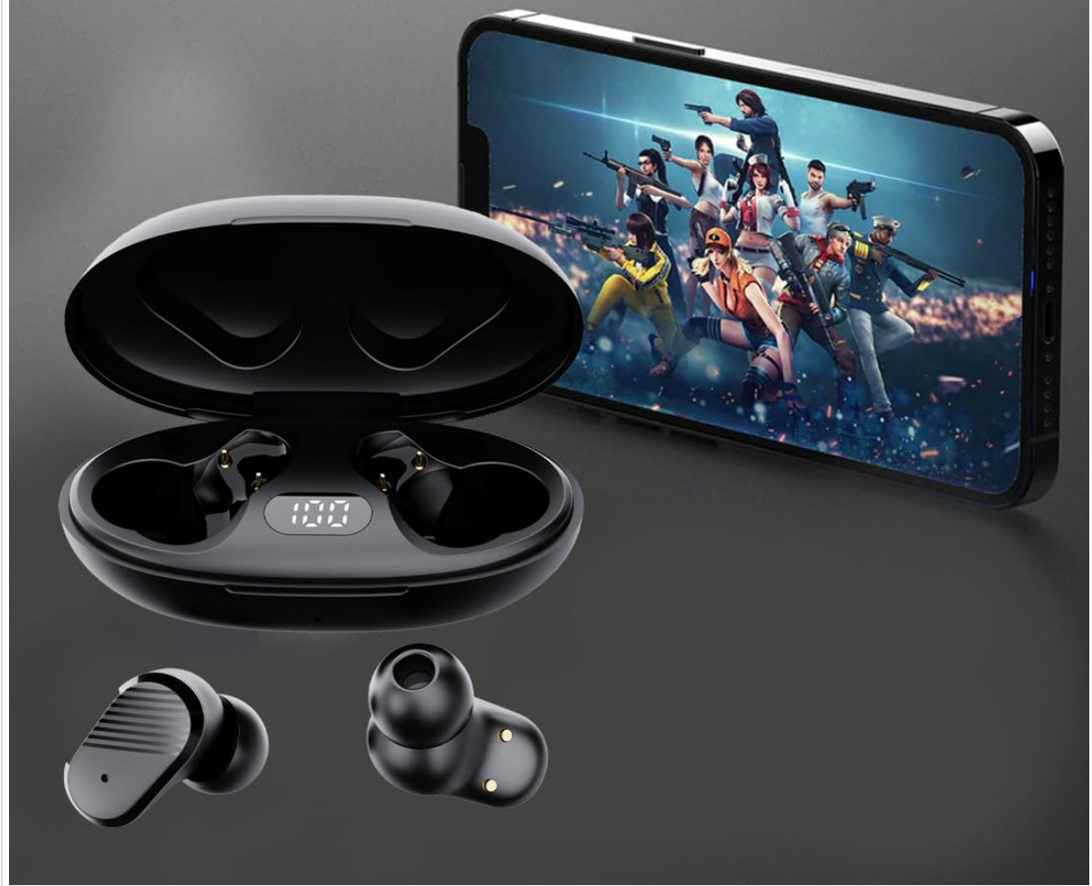
Image: The pTron Basspods P11 earbuds in their charging case, which features a digital display and provides up to 24 hours of total playtime.