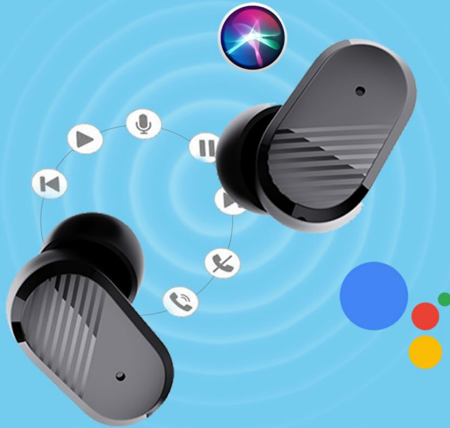
Image: A visual representation of the quick and easy Bluetooth 5.1 pairing process for the pTron Basspods P11 with a smartphone.