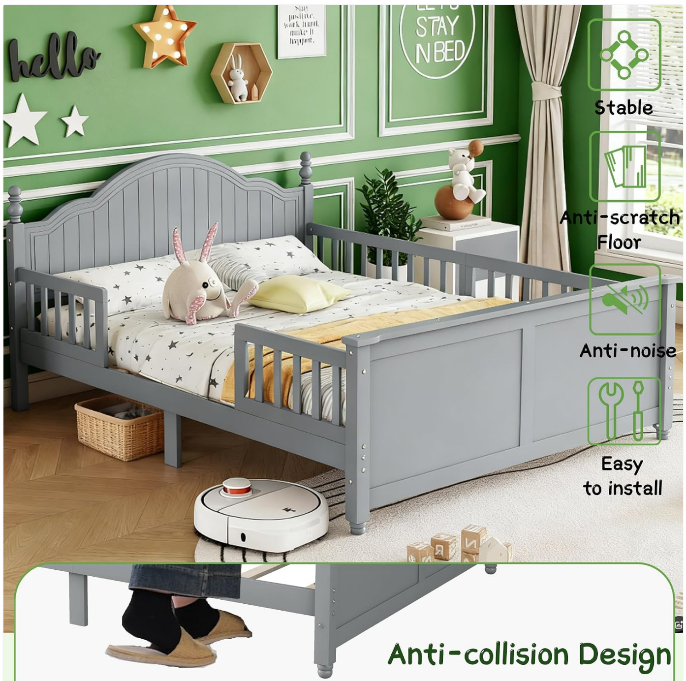
Figure 3.1: Bed frame dimensions and weight capacity. Full Size: 78.7"L x 57.2"W x 36"H. Recommended Mattress: 6-8 inch. Max weight: 300 lbs.