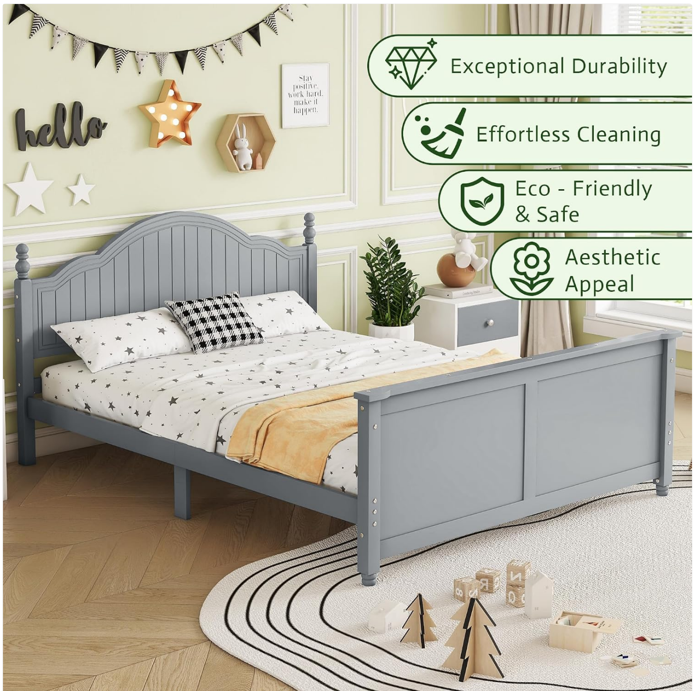
Figure 6.1: Features such as exceptional durability, effortless cleaning, and eco-friendly materials.