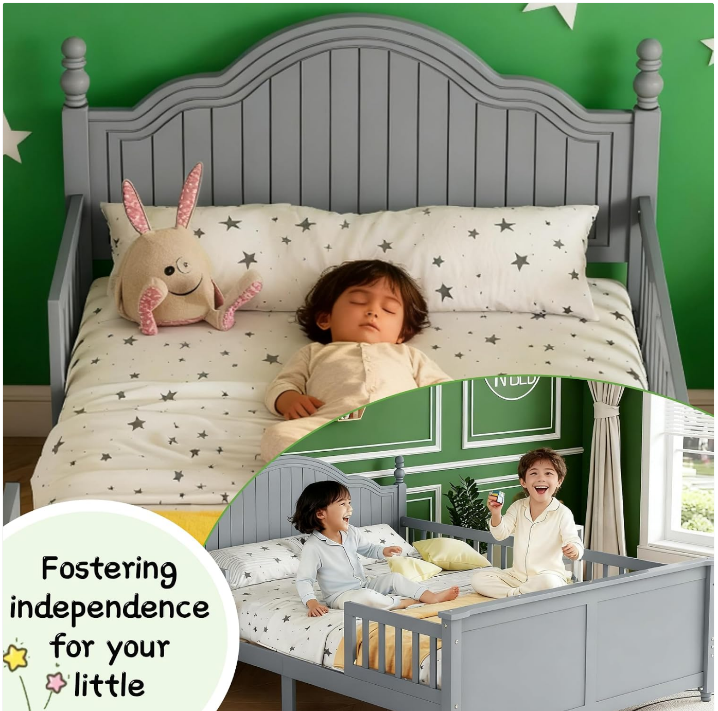
Figure 5.1: A child sleeping in the bed, demonstrating the use of guardrails for safety and fostering independence.

Your browser does not support the video tag.