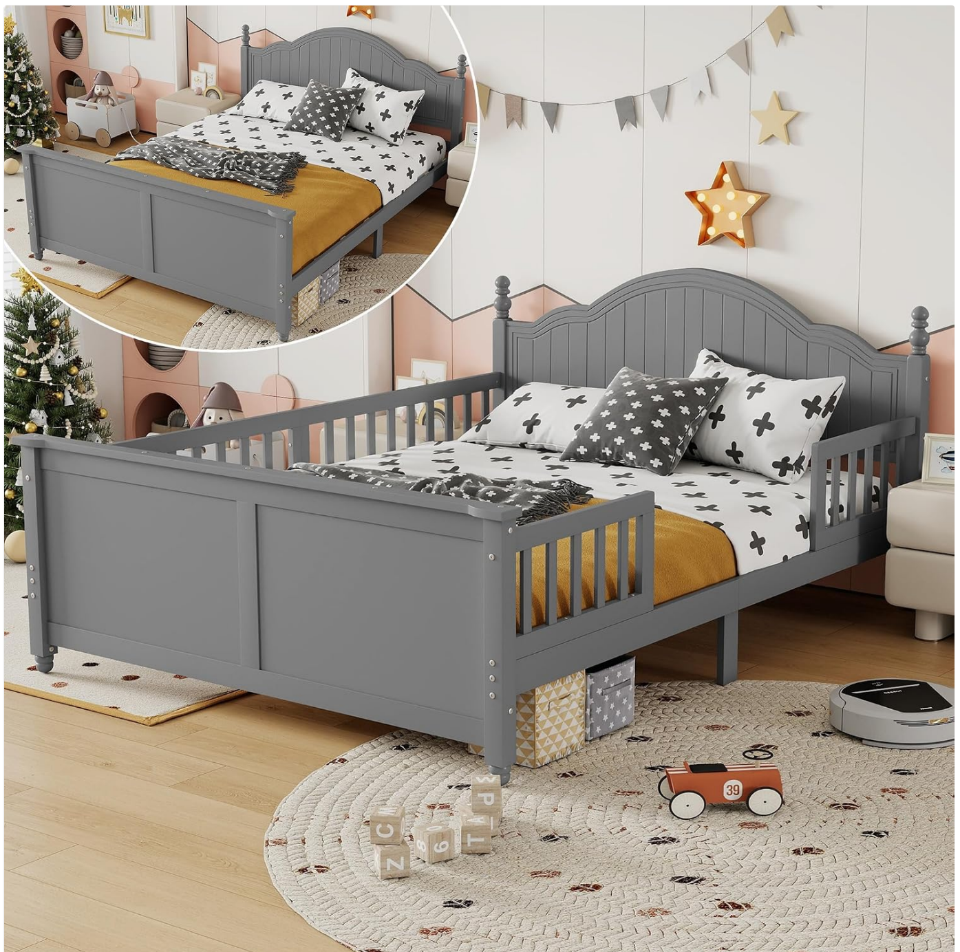
Figure 4.2: Fully assembled Mirightone Kids Full Size Bed Frame.