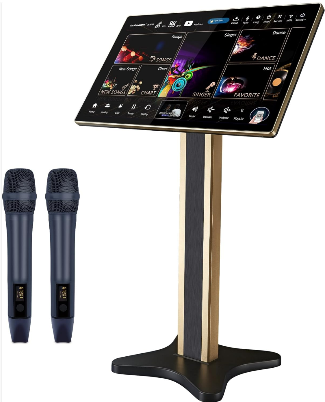
Figure 4.1: InAndOn 4-in-1 Karaoke Machine with two wireless microphones and floor stand.