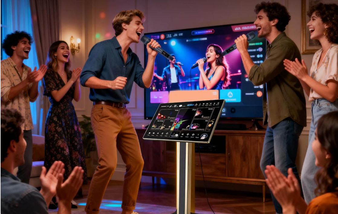
Figure 5.1: The InAndOn Karaoke Machine assembled on its floor stand.

Touchscreen, Karaoke system, and mixer in one compact unit. Save space and easy control, connect to your speakers, and sing your heart out.