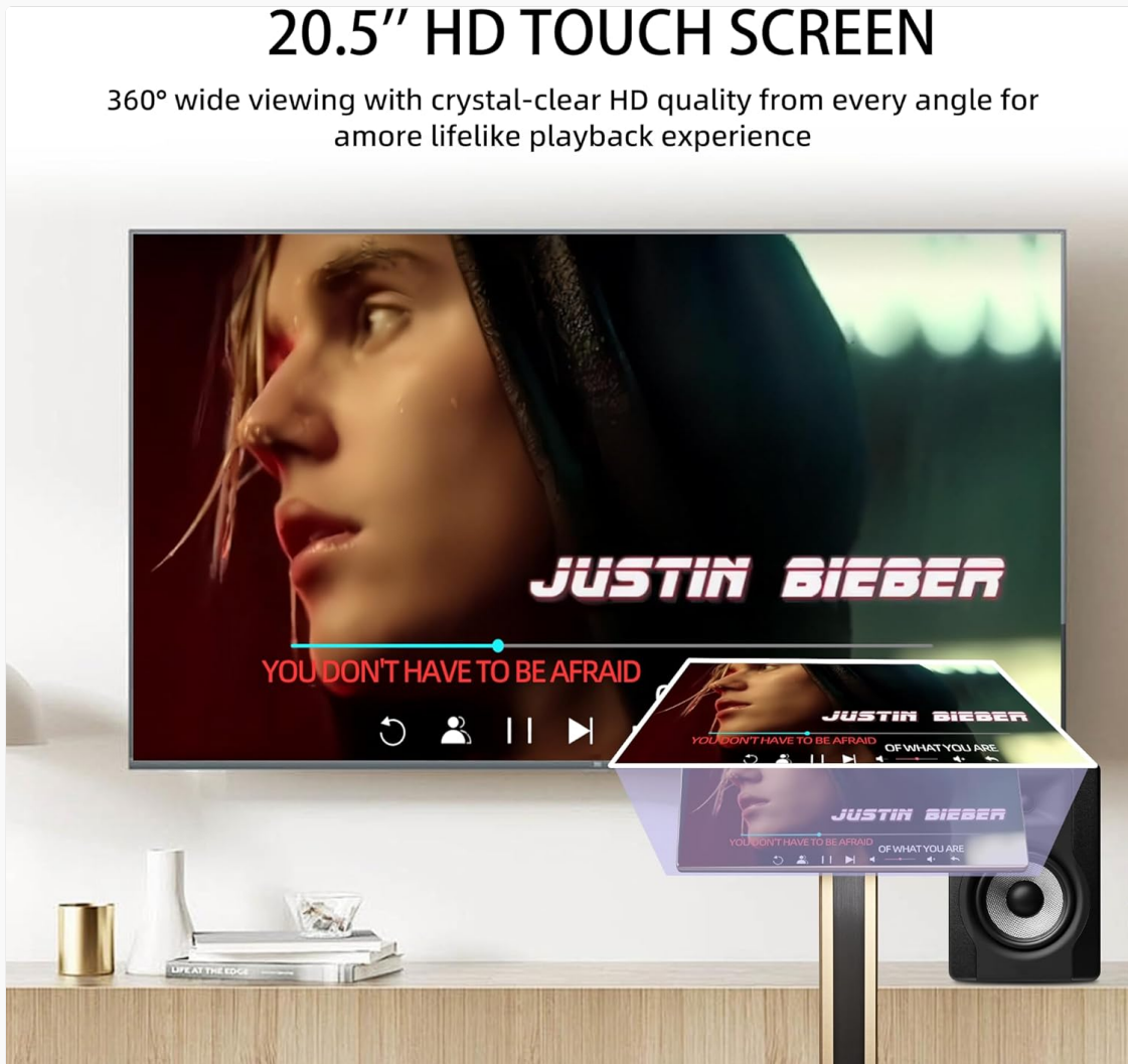
Figure 6.1: The 20.5-inch HD touchscreen in operation.

The 21.5-inch HD touchscreen allows for intuitive control. Tap icons to select functions, swipe to scroll, and use pinch-to-zoom gestures where applicable.