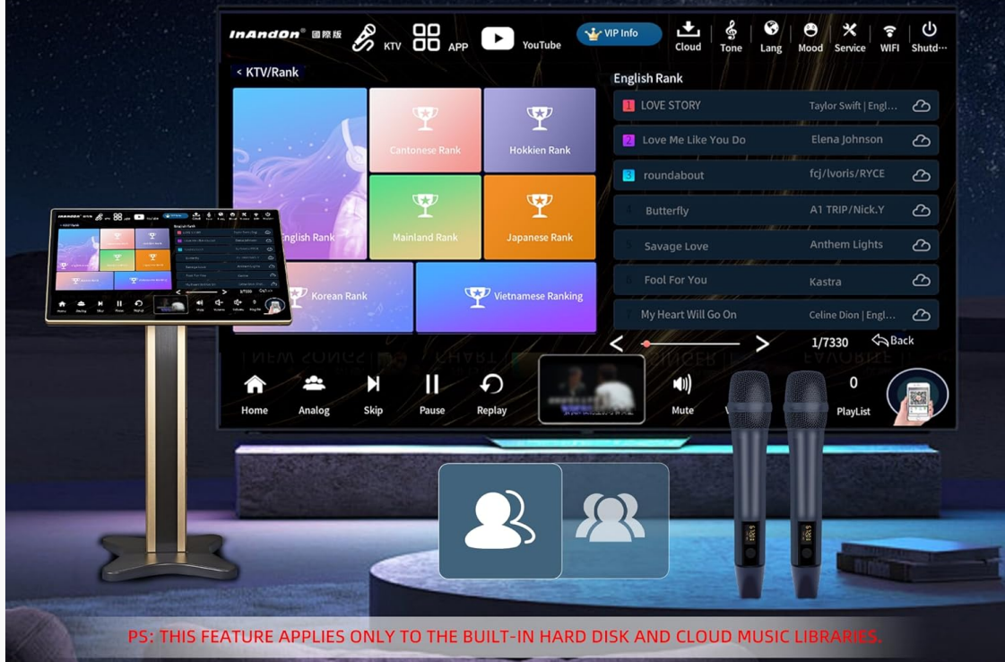
Figure 6.2: Karaoke system interface for song selection.

Original Vocal & Accompaniment Modes – Switch easily between singing with the artist or performing solo with instrumental tracks