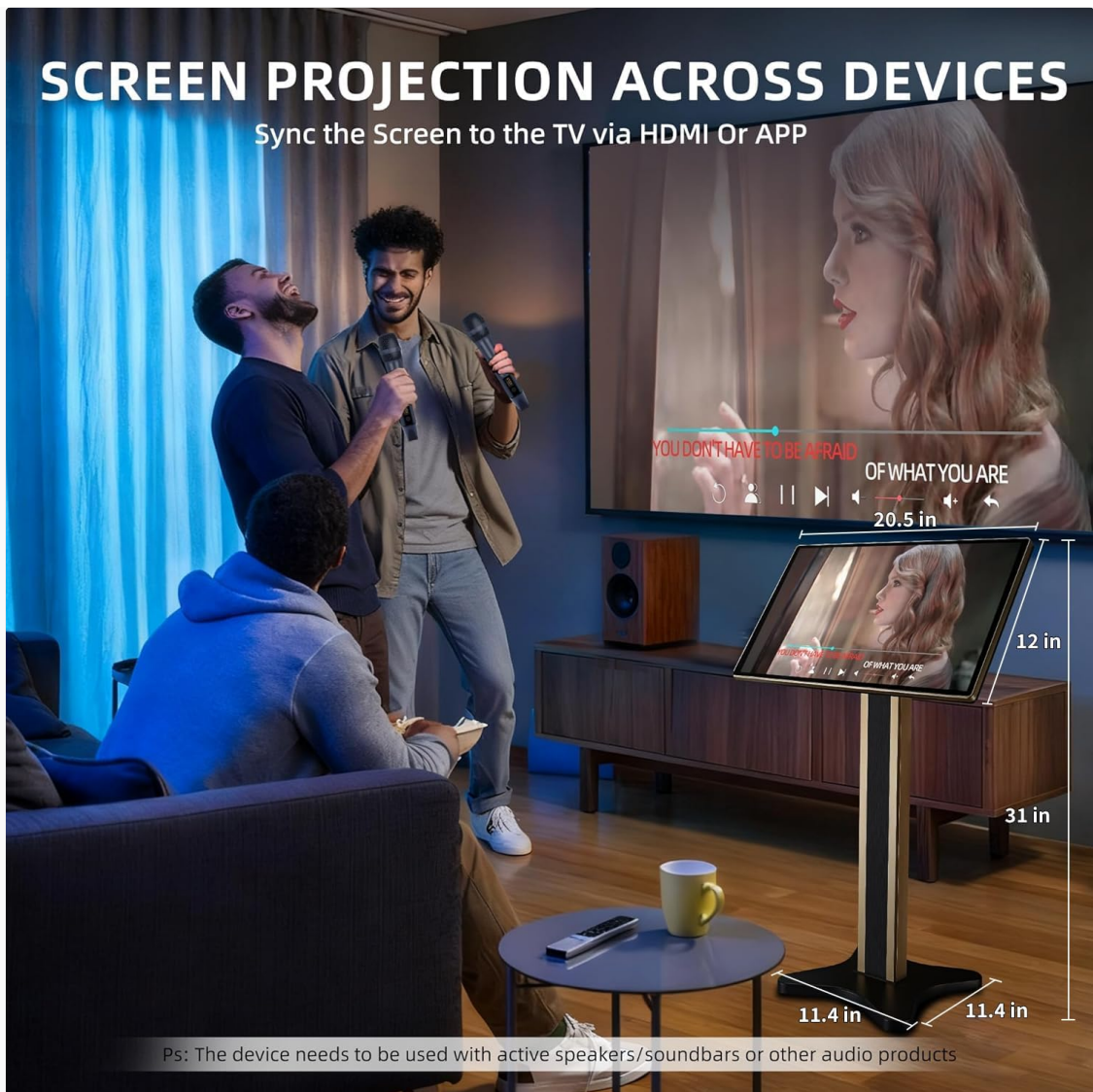
Figure 6.3: Multiple ways to connect and control the karaoke machine.