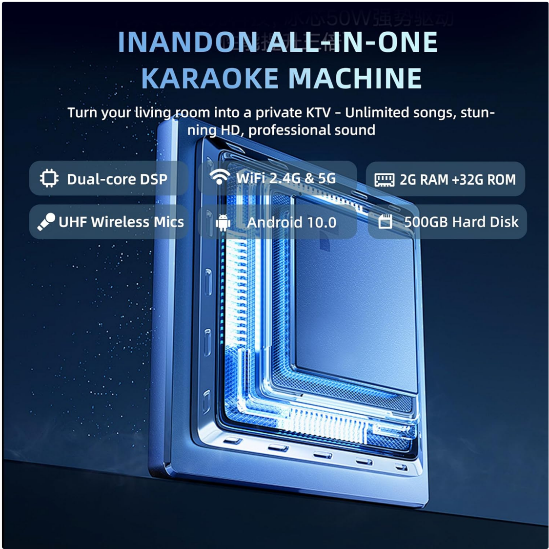
Figure 4.3: Overview of the internal components and key features.