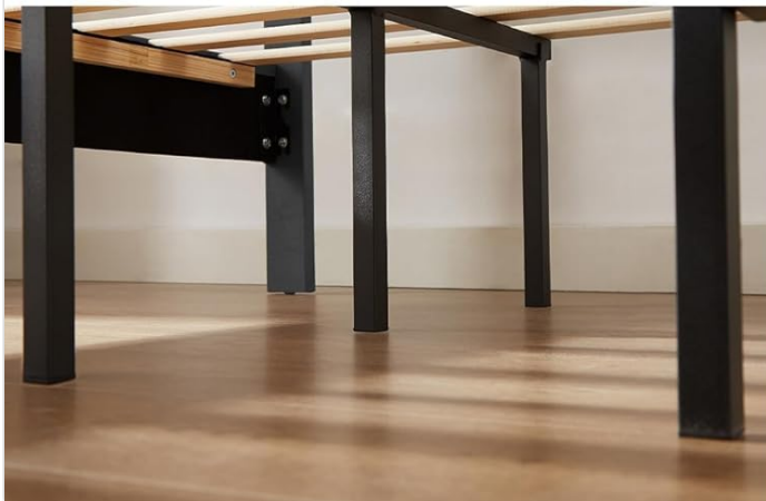
Image: Details of the bed frame's construction, including Velcro strips, wooden slats, and metal frame.

Highlight modern stylish design, provide sturdy support, long-lasting durability, adding charm to the bedroom.