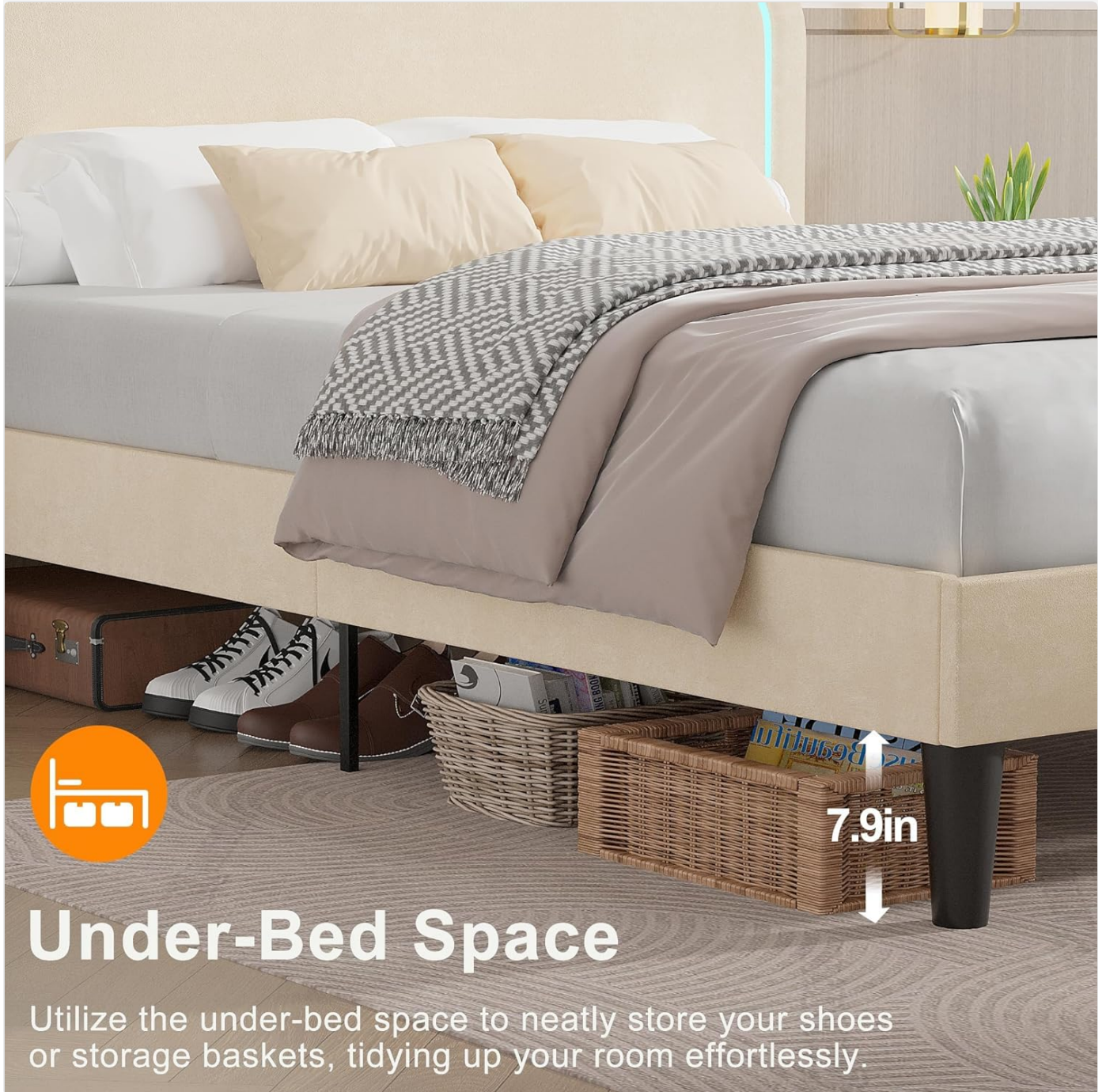
Image: Under-bed space measurement.