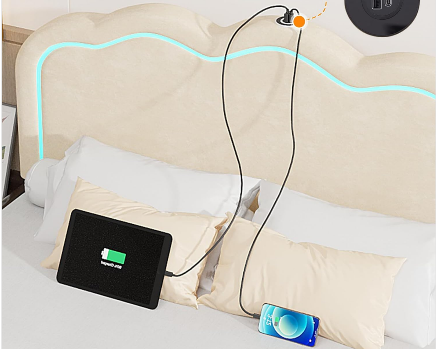
Image: USB-A and Type-C charging ports located on the headboard.

Allow you to charge 2 devices at the same time while in bed.