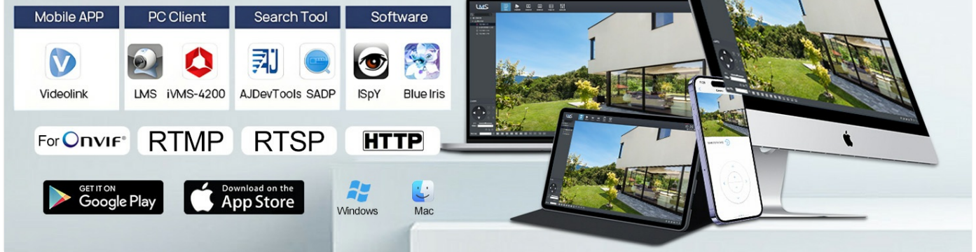
Image: Overview of remote access options, including mobile apps, PC clients, and compatibility with various protocols and software.