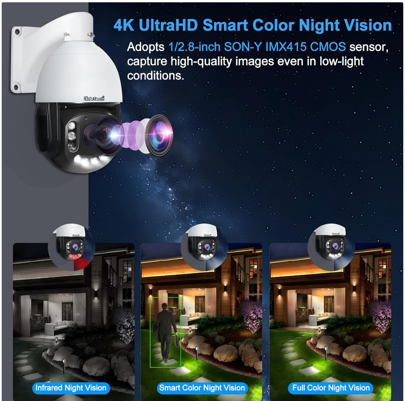
Image: Visual comparison of Infrared Night Vision, Smart Color Night Vision, and Full Color Night Vision modes, showing the camera's capabilities in low-light conditions.