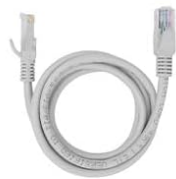
1m Network Cable*1