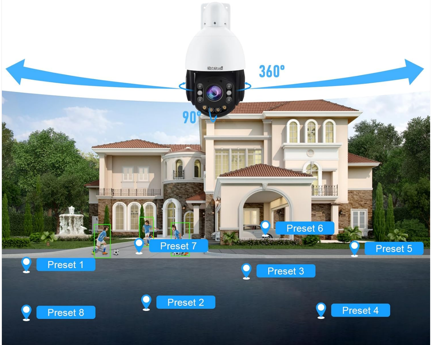
Image: Diagram illustrating the 360° pan and 90° tilt capabilities, along with multiple preset positions for automated monitoring.

Supports up to 128 preset positions and 8 cruise routes, enabling 360° all-around automatic tracking cruise to guard every corner.