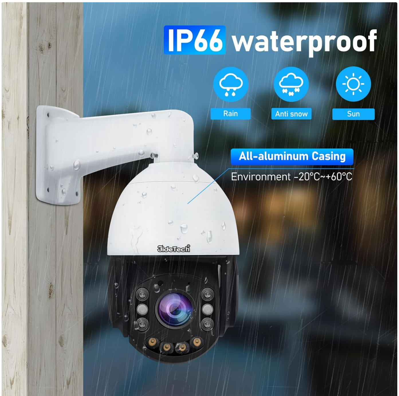
Image: The IP66 waterproof camera shown mounted outdoors, enduring rain, snow, and sun.