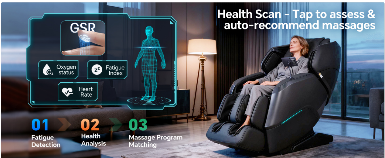
Figure 4: The process of AI Fatigue Health Detection and personalized program matching.

Upon activation, the chair performs an AI Fatigue Health Check. Place your finger on the health sensor for 30 seconds. The smart chip analyzes your body data (fatigue level, heart rate, blood oxygen) and automatically selects a tailored massage program.