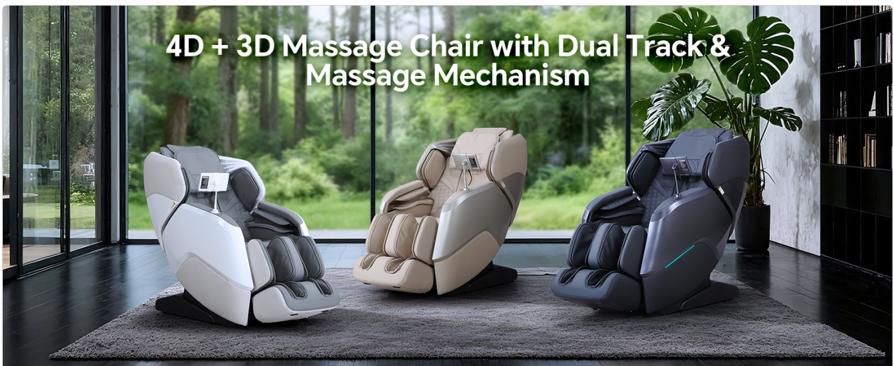
Figure 1: Overview of the CareTech A510S Massage Chair with its dual track mechanism.

The CareTech A510S Massage Chair is designed to provide a comprehensive and personalized massage experience. Featuring a 4D+3D dual mechanism, AI fatigue health detection, and advanced control options, this chair offers deep relaxation and therapeutic benefits. This manual provides essential information for safe and effective use.