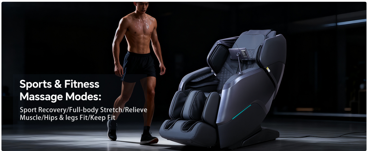
Figure 8: Massage programs for sports recovery and fitness.