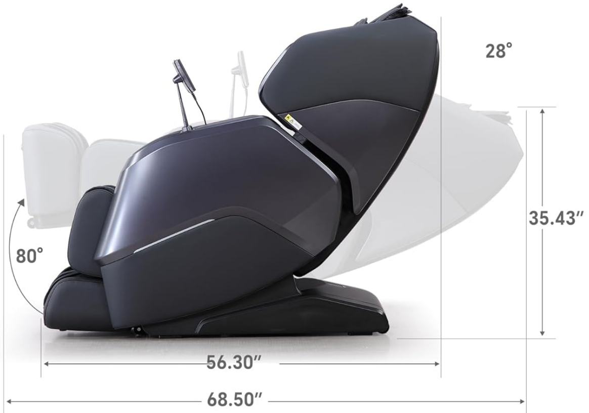
Figure 10: The leg extension feature provides comprehensive massage for the lower body.