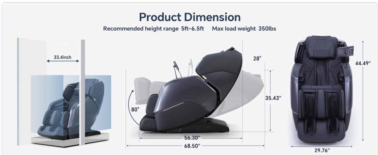
Figure 11: Detailed product dimensions for the CareTech A510S Massage Chair.