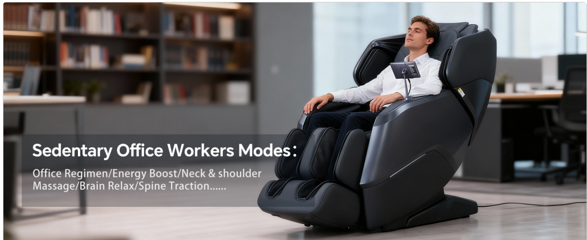
Figure 6: Massage programs tailored for office workers.