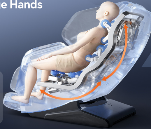
Figure 5: The variety of adjustable massage programs and techniques available.