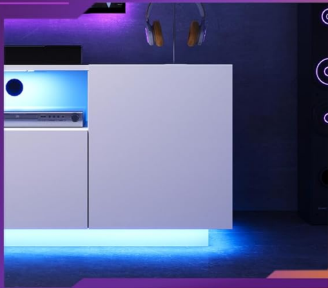
20 Color Combinations