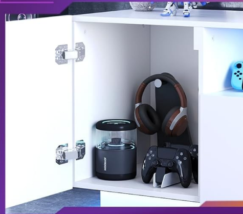
Large Storage Space