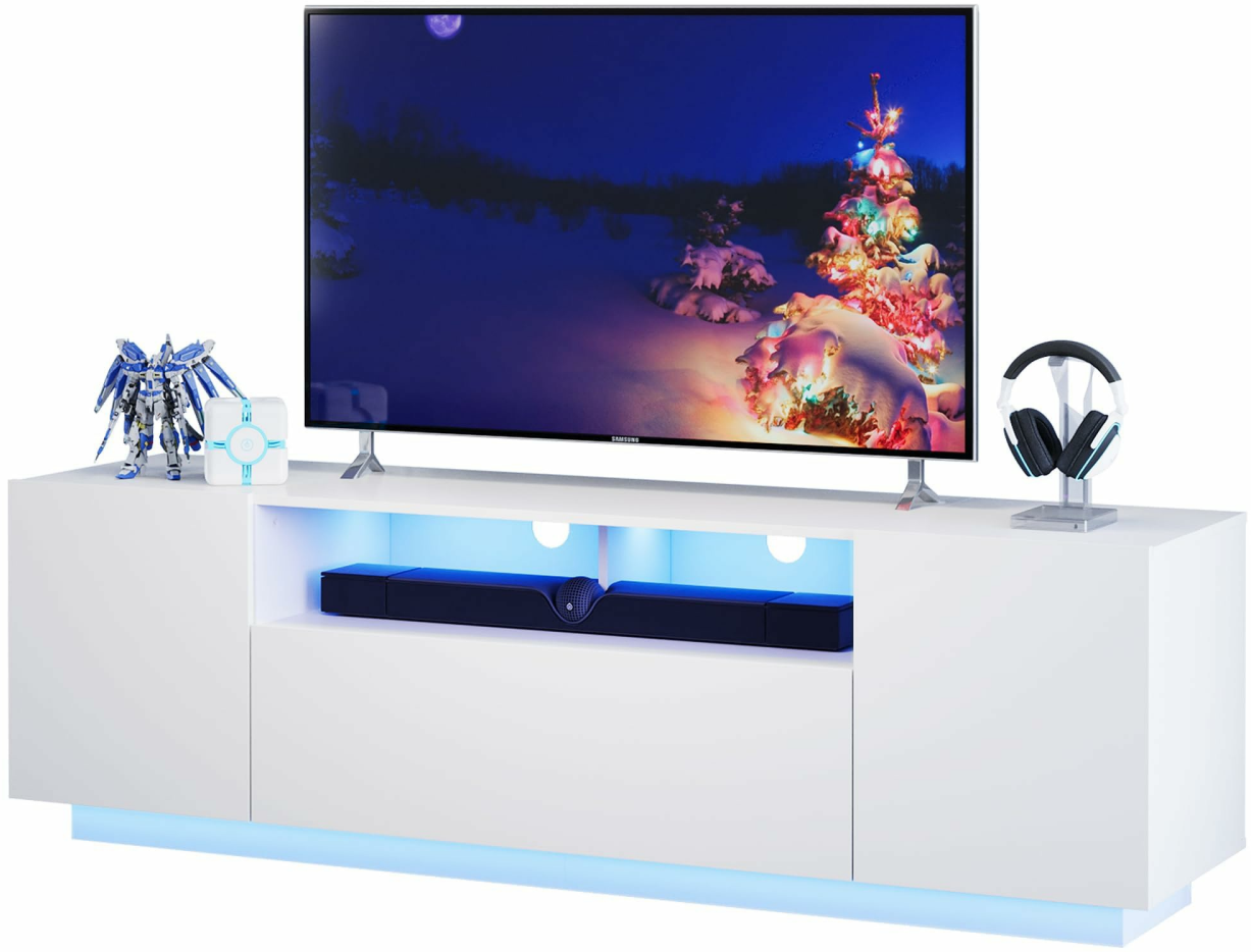
Image: WLIVE Modern TV Stand in a living room setting, showcasing its design and integrated blue LED lighting.