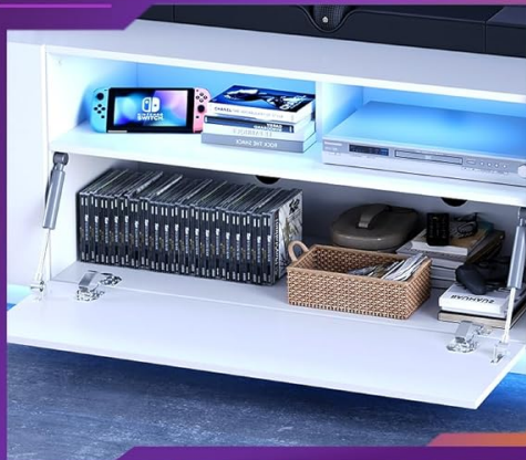
Soft Close Cabinet Doors