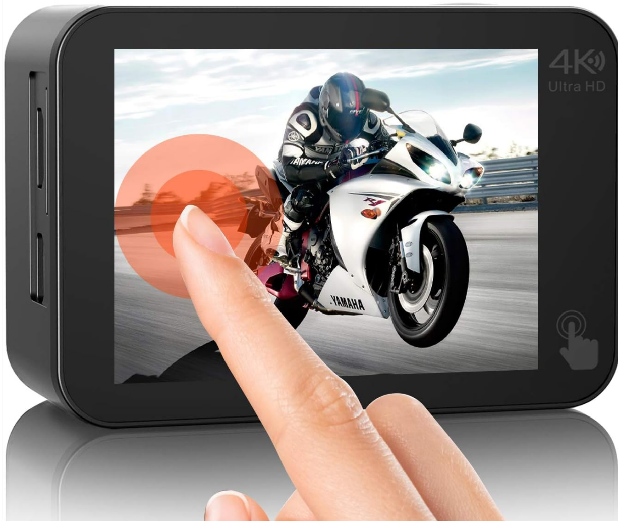
Image: A close-up of the CAMWORLD Action Camera's 2-inch IPS touch screen, demonstrating its interactive interface.