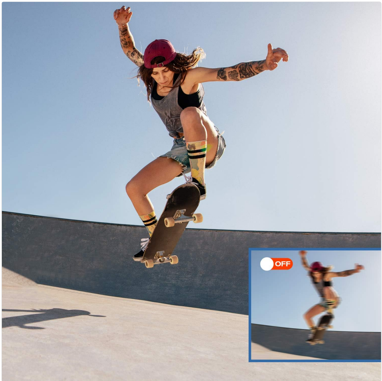
Image: A skateboarder in mid-air, with a smaller inset showing the effect of EIS (Electronic Image Stabilization) being off, highlighting the camera's stabilization capabilities.