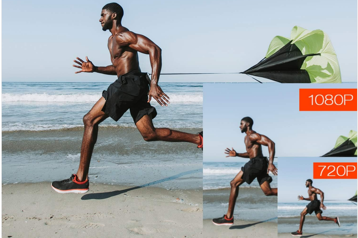
Image: A visual comparison demonstrating the superior clarity of Native 4K/30FPS video compared to lower resolutions captured by the CAMWORLD Action Camera.