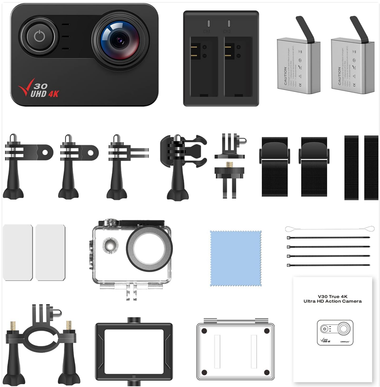
Image: The complete accessories kit for the CAMWORLD V30A-T Action Camera, including various mounts, cables, and cleaning cloth.