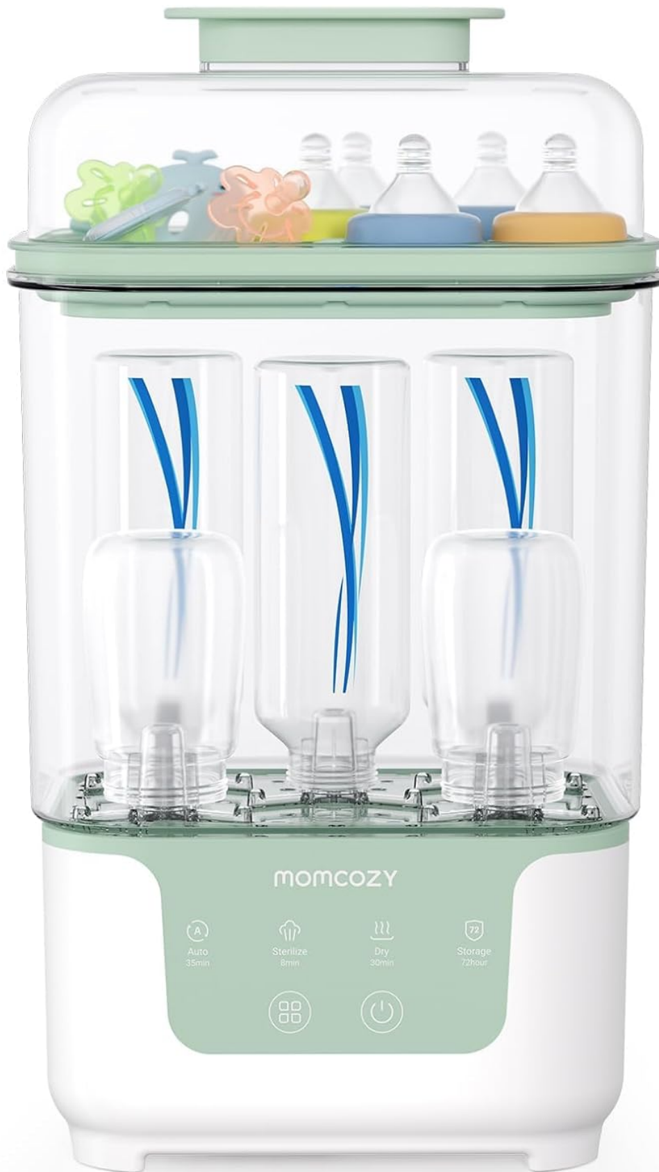
Image 1.1: The Momcozy 4-in-1 Compact Bottle Sterilizer and Dryer.