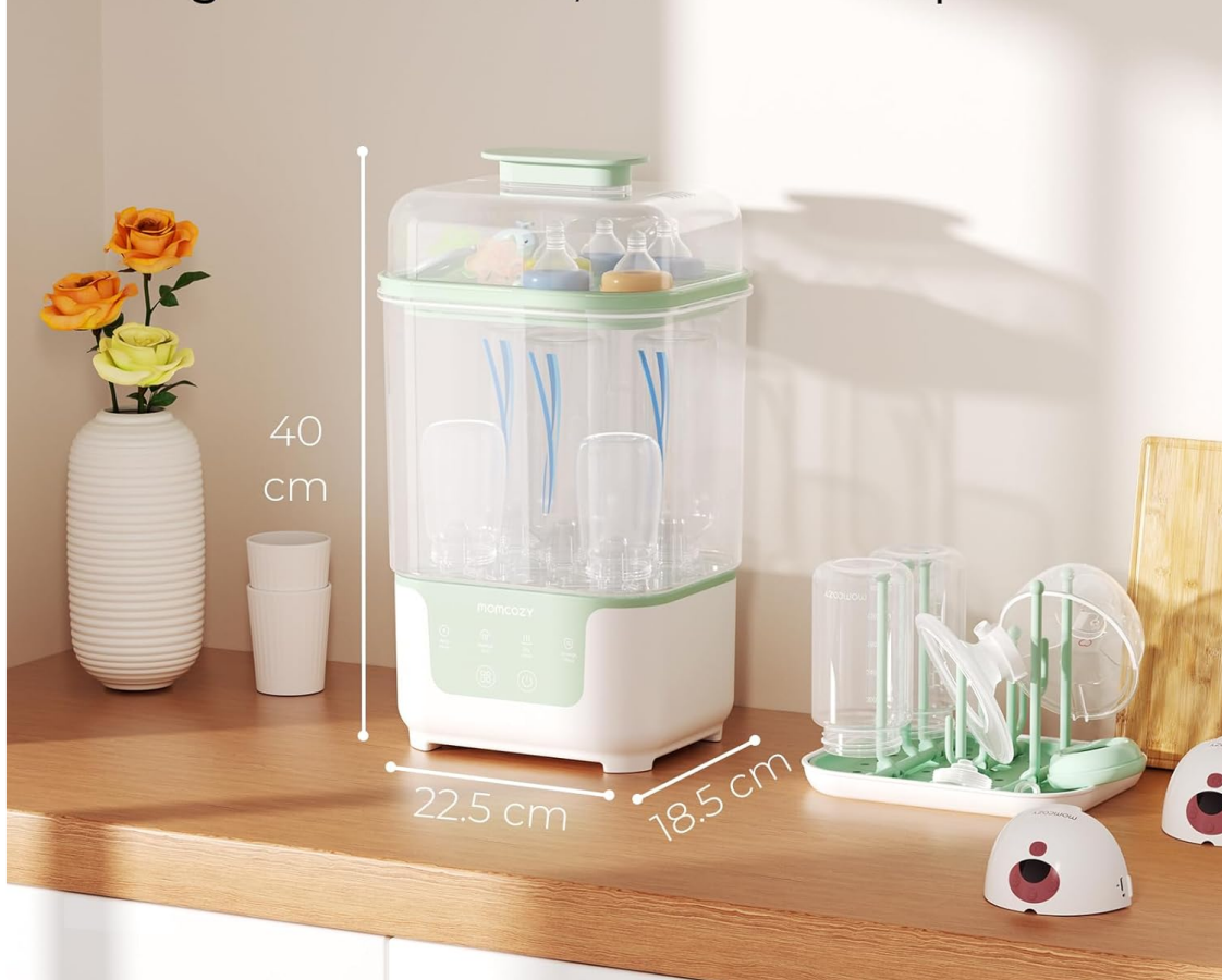
Image 8.1: The compact dimensions of the Momcozy Sterilizer, measuring approximately 40cm in height.

Progettato per adattarsi perfettamente Ingombro minimo, massima tranquillità.