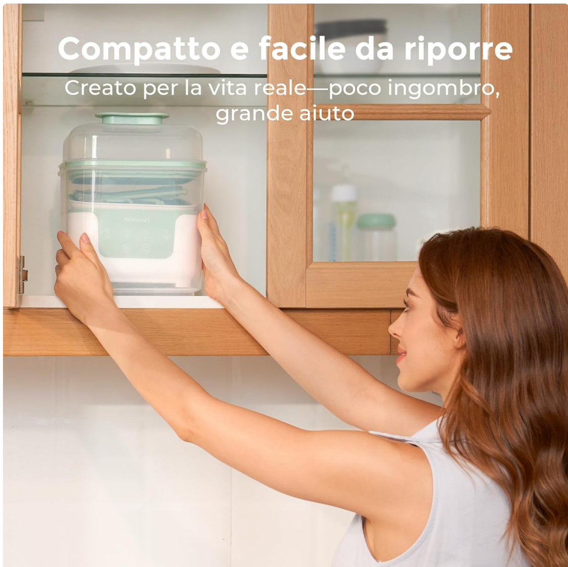
Image 4.1: The compact design allows for easy storage in kitchen cabinets when not in use.