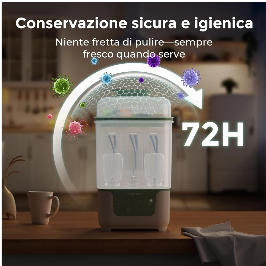
Image 5.4: The sterilizer maintains a sterile environment for up to 72 hours, ensuring items are ready when needed.