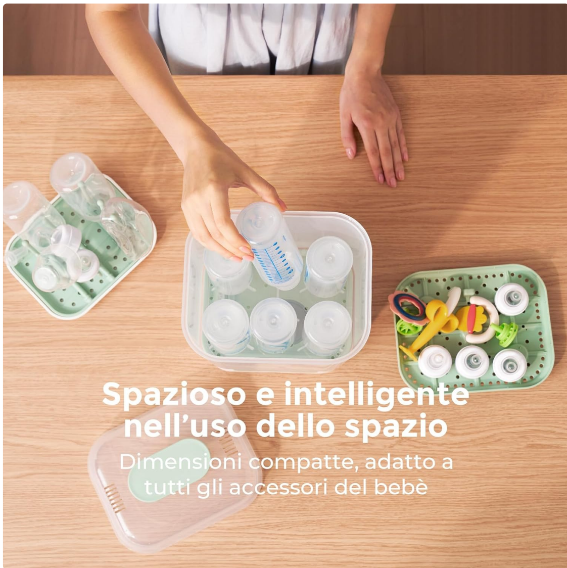
Image 5.1: The sterilizer's spacious interior accommodates up to 6 standard bottles and various accessories.