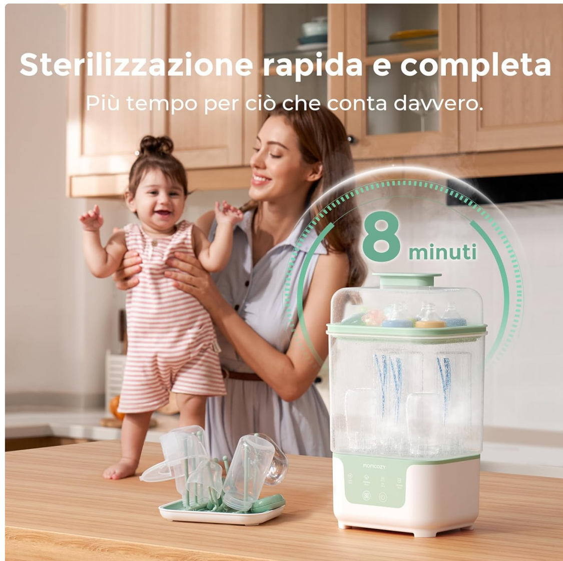
Image 5.3: The sterilizer actively sterilizing items with steam, completing the process in 8 minutes.