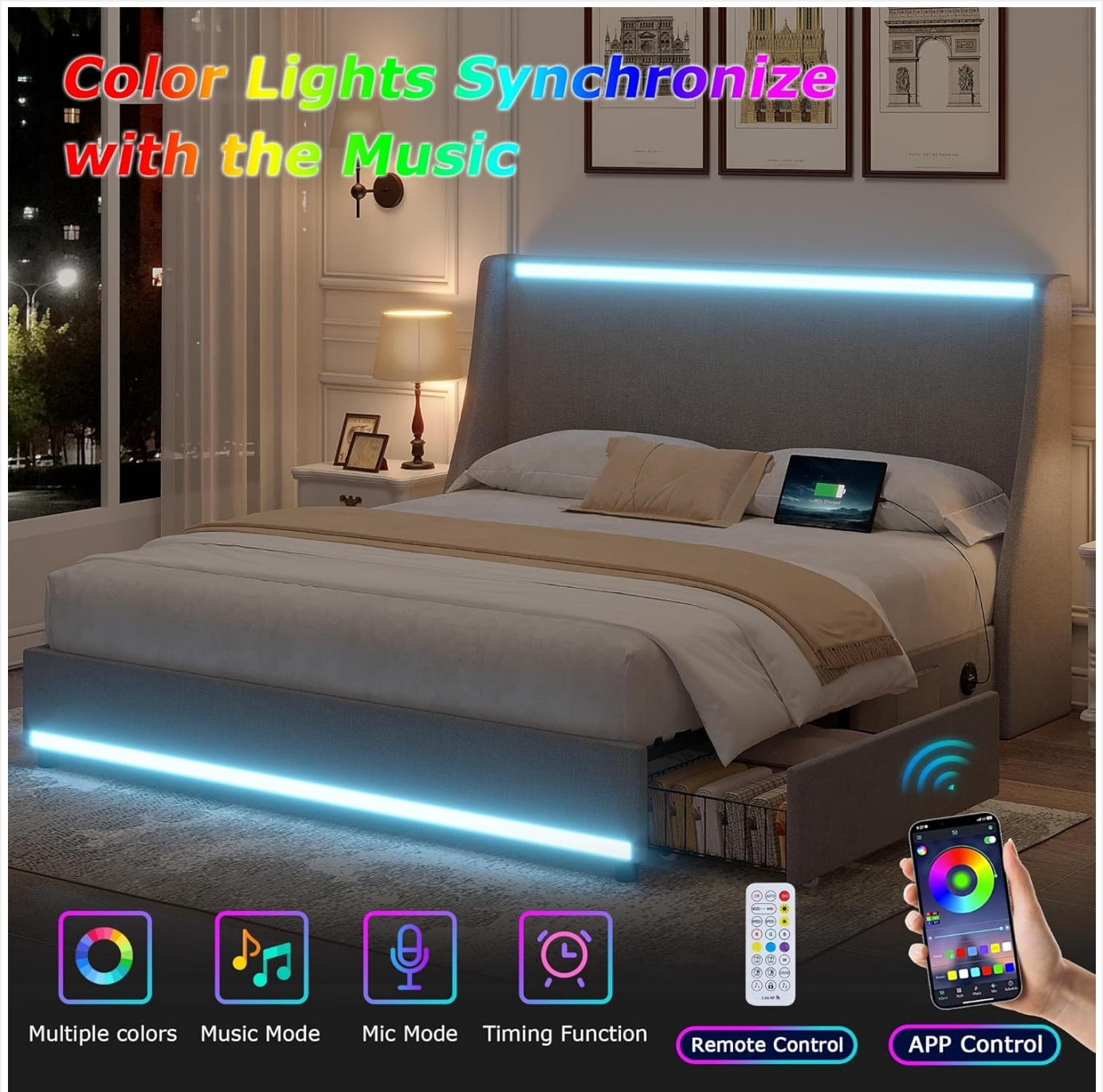
Figure 4: Control options for the LED lighting system, including the remote control and smartphone application, demonstrating various modes and color synchronization.