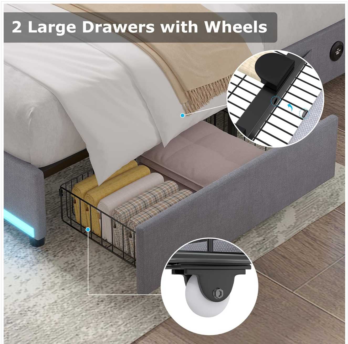
Figure 3: Illustration of the large storage drawers with smooth-rolling wheels, designed for easy access and storage under the bed.