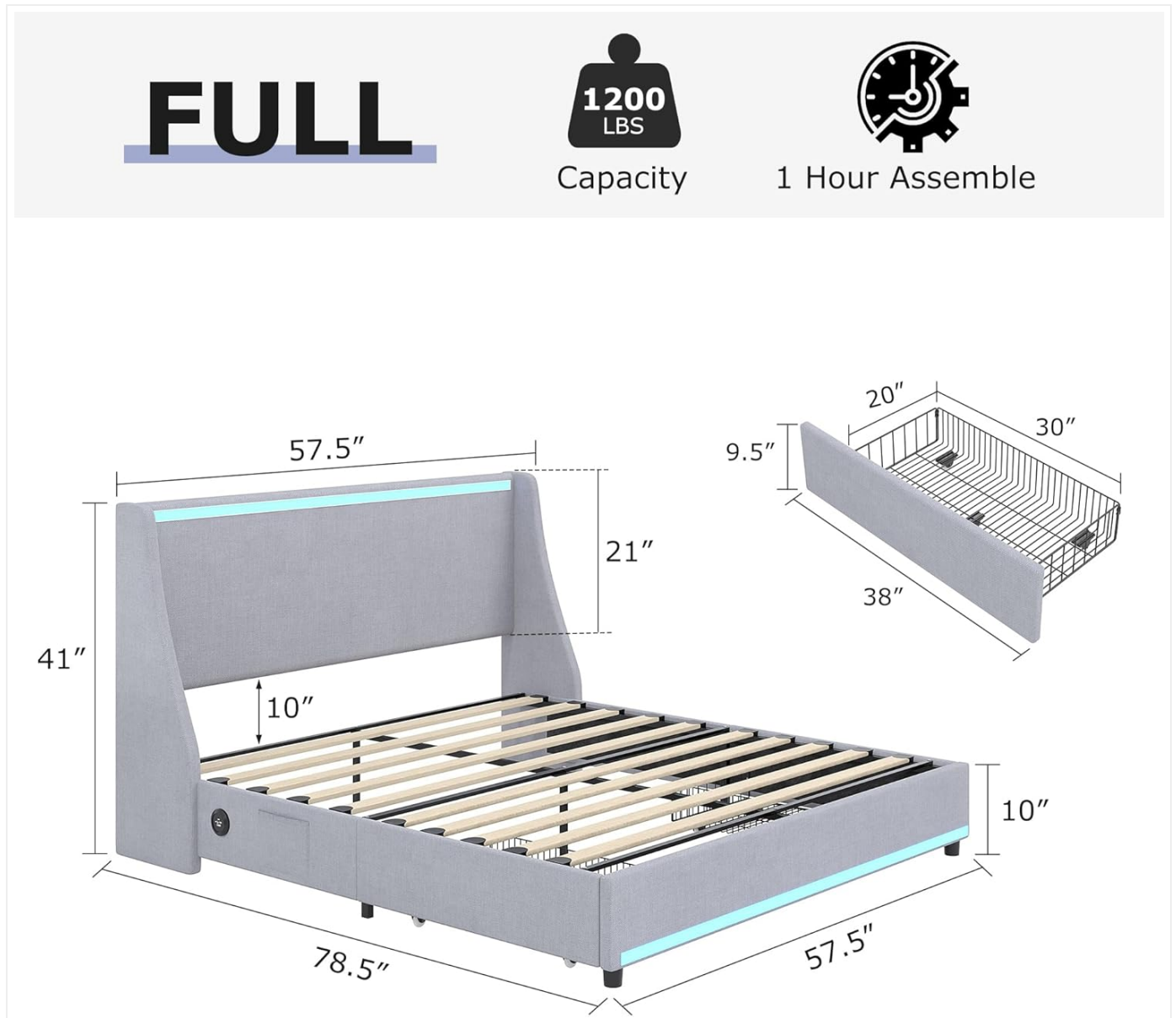
Figure 1: VECELO Full Size Bed Frame dimensions and components. The diagram shows the overall length of 78.5 inches, width of 57.5 inches, and headboard height of 41 inches. It also details the two storage drawers, each 38 inches long, 20 inches wide, and 9.5 inches deep.

The package includes the bed frame components, an accessory bag with hardware, and this assembly instruction manual.