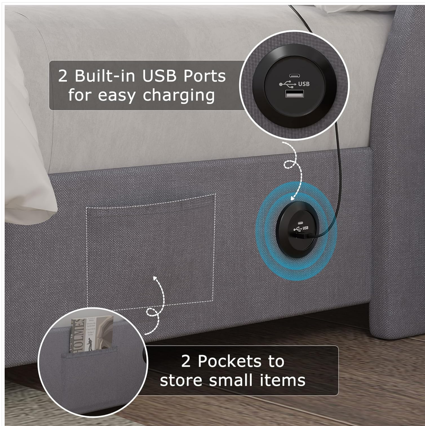
Figure 5: Detail of the integrated USB and Type-C charging ports and convenient side pockets.