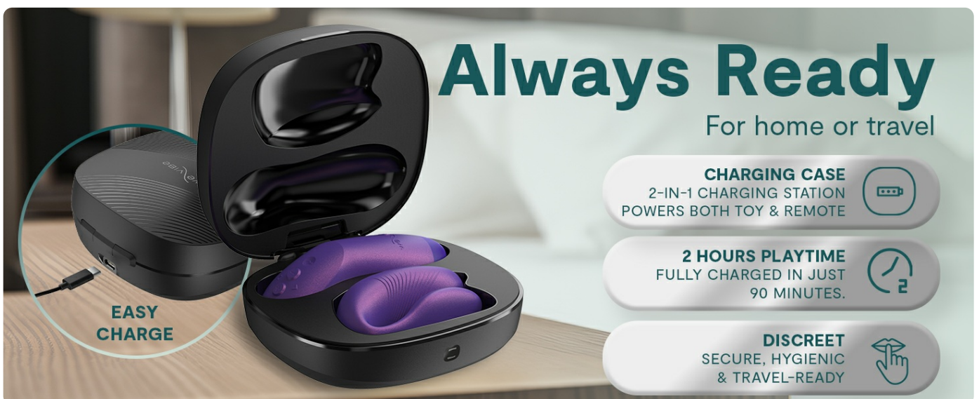
Image: The We-Vibe Chorus Pro and remote inside the charging case, with the USB cable connected.