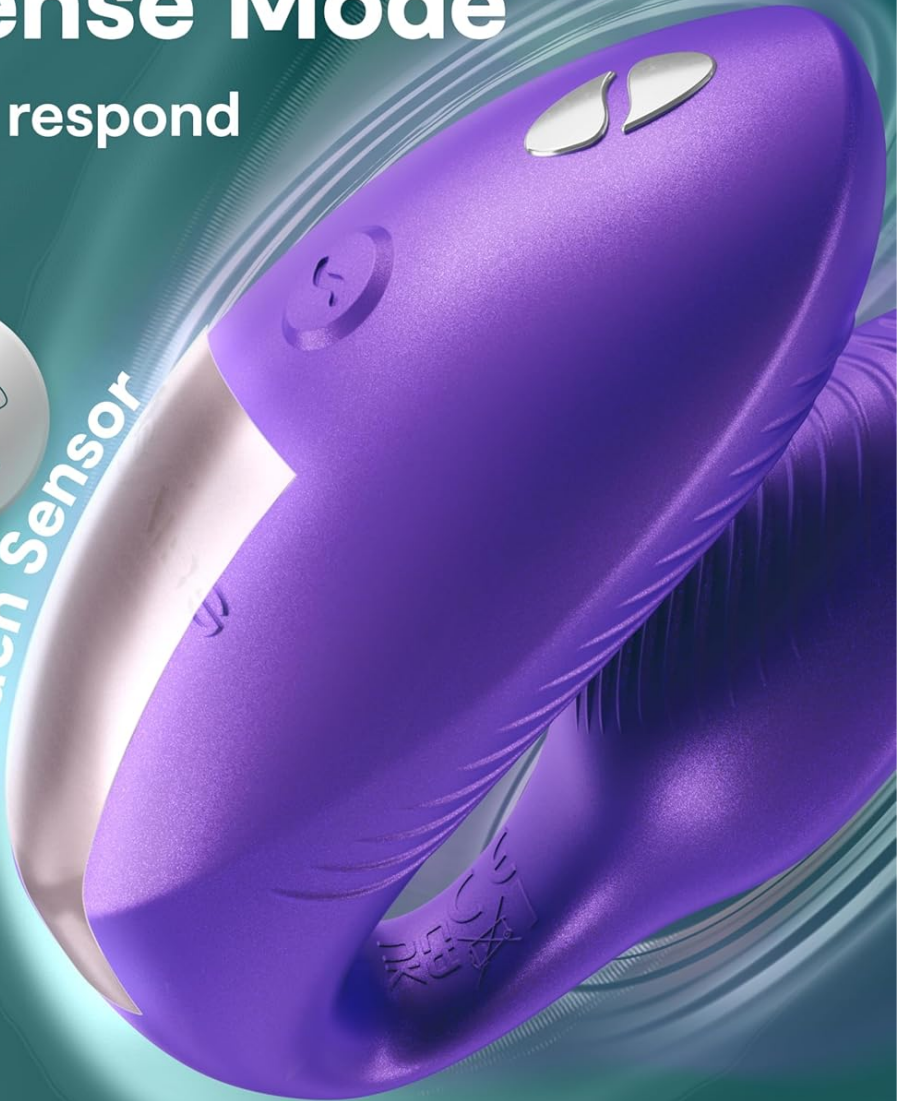
Image: The We-Vibe Chorus Pro submerged in water, demonstrating its waterproof design.