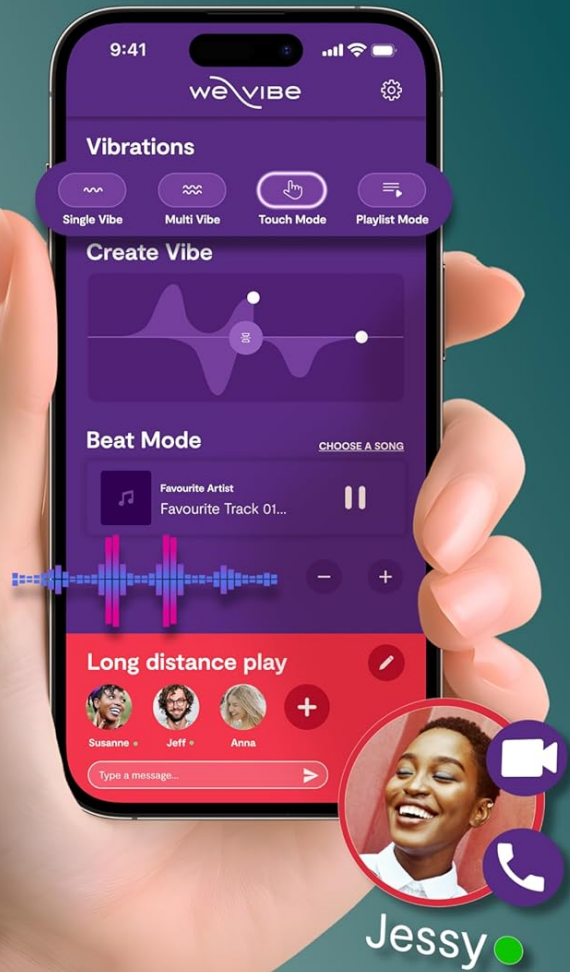
Image: Screenshots of the We-Vibe App interface, highlighting different control modes and features.