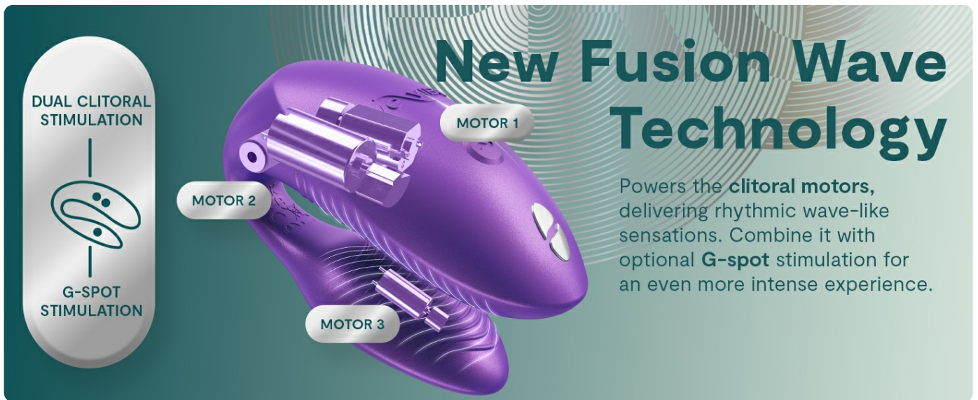
Image: Diagram showing the internal motors and the dual stimulation points of the Fusion Wave Technology.