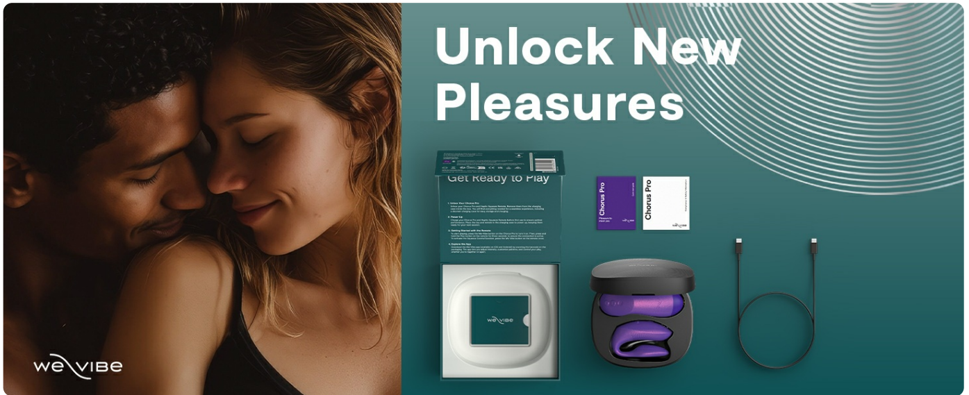
Image: An overview of the We-Vibe Chorus Pro device and its accessories, including the charging case and cable.