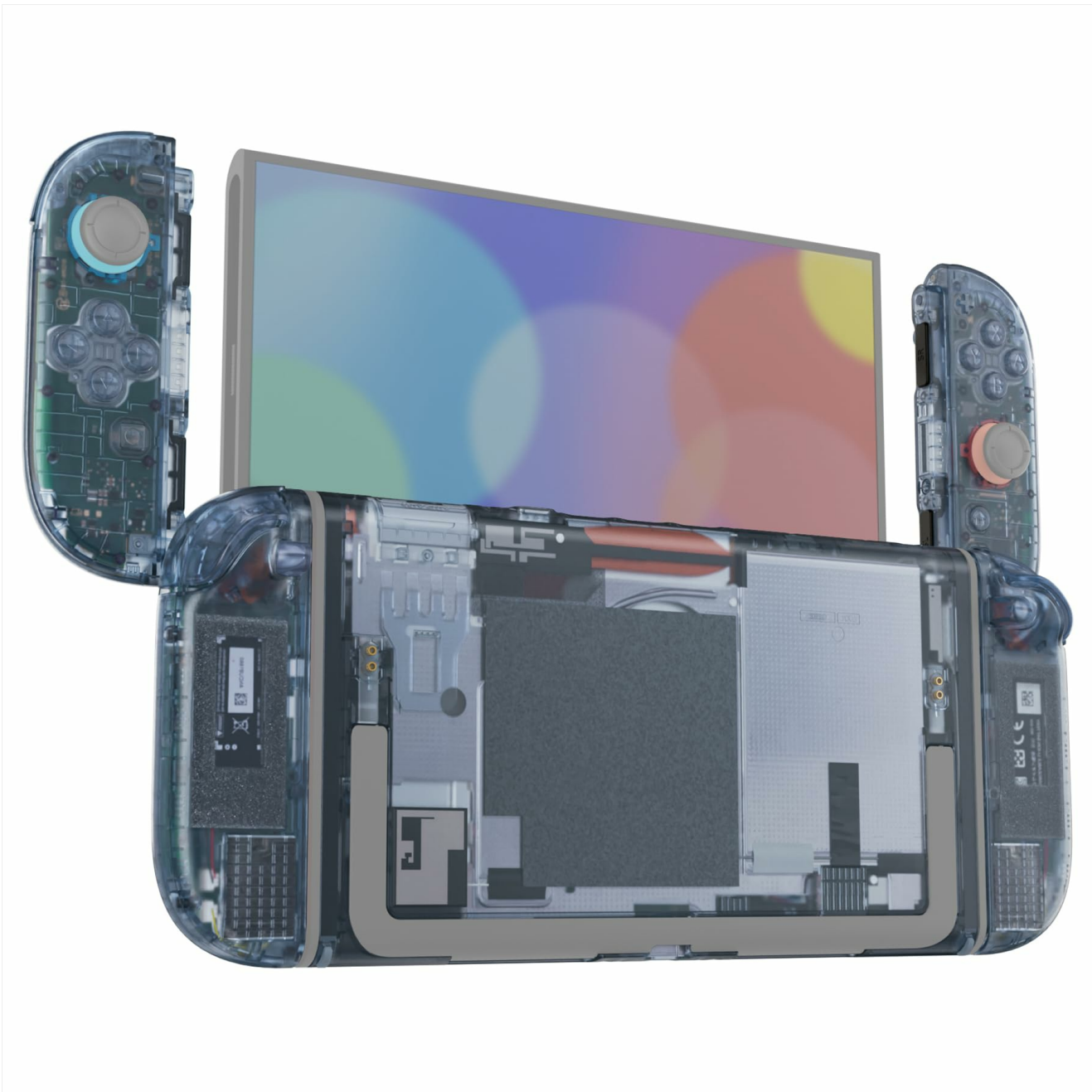
Image: The eXtremeRate DIY Replacement Shell Buttons kit in Clear Glacier Blue, showcasing the console and Joycon shells.