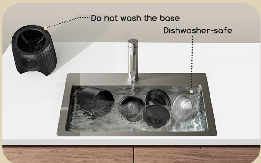
Image: An illustration demonstrating the detachable design of the feeder for easy cleaning. It shows the food bucket, lid, and stainless steel bowl being washed in a sink, with a clear instruction not to wash the electronic base.