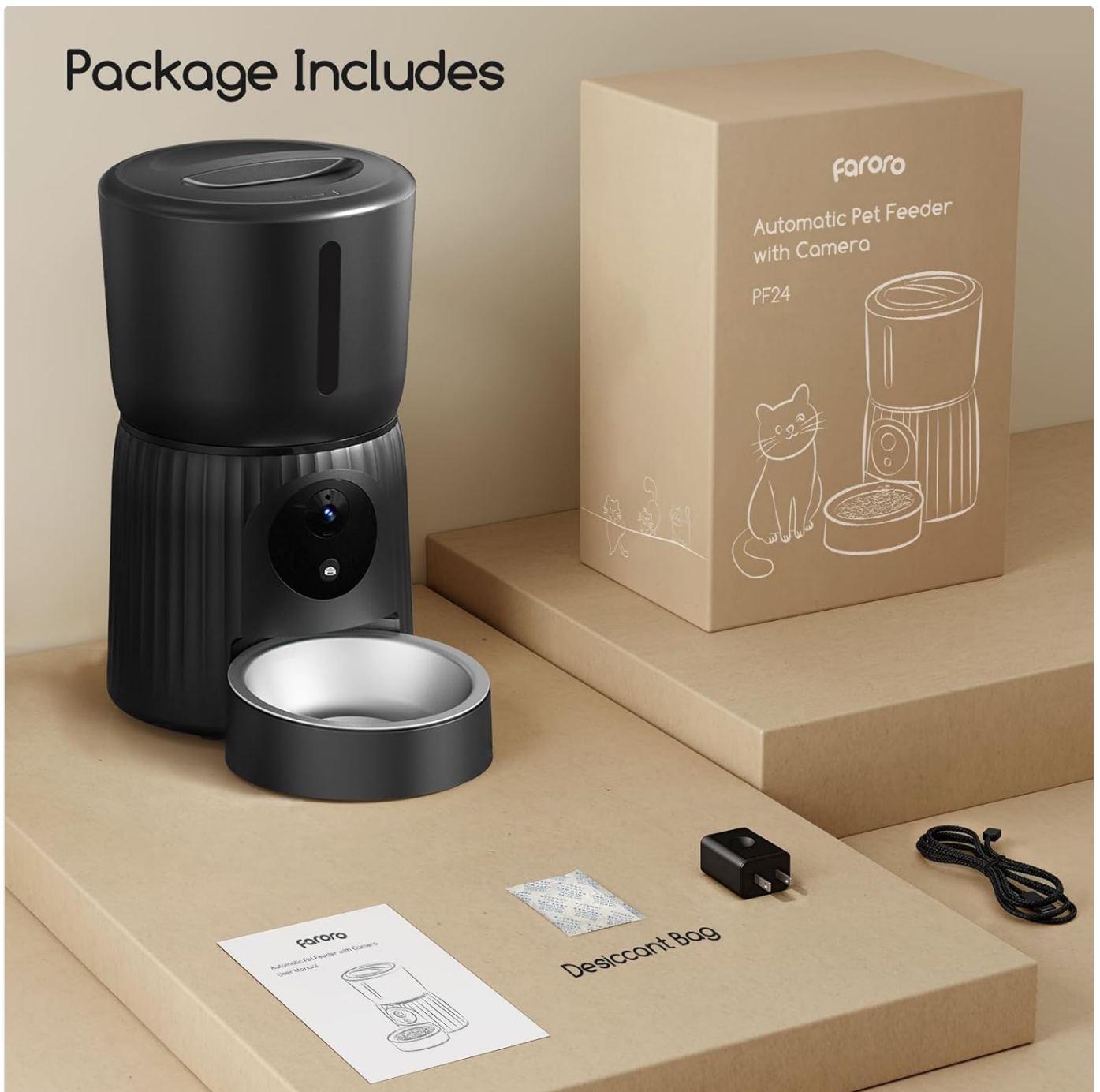
Image: The package contents laid out, showing the main feeder unit, stainless steel bowl, power adapter, USB-C cable, desiccant bag, and the instruction manual.