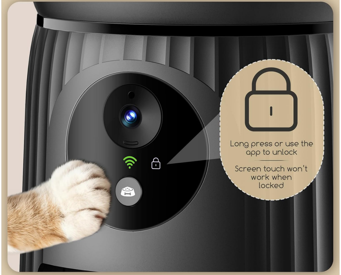
Image: A close-up of the feeder's front panel, showing a cat's paw near the manual feed button and a lock icon. Text explains that the lock function prevents pets from accidentally dispensing food and can be unlocked via a long press or the app.

Lights up when locked, keeping mischievous kittens from feeding themselves.