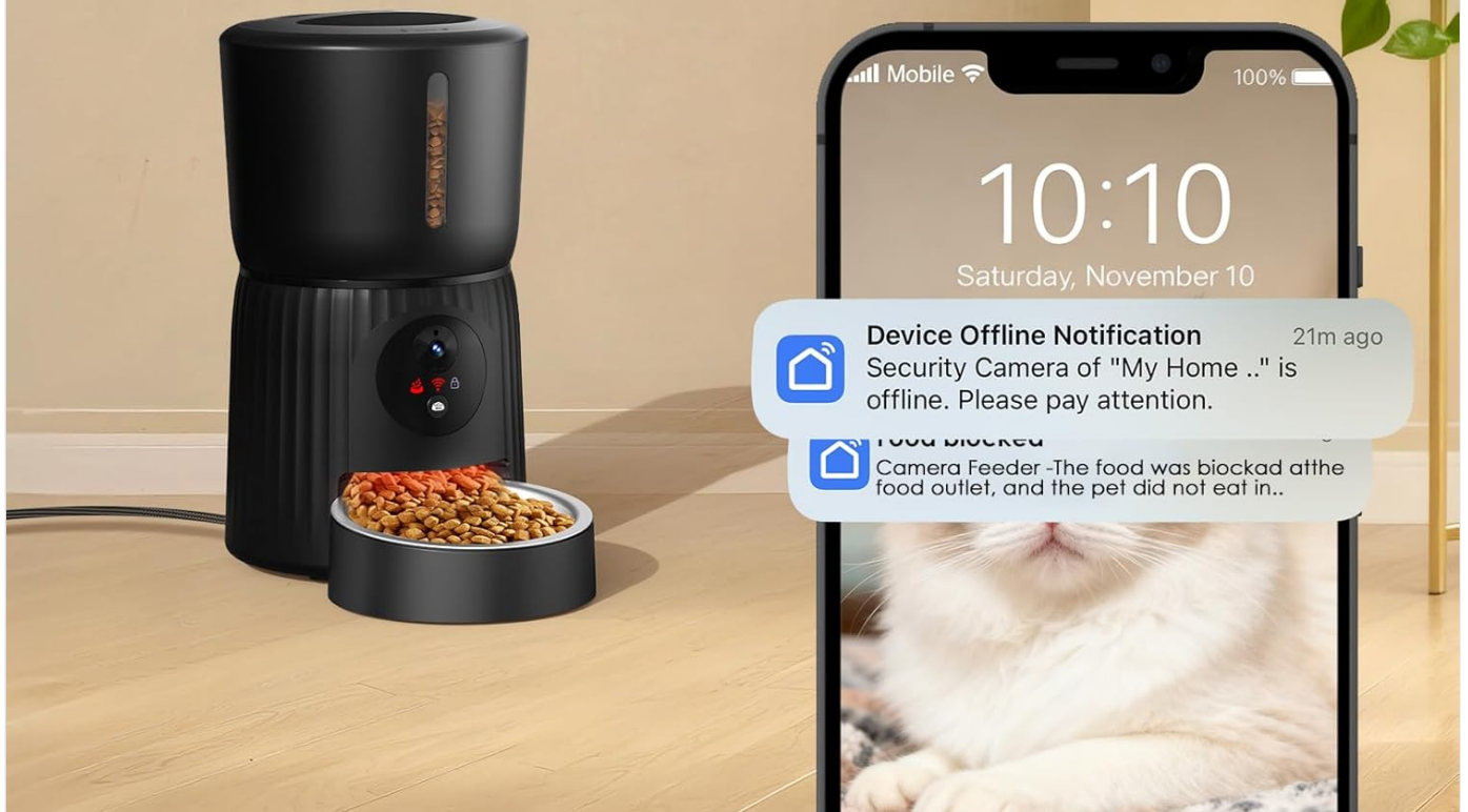
Image: A smartphone screen showing two notification alerts: 'Device Offline Notification' and 'Food Blocked', positioned next to the Faroro pet feeder, illustrating the notification feature.

Notifications come in when device is offline, or food is blocked