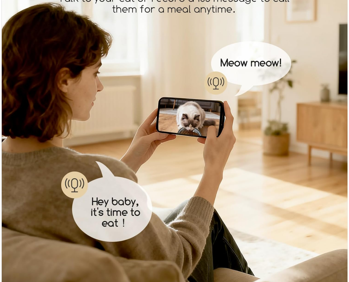
Image: A person holding a smartphone, displaying a live feed of their cat. Speech bubbles illustrate the two-way audio feature, showing a cat's meow and a human voice message, indicating the ability to talk to and call pets for meals.

Talk to your cat or record a 10s message to call them for a meal anytime.