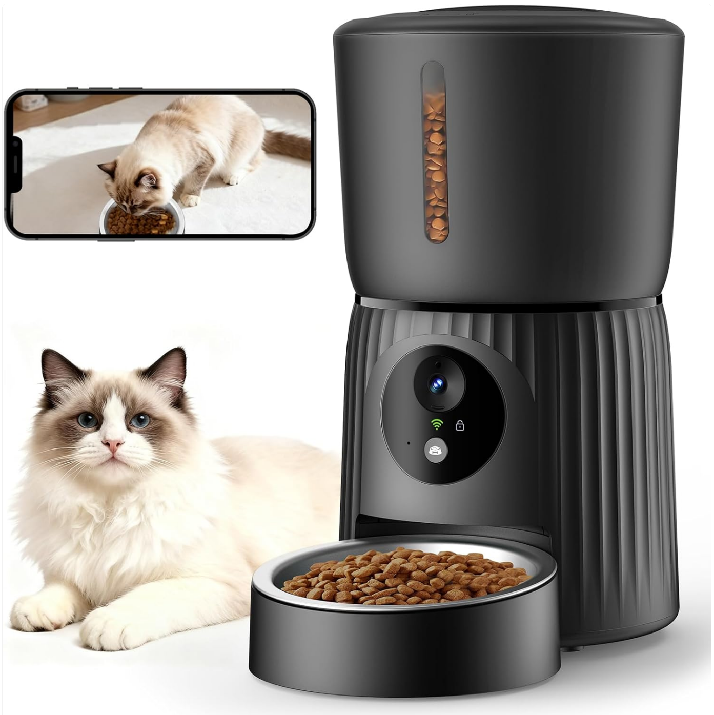
Image: A detailed view of the Faroro Automatic Pet Feeder, highlighting its main features such as the transparent food hopper, integrated camera, control buttons, and the removable stainless steel feeding bowl.