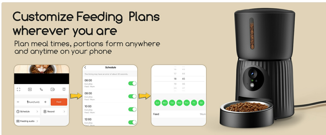
Image: A mobile phone screen displaying the Smart Life app interface for customizing feeding schedules, showing options to set meal times and portion sizes.