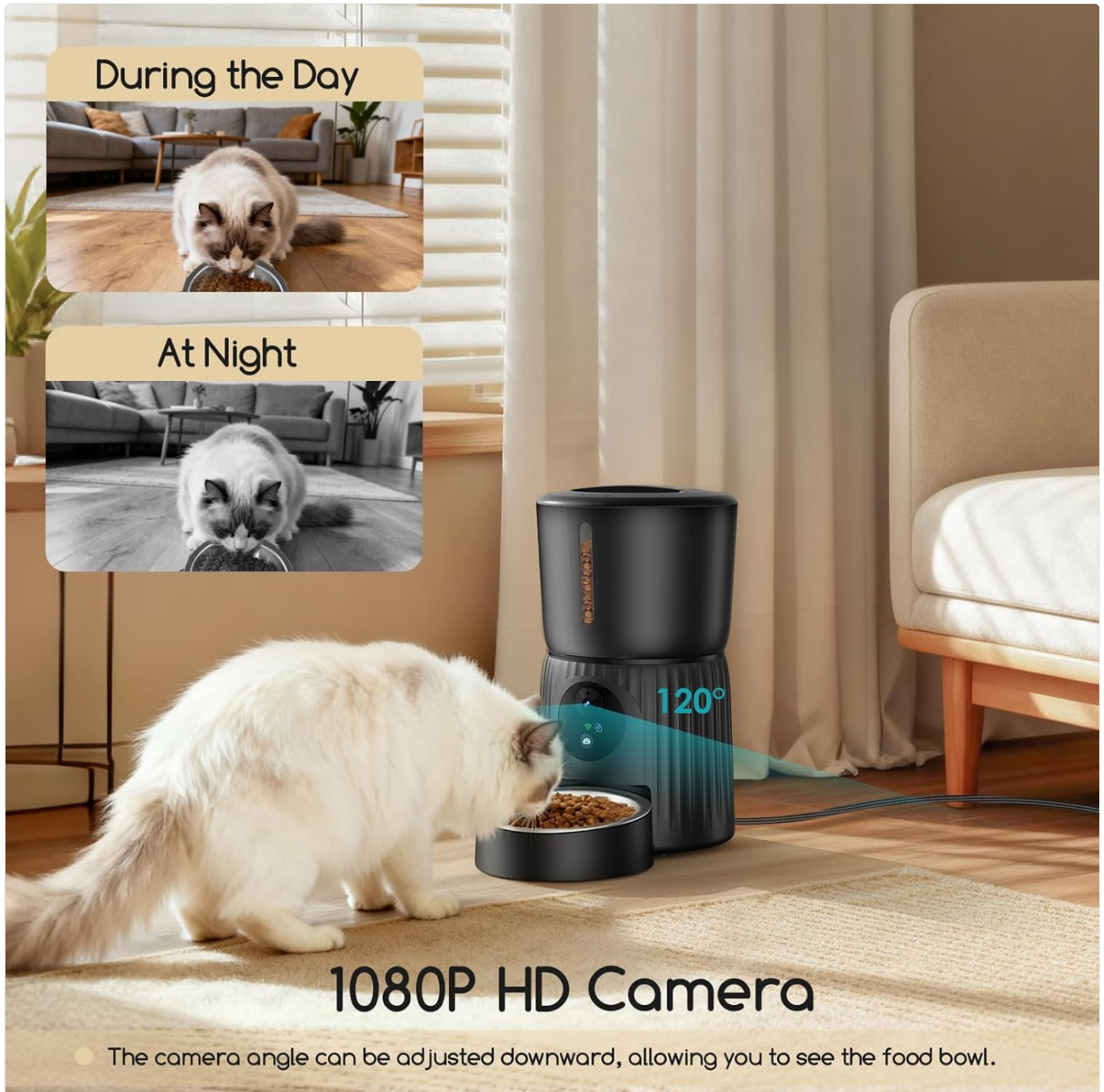
Image: A cat eating from the feeder, with two smaller insets showing the camera's view during the day (color) and at night (black and white with night vision). Text indicates the 1080P HD camera and its adjustable angle.

The integrated 1080P HD camera has a 120° wide-angle lens and offers two downward adjustment levels. Gently hold the feeder and adjust the camera angle to view the food bowl remotely.