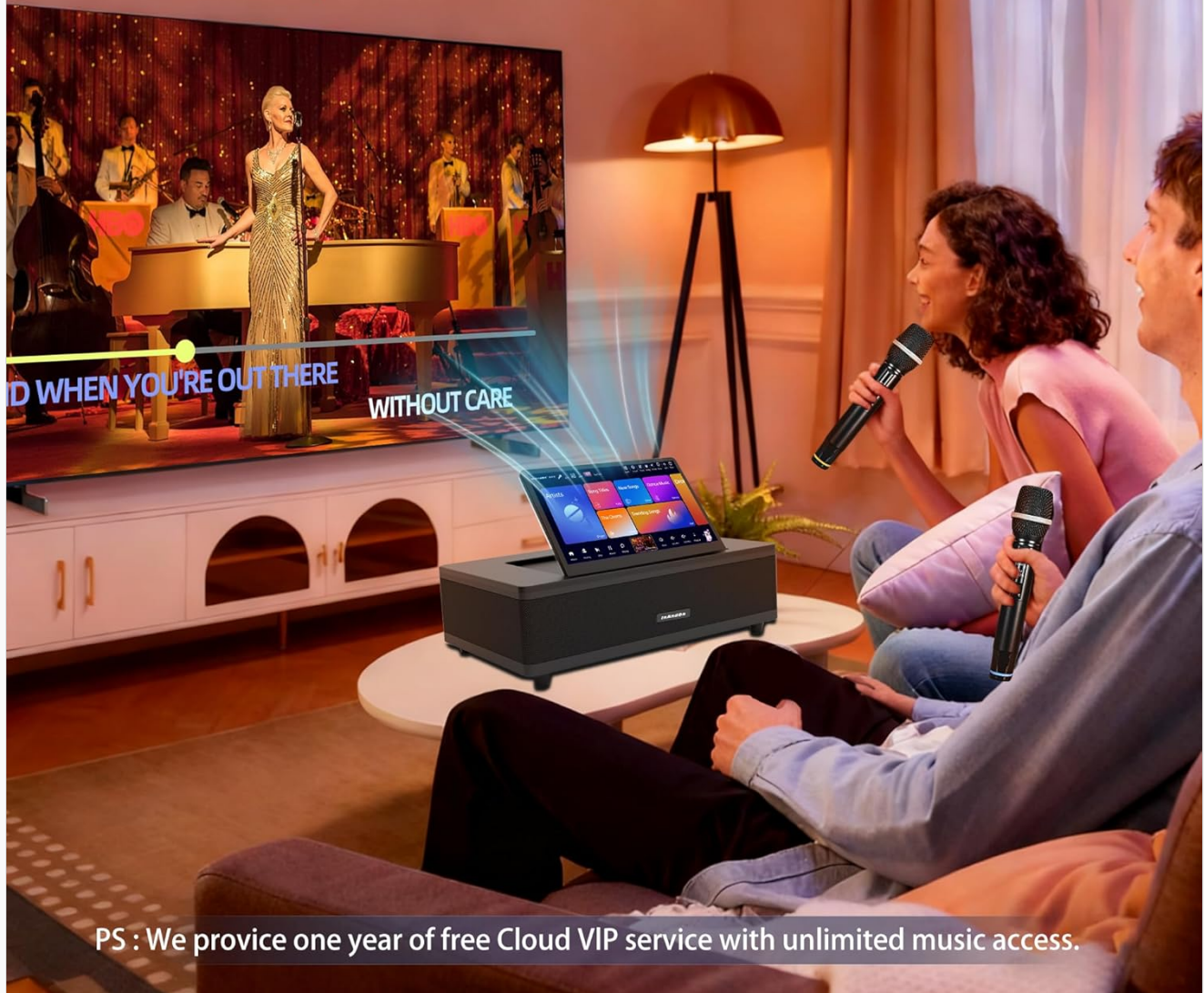
Figure 4.4: Project the karaoke screen onto a larger display for an enhanced experience.

Sync the Screen to the TV via HDMI Or APP