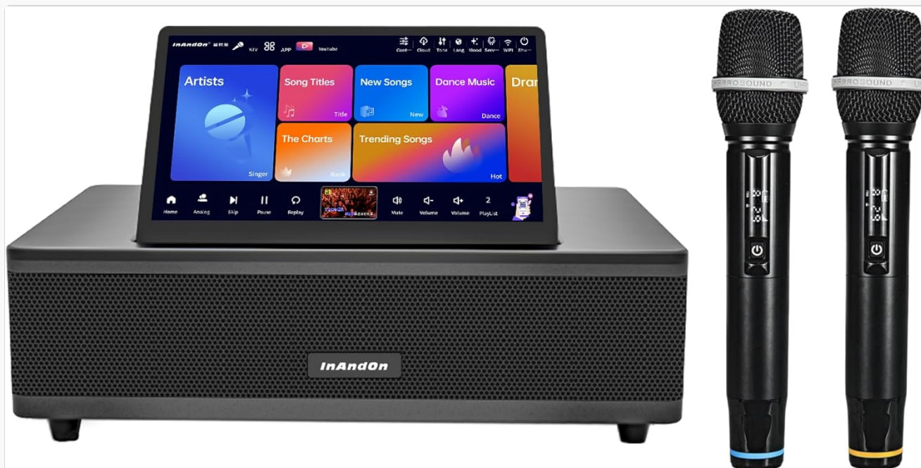
Figure 1.1: InAndOn M6 All-in-One Karaoke Machine with included wireless microphones.

The InAndOn M6 is a versatile all-in-one karaoke system designed for home entertainment, parties, and events. It integrates a karaoke player, speakers, mixer, amplifier, and an HD touchscreen into a single unit, offering a streamlined and user-friendly experience. This manual provides essential information for setting up, operating, maintaining, and troubleshooting your InAndOn M6 Karaoke Machine.