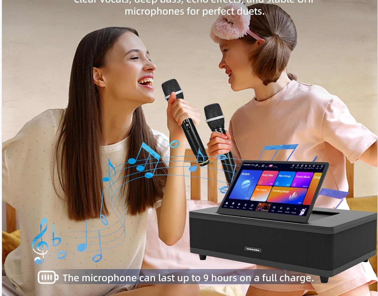
Figure 4.3: The professional UHF microphones provide clear vocals and can last up to 9 hours on a full charge.

Clear vocals, deep bass, echo effects, and stable UHF microphones for perfect duets.