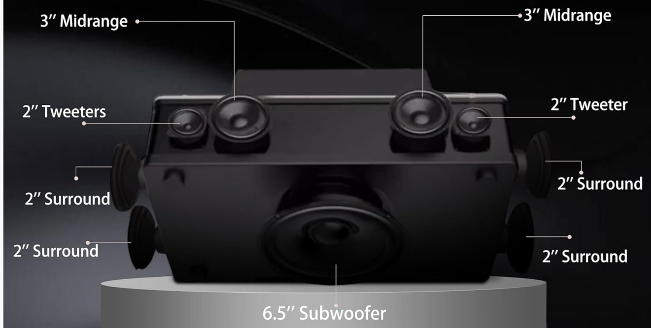
Figure 2.2: Detailed view of the 360° HD stereo surround sound speaker configuration.

Bass Deep | Highs Crisp | Mids Clear Sound that slaps. Music change life.