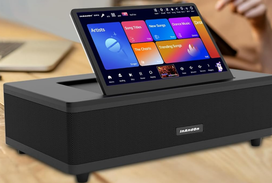
Figure 4.2: Control the InAndOn M6 using your smartphone, tablet, or the dedicated app.