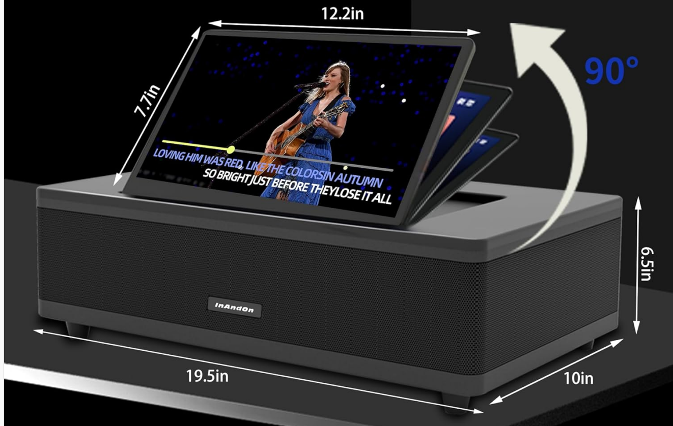
Figure 4.1: The 12.2-inch HD touchscreen can be adjusted for viewing comfort.

90° Foldable Touchscreen - Full-view eye-friendly display with crystal-clear HD quality from every angle