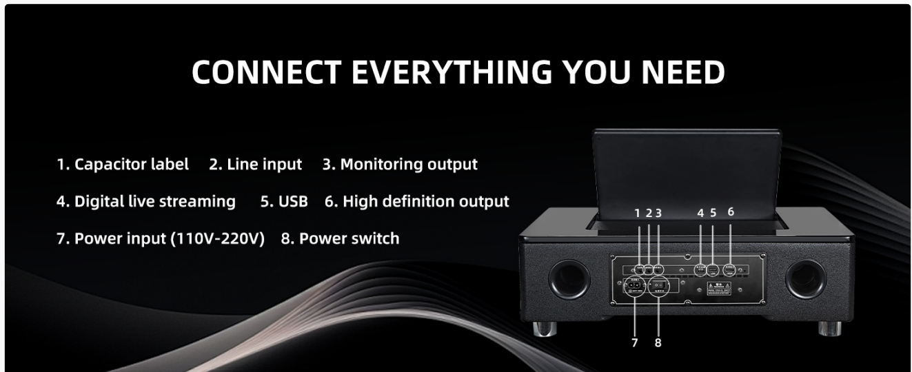
Figure 3.1: Rear panel connections for the InAndOn M6.