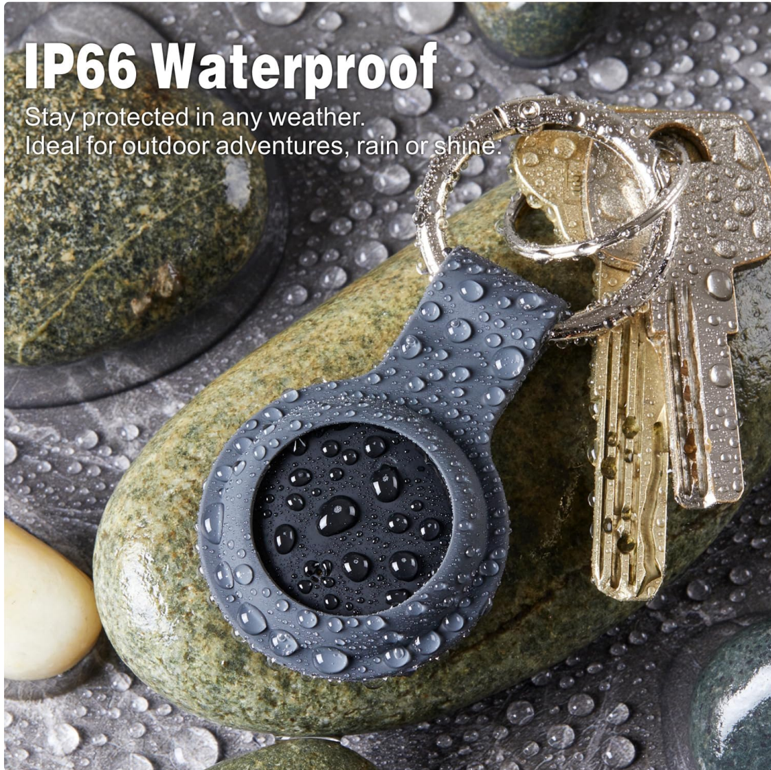
Image: The Reyke Smart Tag, shown with water droplets, highlighting its IPX6 waterproof capability, making it suitable for various environments.

The Reyke Smart Tag has an IPX6 waterproof rating, meaning it is protected against powerful water jets. It is suitable for outdoor use and can withstand rain or splashes, but it is not designed for submersion in water.