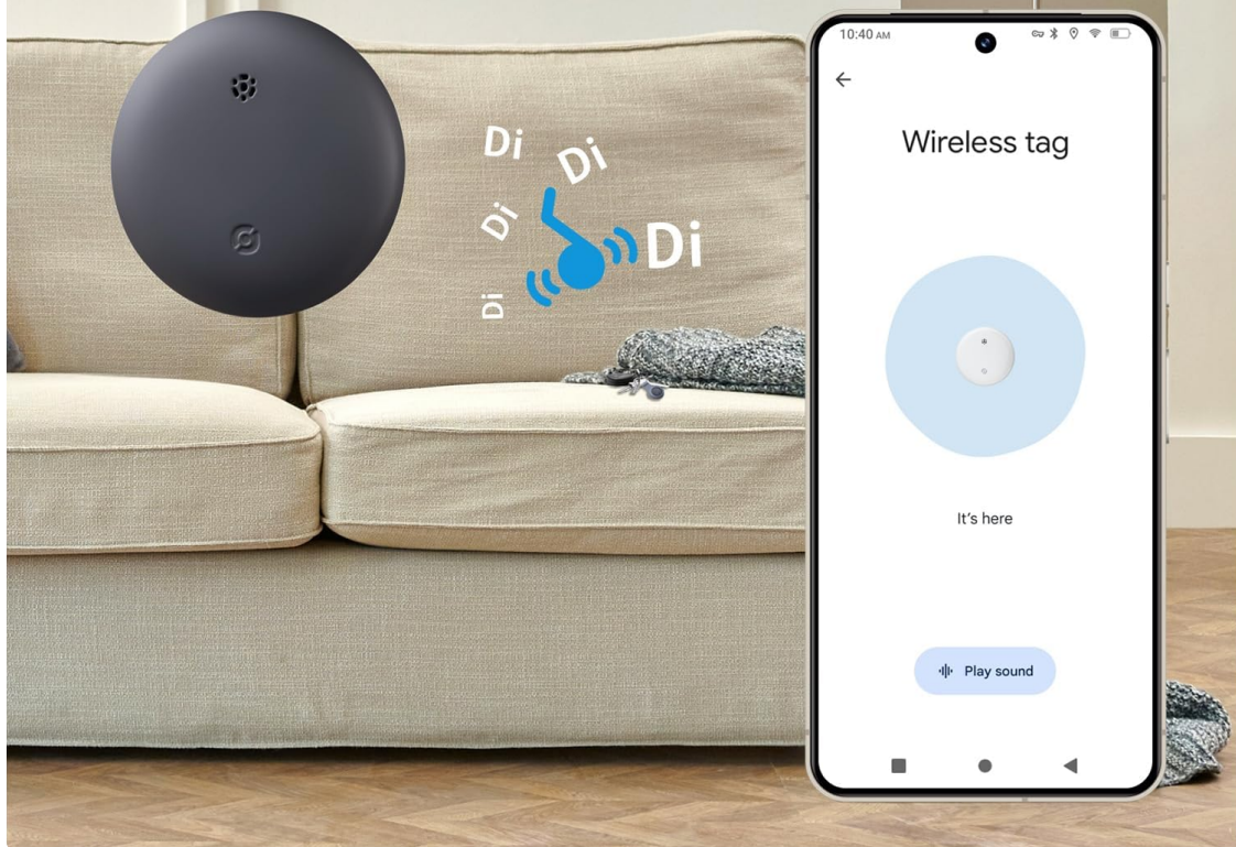
Image: An illustration of the "Play sound" feature within the Google Find My Device app, showing the Reyke Smart Tag emitting an audible alert to help locate it, even when hidden.

Crystal-Clear Audibility and Impressive Tracking Range Up to 105dB loud beep Up to 180ft. Bluetooth range