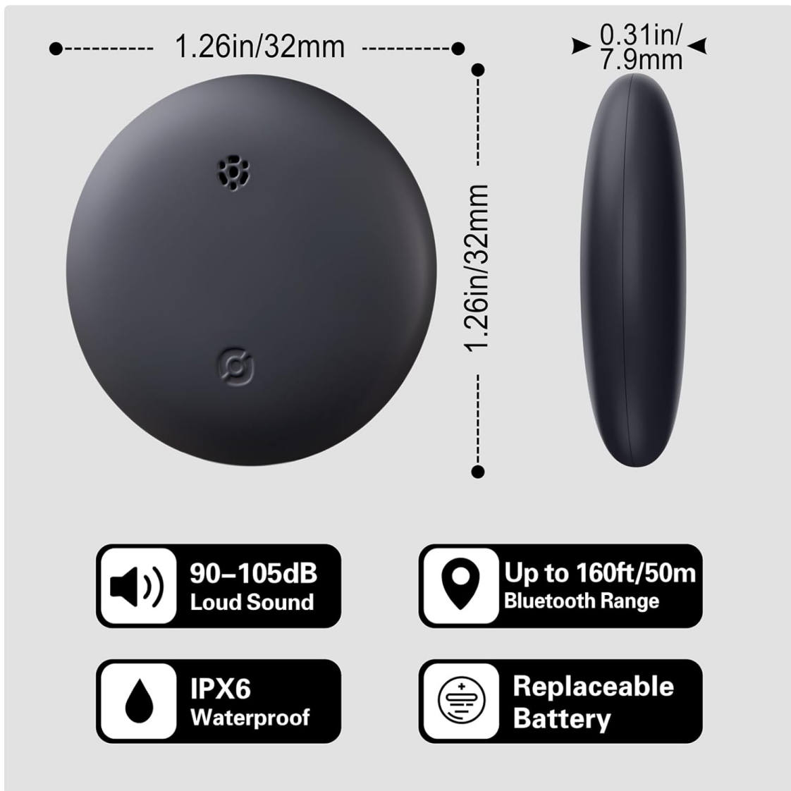
Image: A visual representation of the Reyke Smart Tag's dimensions and key technical specifications, including sound level, Bluetooth range, waterproof rating, and battery type.