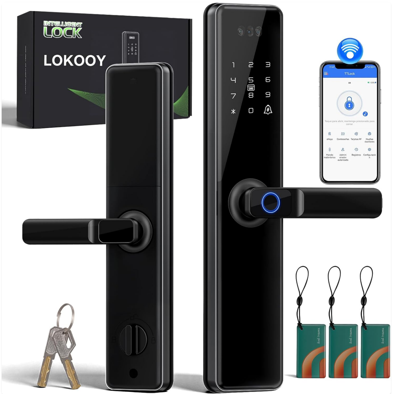
Figure 1: LOKOOY Q6 WIFI Smart Lock components.

This smart lock integrates seamlessly into your home or office security system, providing features such as remote access control, real-time notifications, and robust anti-theft alarms.