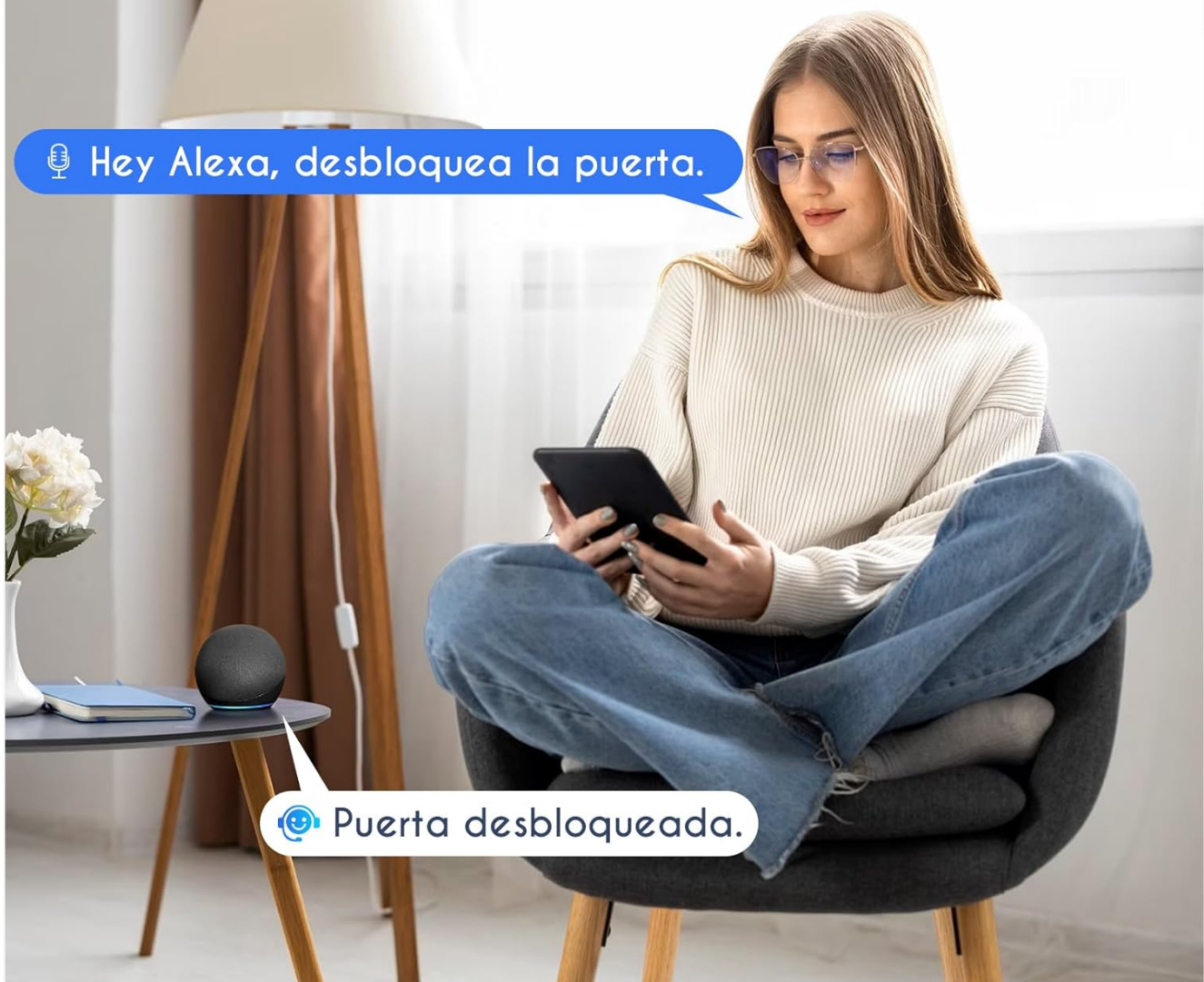
Figure 8: Voice control functionality with smart assistants.