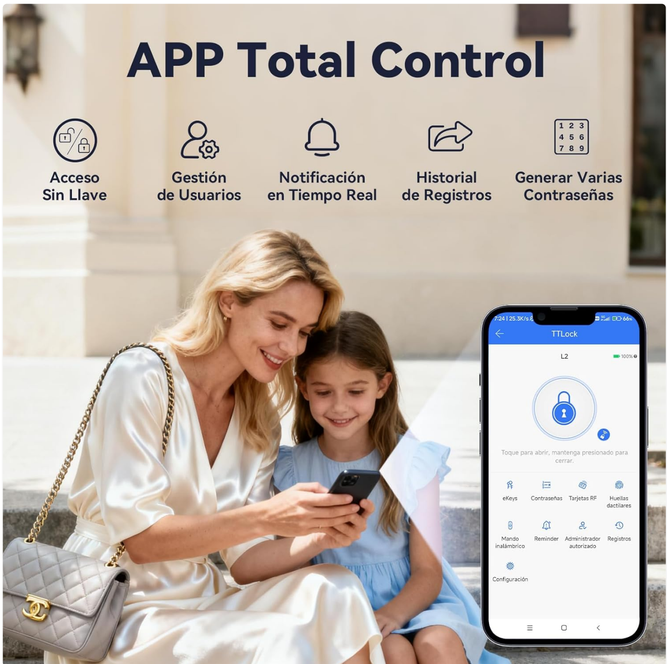
Figure 7: TTLOCK App interface for total control.