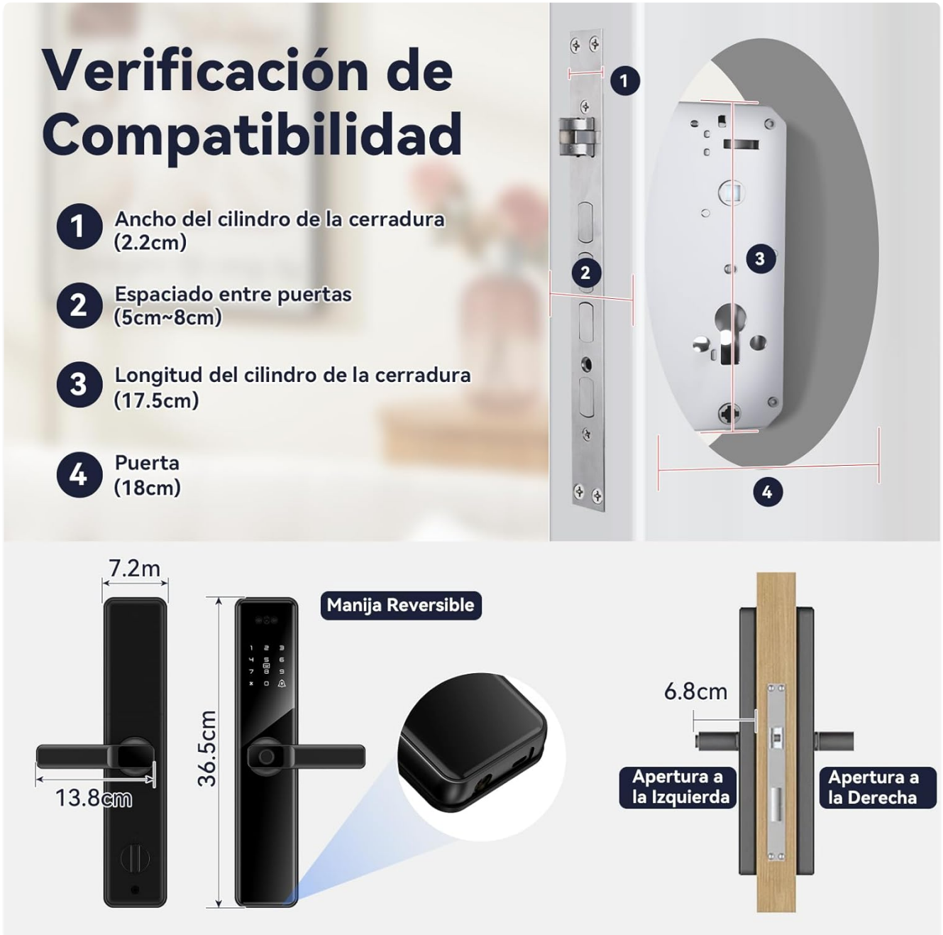
Figure 4: Compatibility verification for door and lock dimensions.