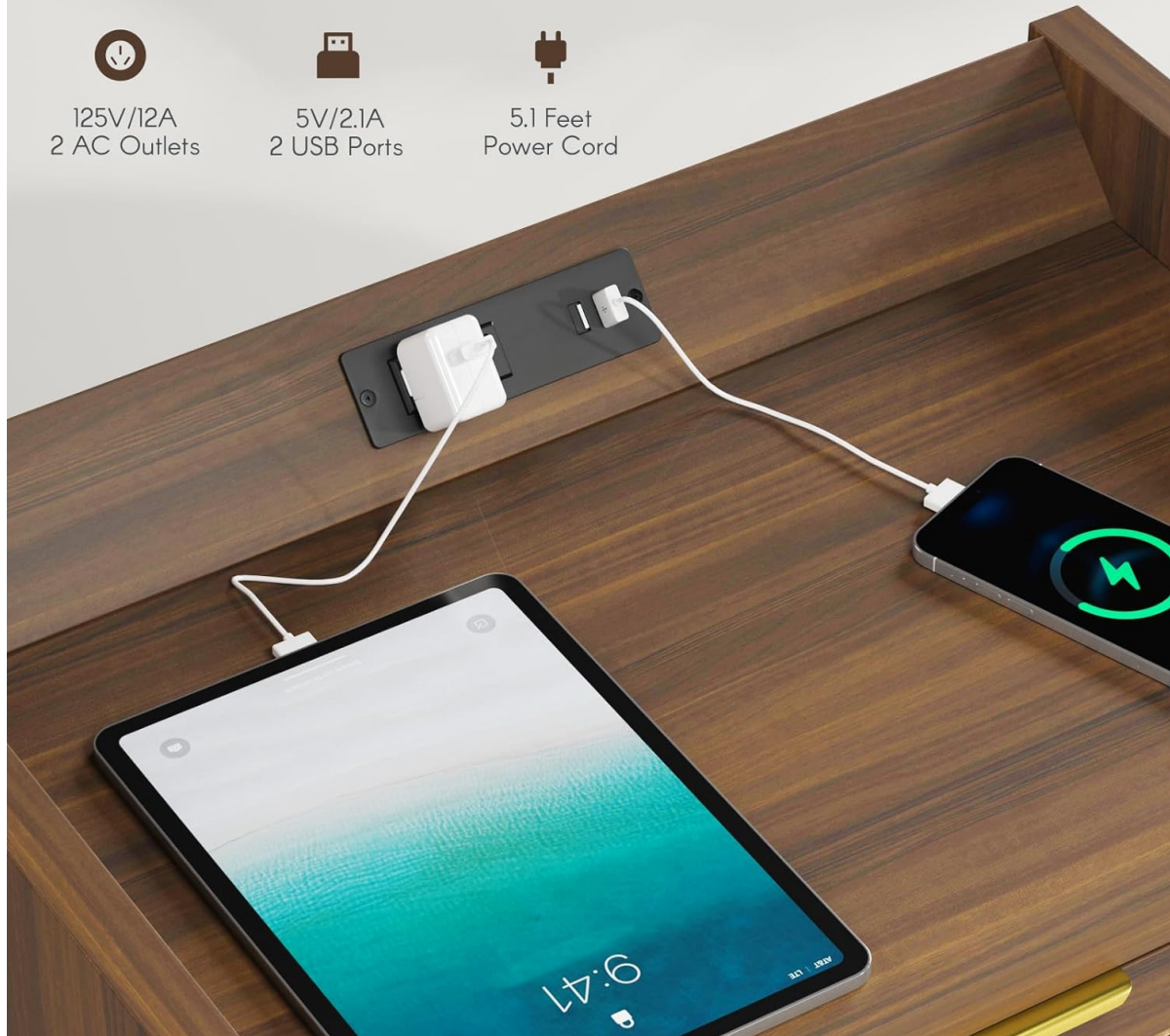
Image: The built-in charging station with 2 AC outlets and 2 USB ports, demonstrating its use with a tablet and smartphone.