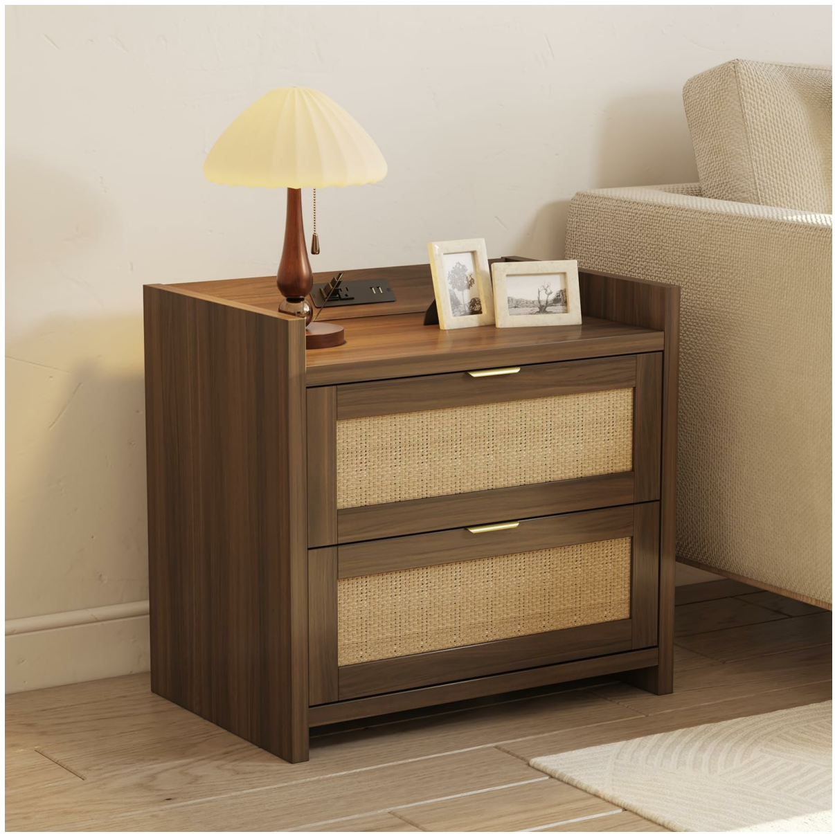
Image: The EROMMY Rattan Nightstand in Walnut, featuring two drawers with rattan fronts and a top surface.