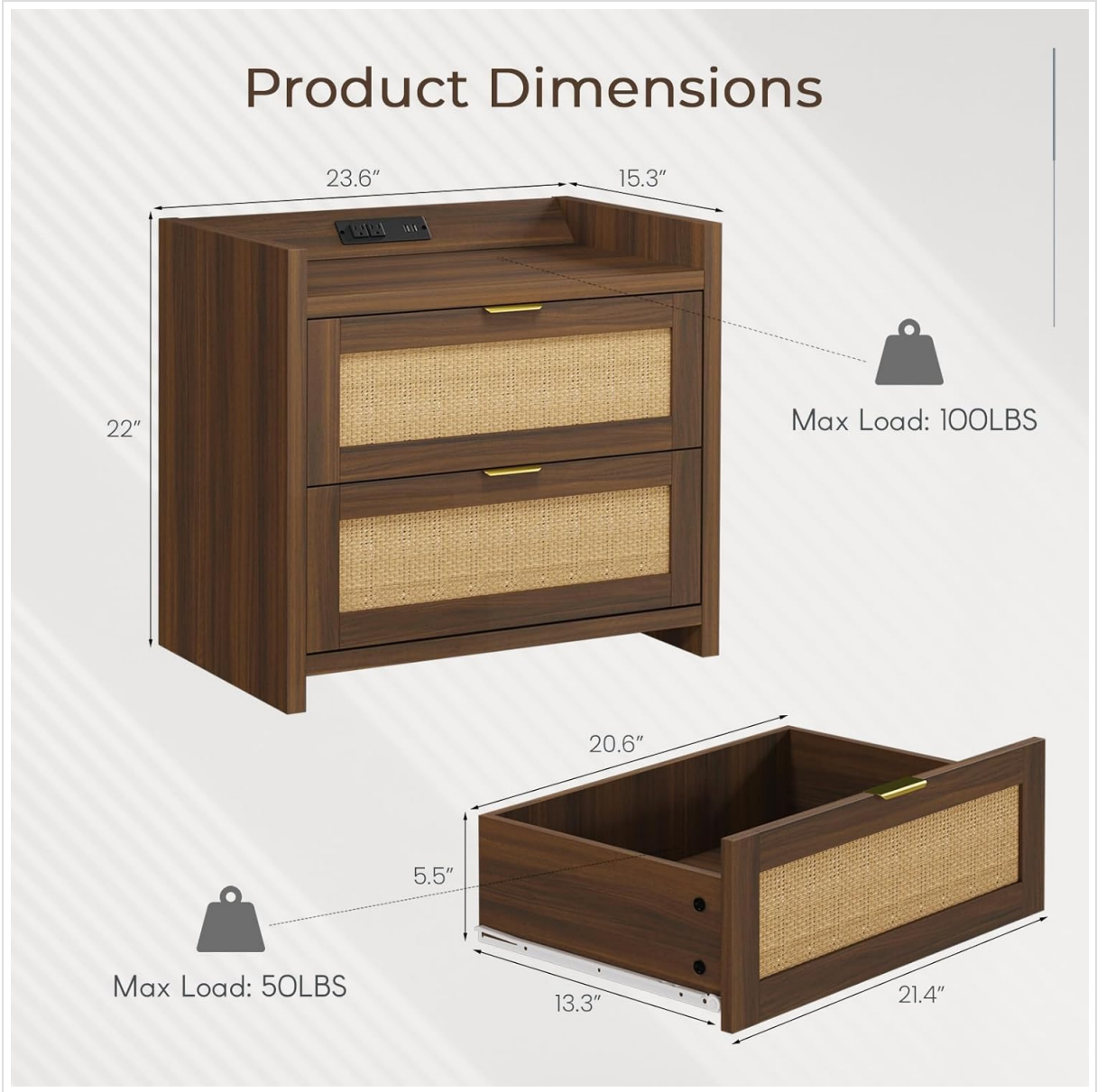
Image: Detailed diagram illustrating the overall product dimensions and individual drawer dimensions, along with maximum load capacities.