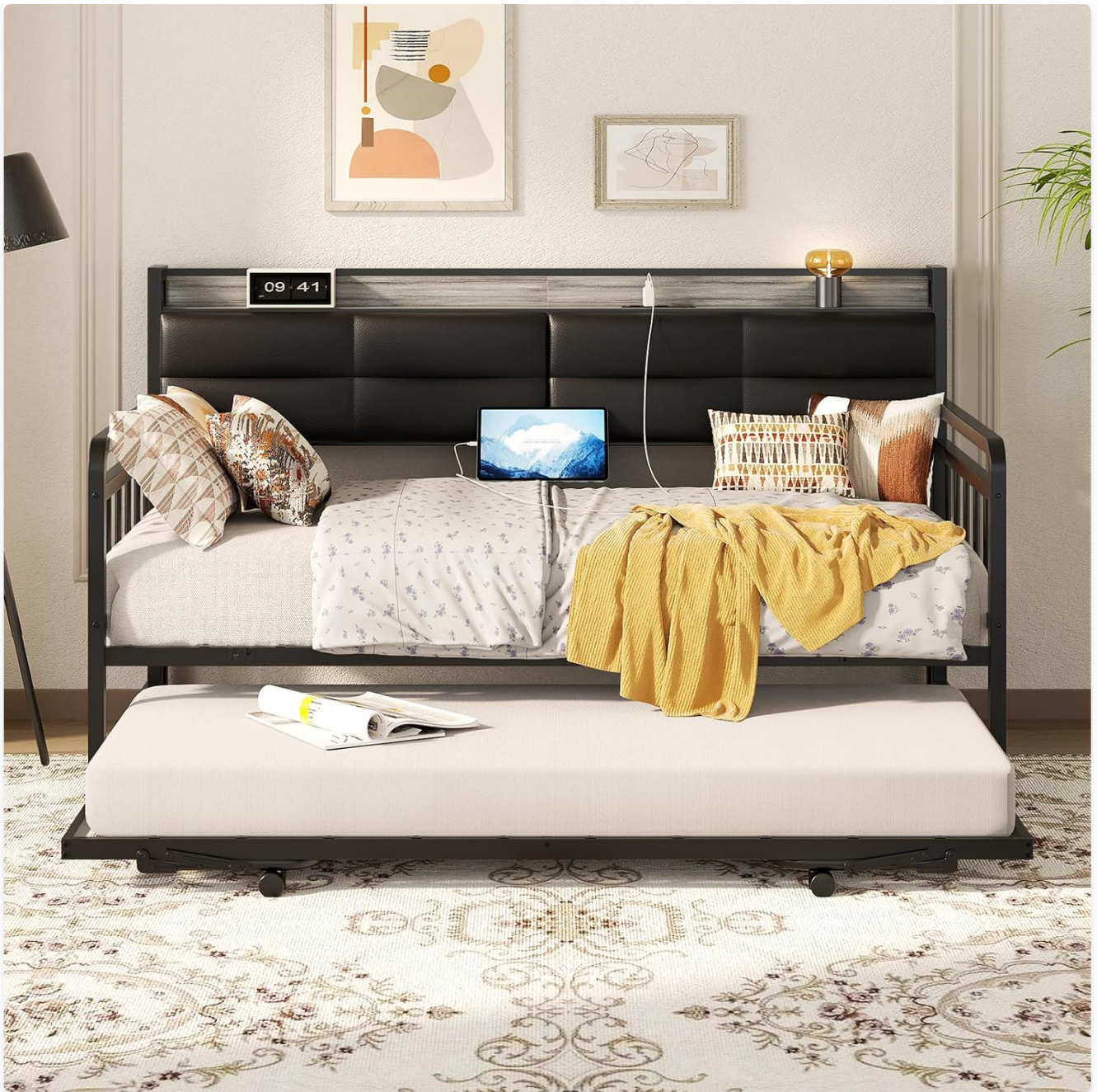
Image 5.2: The daybed with the pop-up trundle extended, illustrating its dual-bed functionality.