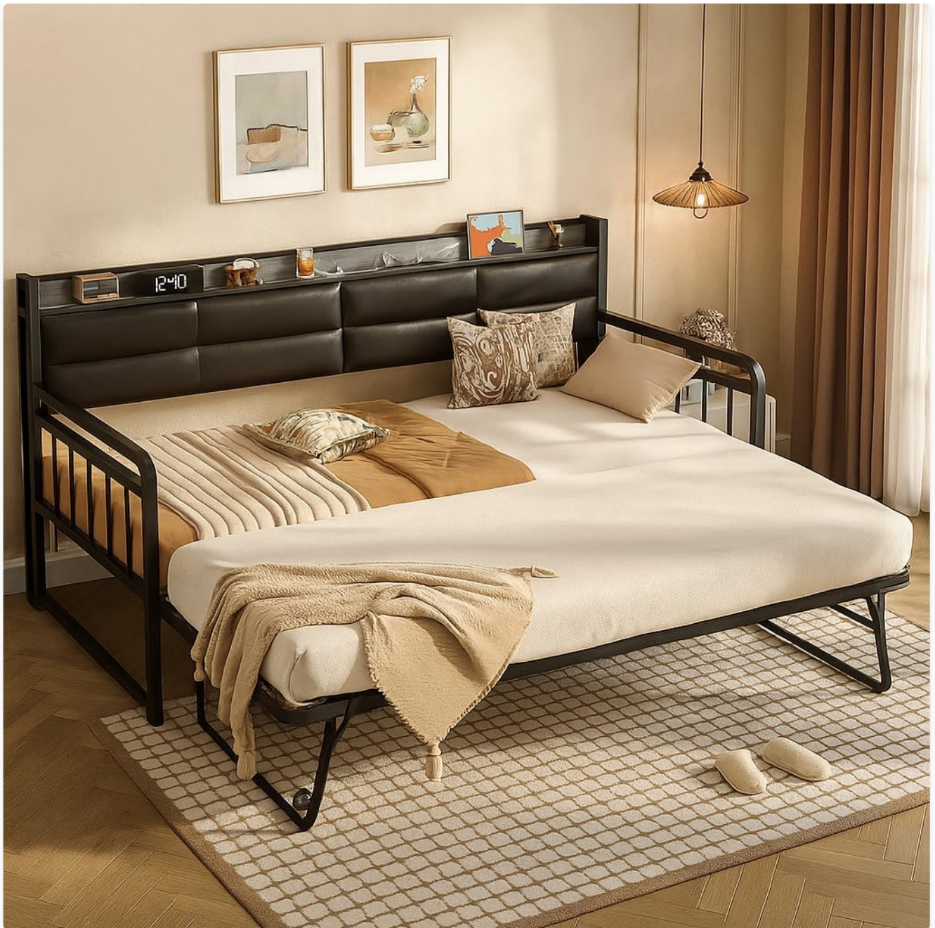
Image 1.1: Homieasy Twin Daybed with Pop-up Trundle and Charging Station in Light Oak.