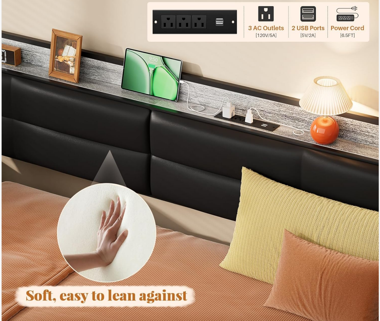
Image 5.1: Detail of the charging station on the upholstered headboard, featuring power outlets and USB ports.