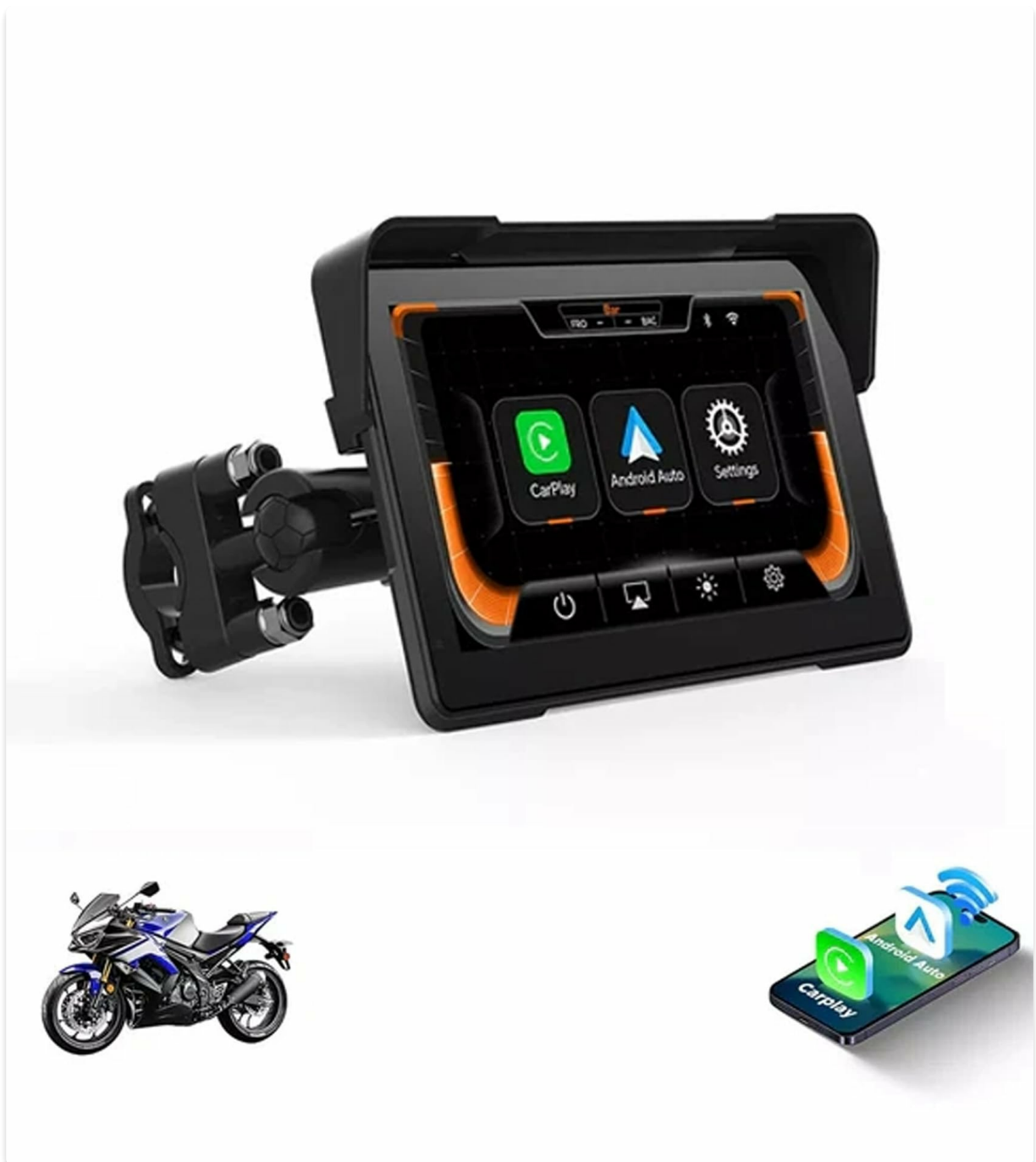
Image: Aoocci C7 7-inch Touchscreen Motorcycle Internet Navigation System. This image shows the device with a motorcycle in the background, highlighting its 7-inch touchscreen display.