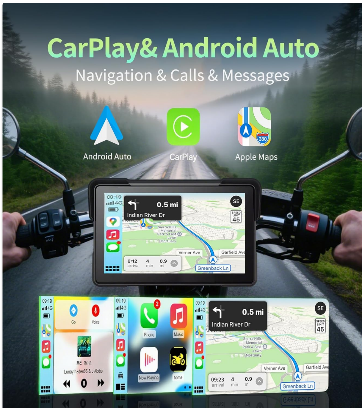
Image: Aocci C7 CarPlay & Android Auto Interface. This image shows the device displaying navigation and media playback interfaces for both CarPlay and Android Auto.