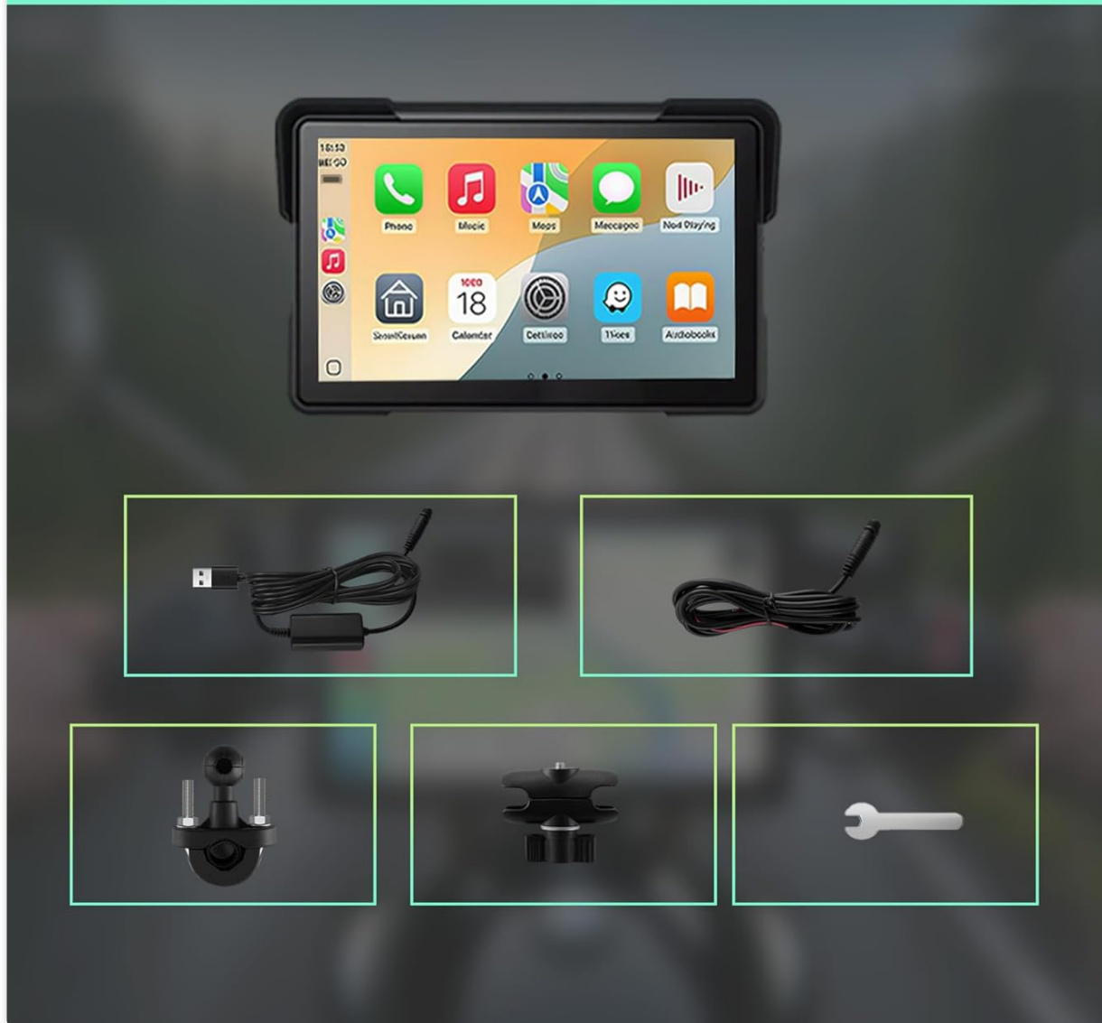
Image: Aooeci C7 Parts & Accessories. This image displays the main unit along with the power cable, mounting hardware, and other included tools.

Your browser does not support the video tag.