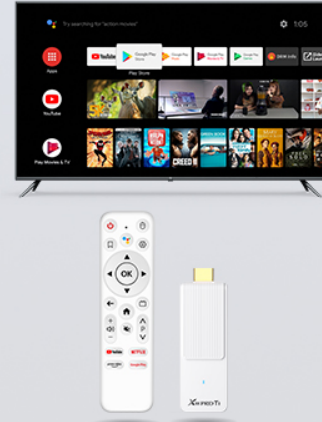
Image: Visual guide for the three-step setup process.