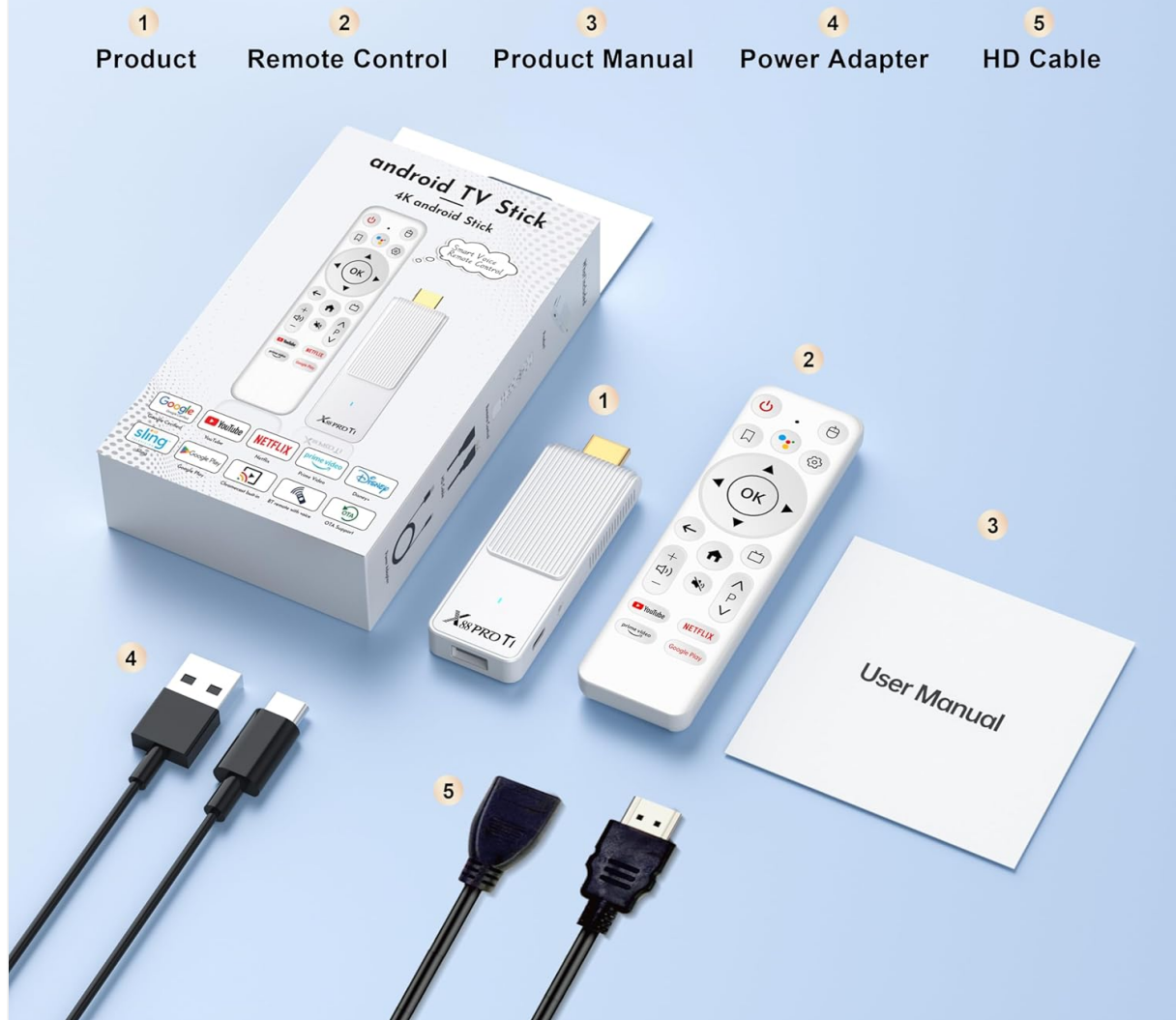
Image: Contents of the GREVA X88 PRO T1 Android TV Stick package.