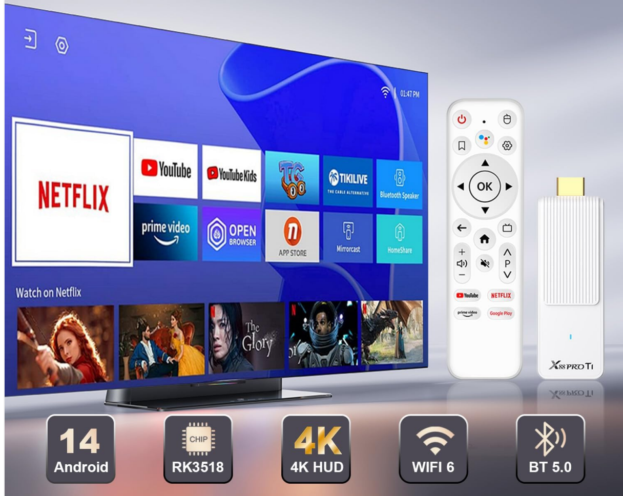
Image: The Android 14.0 system interface with available applications.

Smart Android TV Stick: built with multiple apps, enjoy massive shows freely!