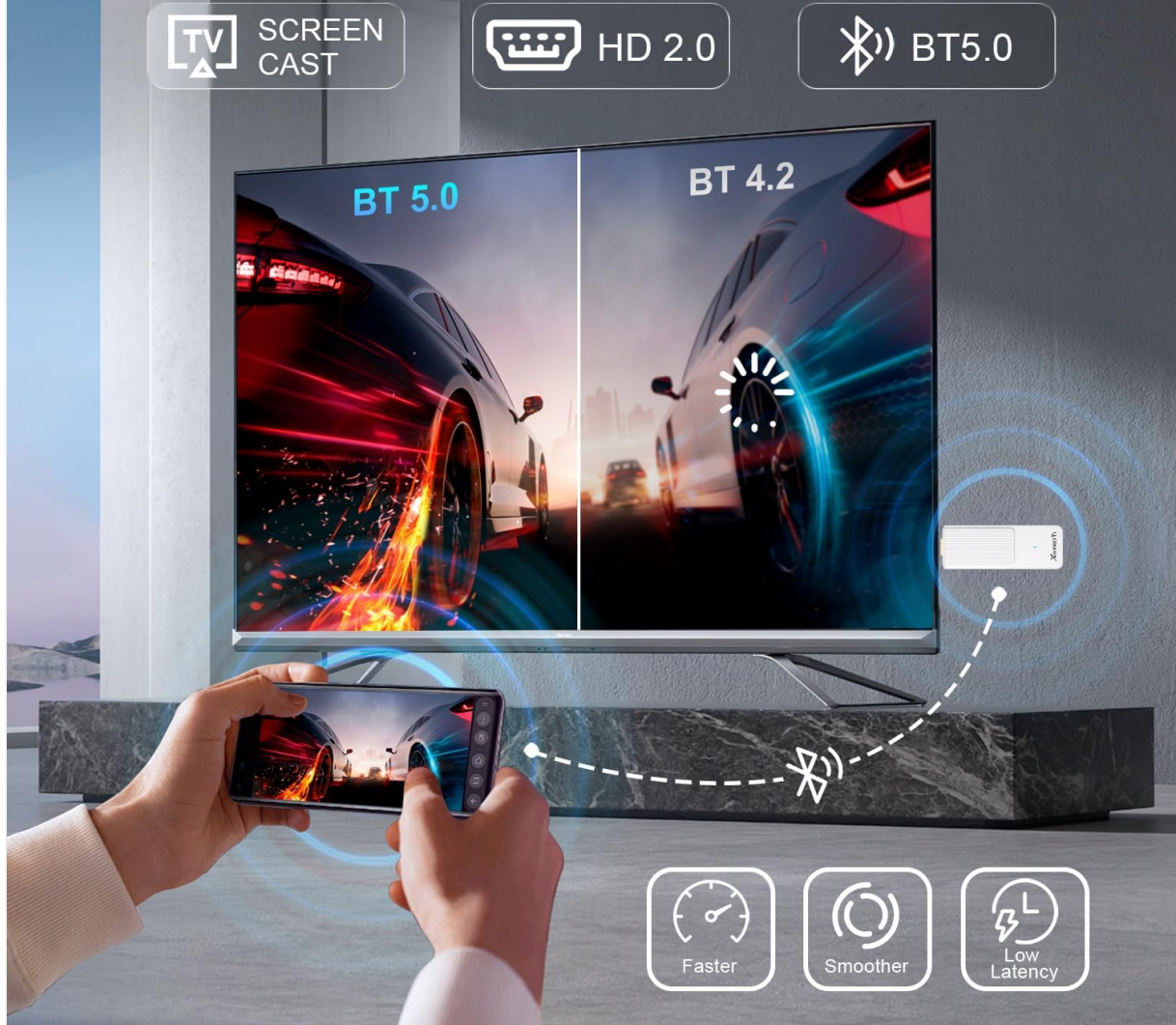
Image: Demonstrating screen casting functionality from a mobile device to the TV.