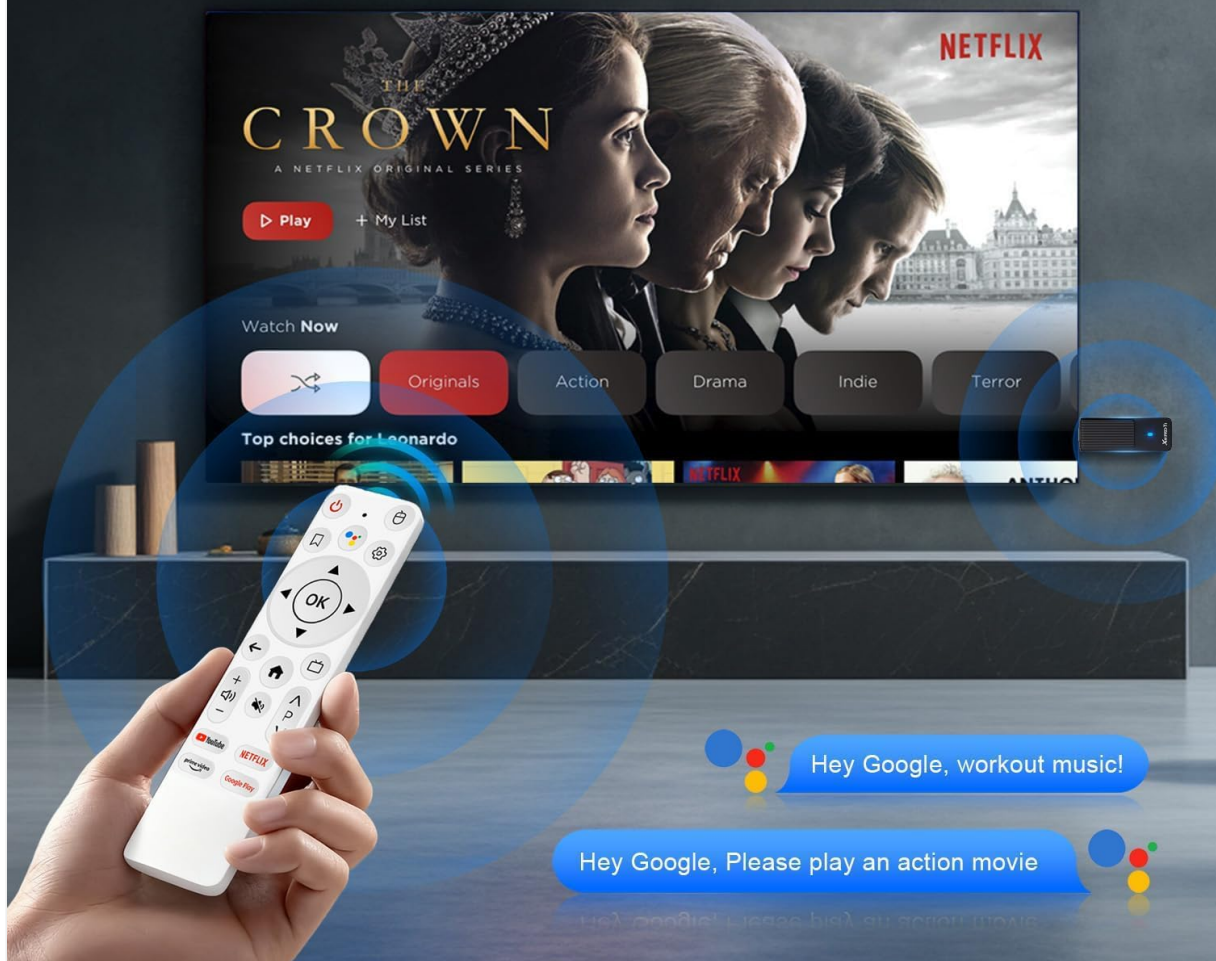
Image: Using the smart voice remote control to interact with the TV Stick.

Hold down the voice button to search for popular apps, such as PrimeVideo, Netflix, Disney+.