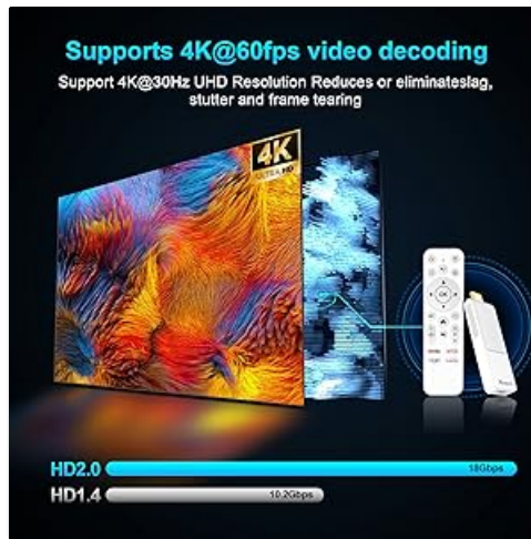
Image: Interface and dimensions of the GREVA X88 PRO T1 Android TV Stick.