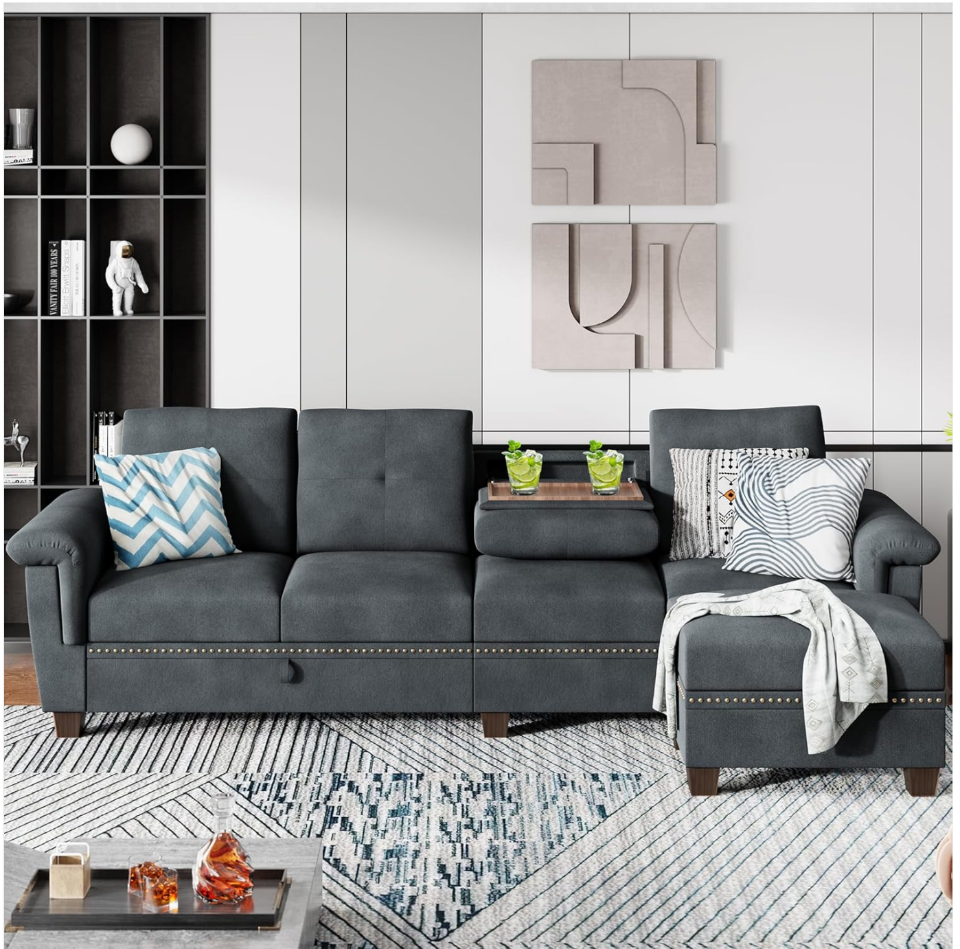
Image: The Shintechi Sectional Couch with its collapsible center backrest transformed into a convenient wooden tray, holding two beverages.