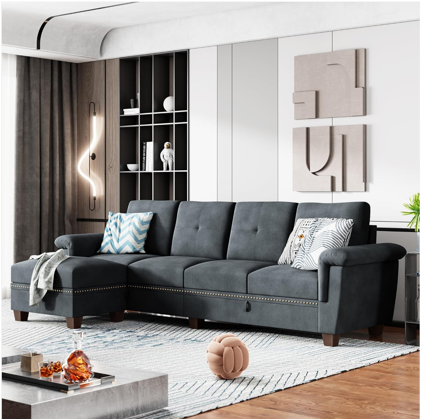
Image: The Shintenchi Sectional Couch in Deep Grey, configured as an L-shape with a chaise lounge, in a modern living room setting.