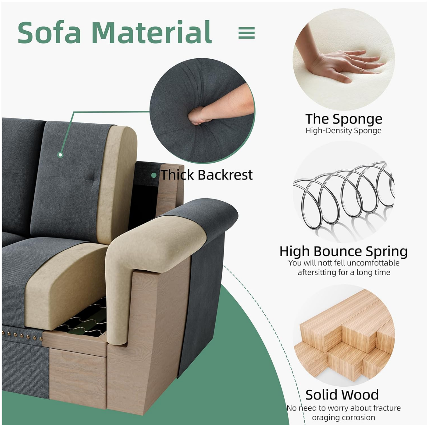
Image: Cutaway view detailing the construction materials of the sofa, including high-density sponge, high bounce springs, and a solid wood frame for durability and comfort.