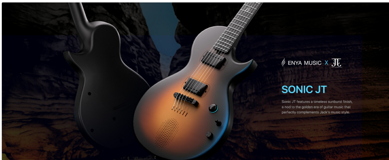
Figure 2: The Enya Sonic JT guitar showcasing its built-in 15W wireless speaker, allowing for direct play without external amplification.