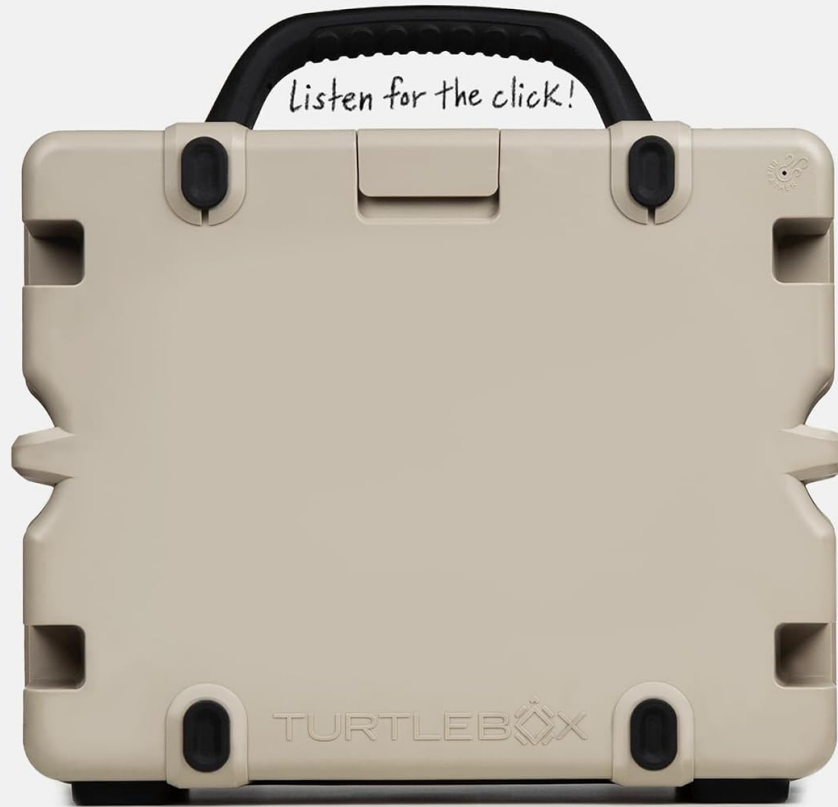
Image: Rear view of the speaker, highlighting its waterproof sealing.