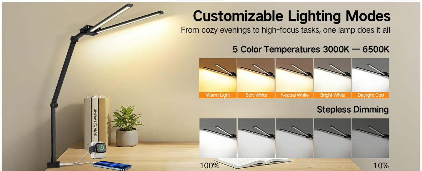
Image: A visual representation of the lamp's customizable lighting modes, displaying 5 color temperatures from Warm Light (3000K) to Daylight Cool (6500K) and stepless dimming from 100% to 10% brightness.