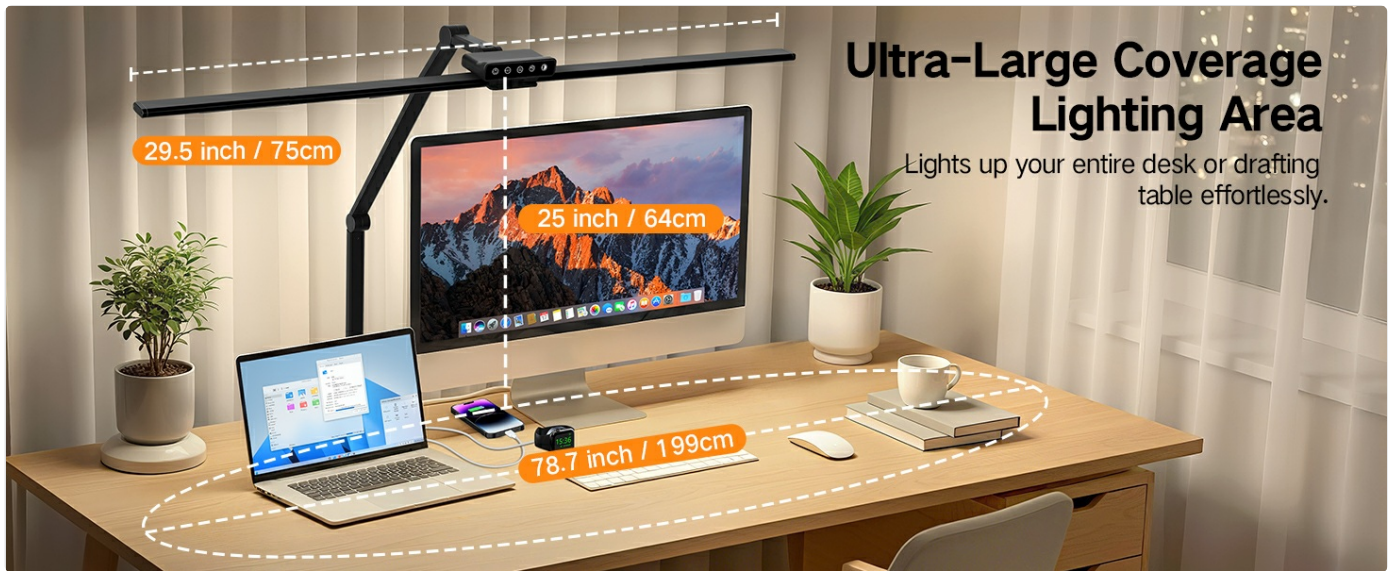
Image: A modern desk setup with a monitor and laptop, illuminated by the OUTON lamp, demonstrating its ultra-large coverage lighting area of 29.5 inches (75cm) wide and 25 inches (64cm) deep, effectively lighting the entire workspace.