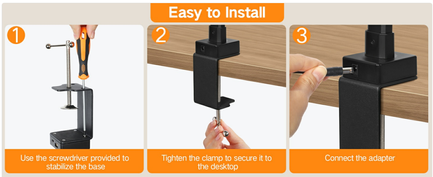
Image: A visual guide showing three steps for easy installation: stabilizing the base with a screwdriver, tightening the clamp to the desktop, and connecting the power adapter.