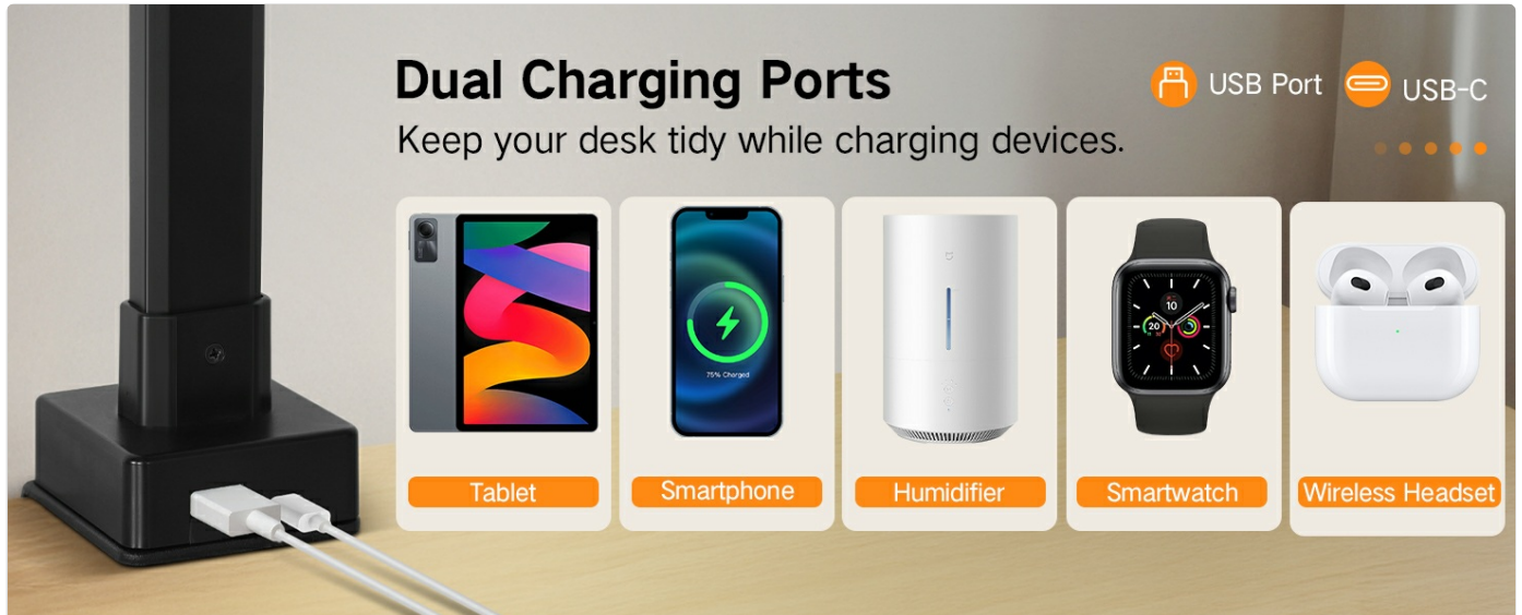
Image: The lamp's base with integrated USB-A and USB-C charging ports, shown actively charging a smartphone and wireless earbuds, illustrating its utility in keeping a desk tidy.