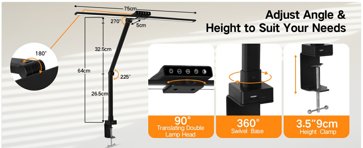
Image: A technical diagram detailing the adjustable angles and dimensions of the lamp, including 90° translating double lamp head, 360° swivel base, and a 3.5-inch (9cm) height clamp, with measurements for arm length and head width.