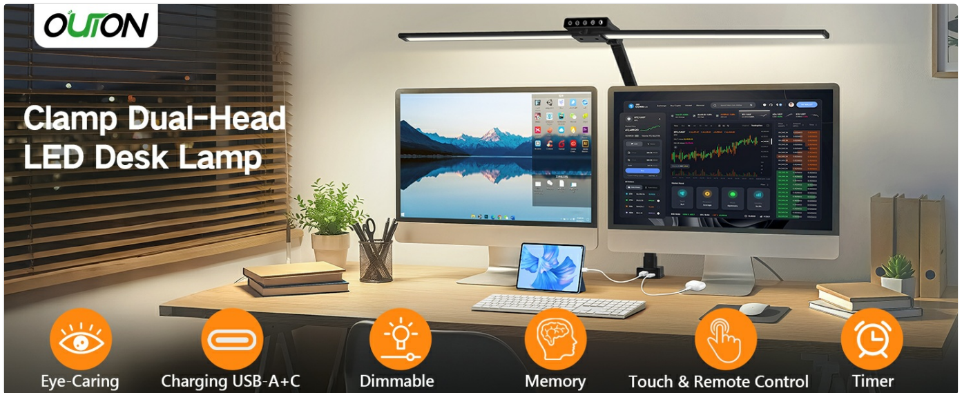
Image: The OUTON Clamp Dual-Head LED Desk Lamp highlighting its key features such as eye-caring light, USB-A+C charging, dimmable function, memory, touch & remote control, and timer.