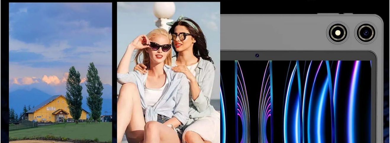
Image: Close-up of the tablet's dual rear cameras (5MP front, 13MP rear) with example photos.