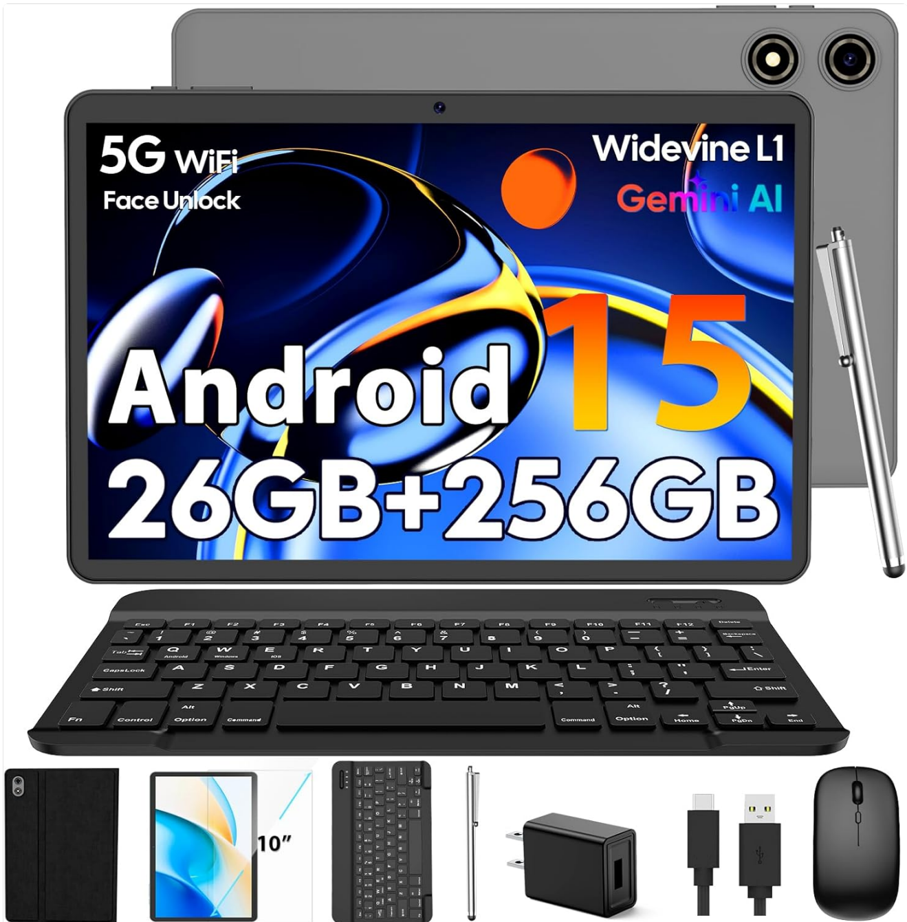
Image: YLEEBG P30 Tablet and included accessories, including the tablet, keyboard, mouse, stylus, case, charger, and cables.

The tablet case color may vary. The tablet itself is silver.