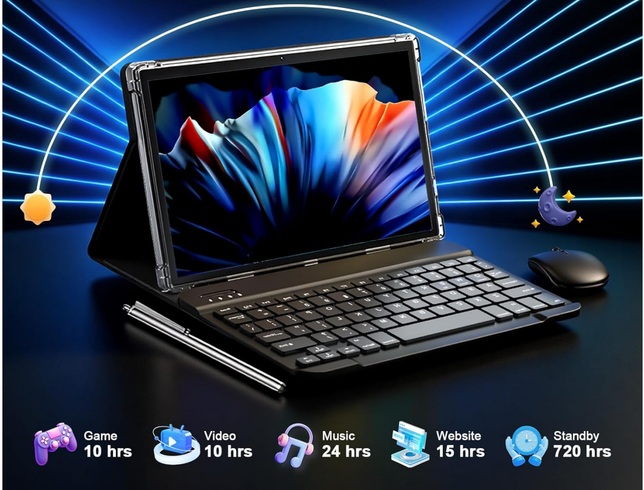
Image: The tablet connected to a Type-C charger, displaying battery percentage, alongside icons indicating estimated battery life for various activities like gaming, video, music, and web browsing.