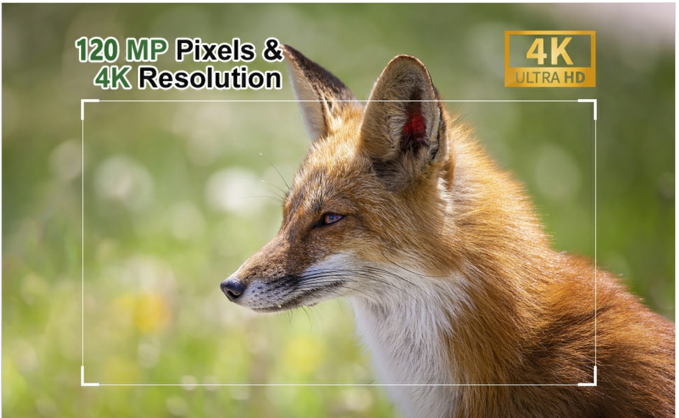
Image: A split image demonstrating the superior clarity of 120MP 4K capture from the HC801PRO compared to other cameras, highlighting fine details in wildlife.