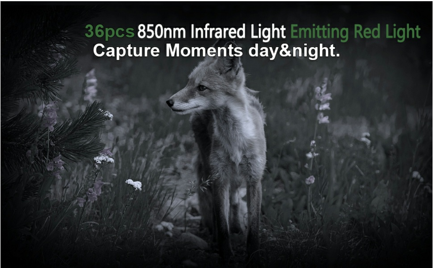
Image: A night scene captured by the camera, featuring a fox in a forest, demonstrating the effectiveness of the 850nm infrared night vision.

36pcs 850nm Infrared Light Emitting Red Light Capture Moments day&night.