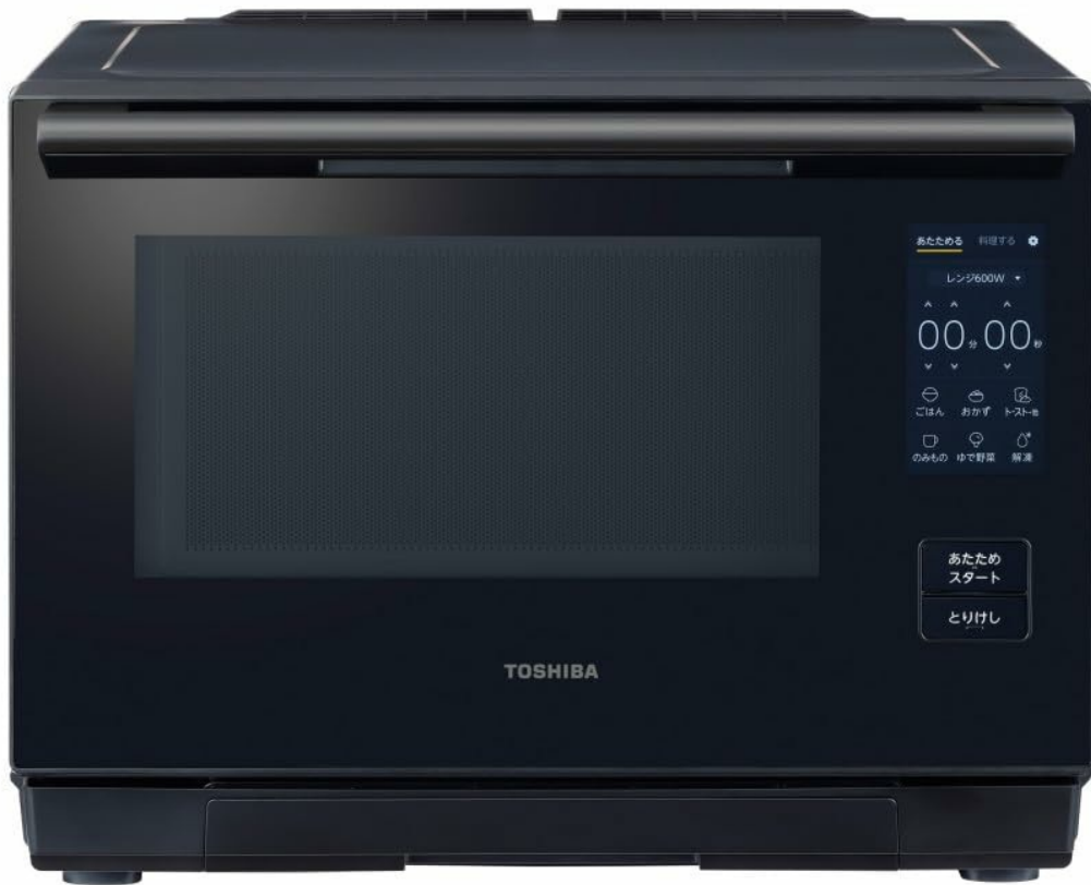
Figure 1.1: Toshiba ER-D4000B Oven Range with key specifications.

Key features include a High-angle infrared sensor for precise temperature detection, specialized cooking modes like 'Stone Kiln Omakase Baking' and 'Easy Bowl Pasta/Curry Plus', and 'Superheated Steam Cooking' for healthier meals. The oven also boasts a space-saving design and a Smart Damper for quiet door closure.