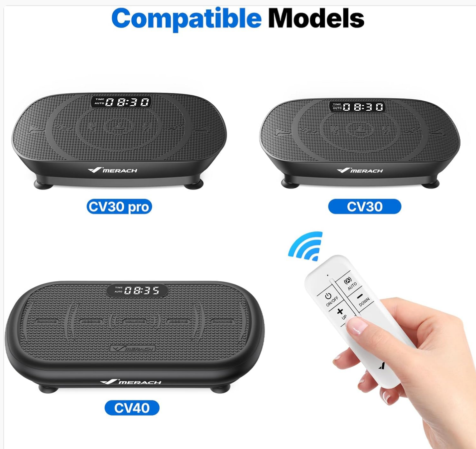
Image 2: Visual representation of compatible MERACH Vibration Platform models (CV30 pro, CV30, CV40) and the remote control.