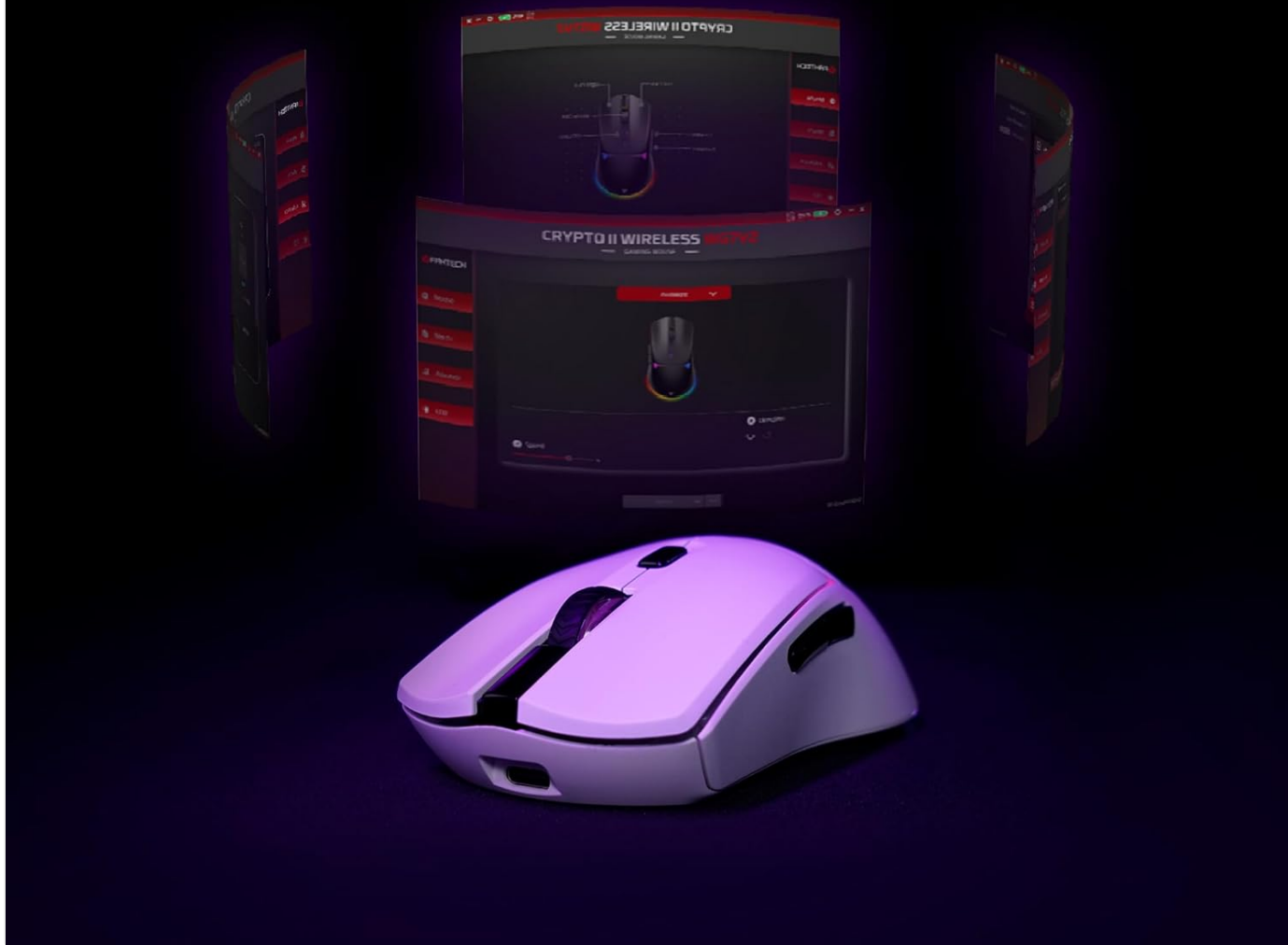
Image: A visual representation of the Fantech software interface, demonstrating options for button assignments, macro editing, report rate, and DPI stages, with settings saved to onboard memory.

Adjust various settings such as button assignments, macro editing, report rate, and DPI stages, all of which can be saved directly to the device's on-board memory for easy access.