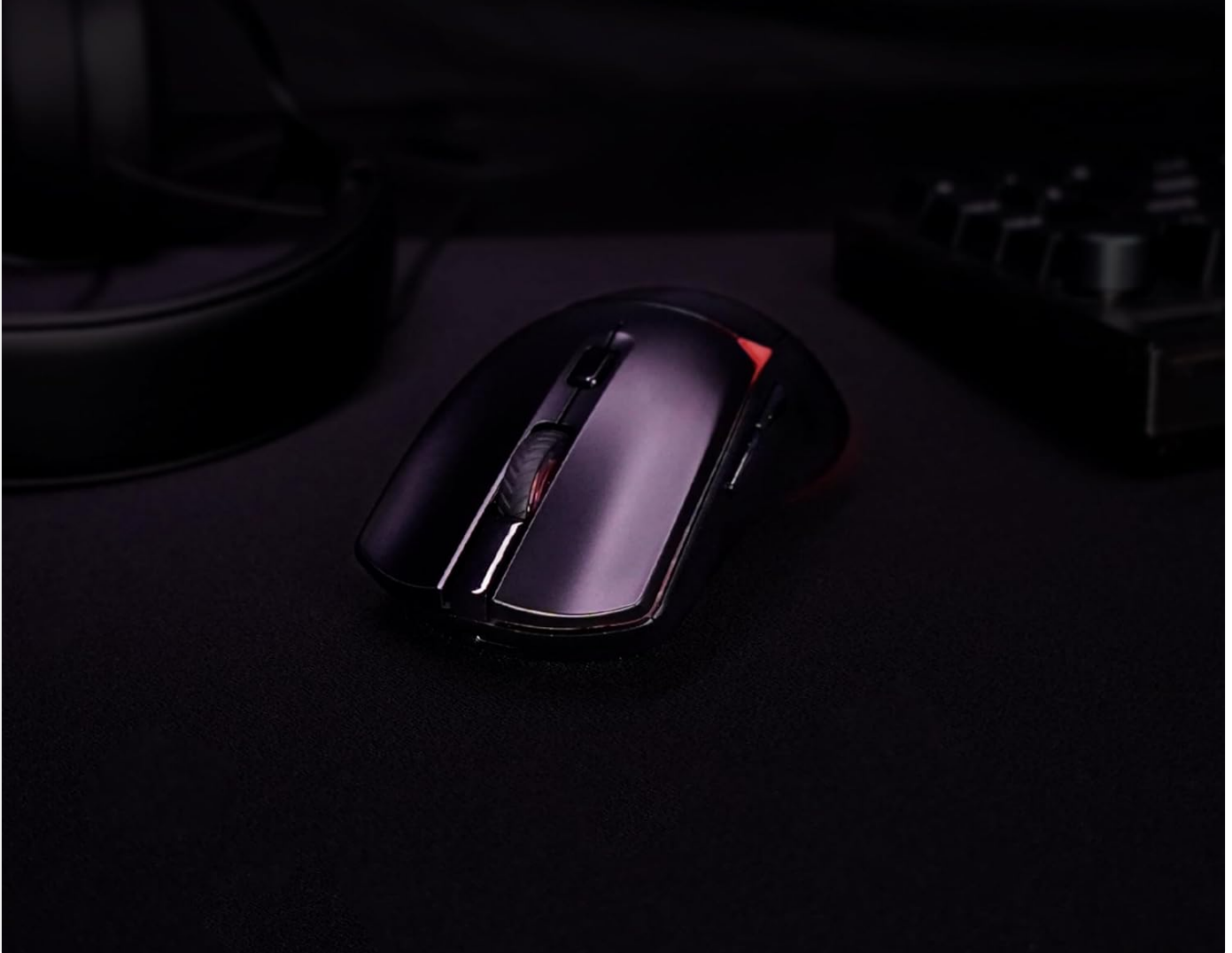
Image: Close-up of the Fantech Crypto II mouse, highlighting its grippy coating for enhanced control during intense gaming sessions.

Experience next level precision and control with grippy coating! Engineered to provide unparalleled friction, ensuring the mouse stays firmly in your grasp during intense gaming sessions.