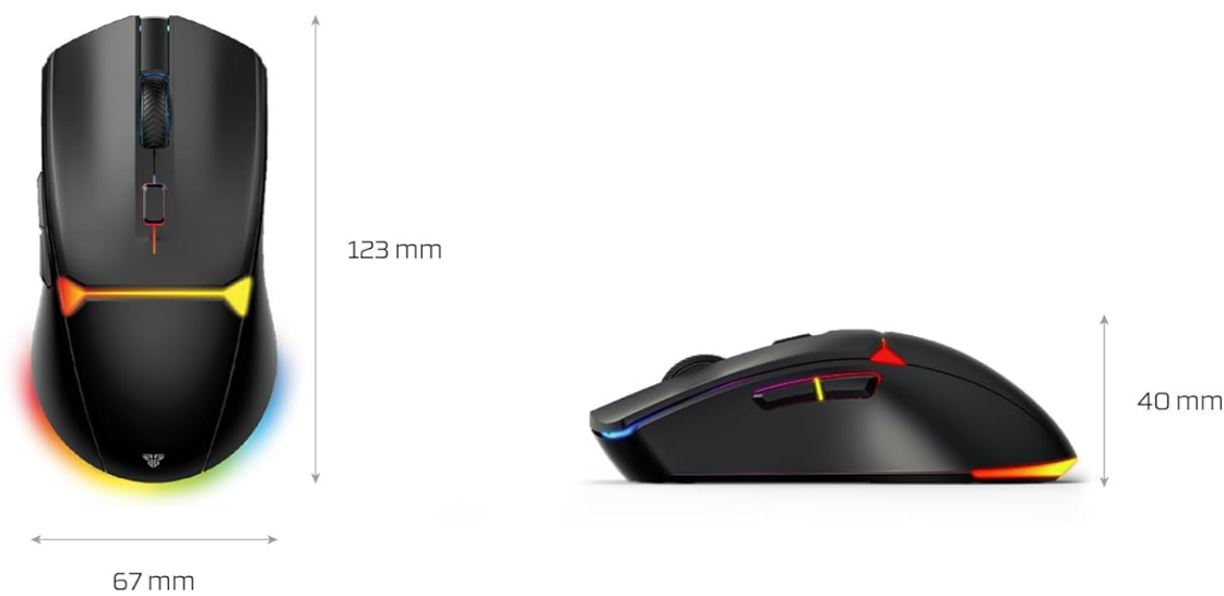
Image: Detailed technical specifications table and dimensional drawings of the Fantech Crypto II mouse, showing length (123mm), width (67mm), and height (40mm).