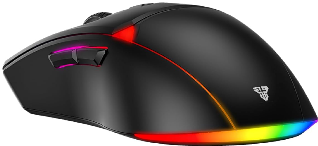
Image: The Fantech Crypto II Wireless Gaming Mouse, showcasing its ergonomic design and vibrant RGB lighting.