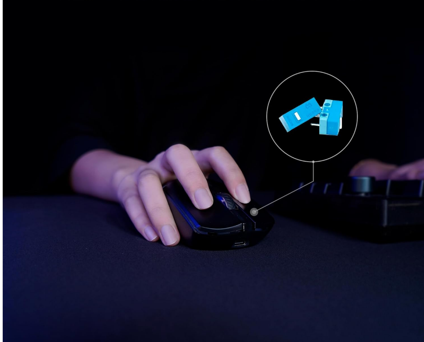
Image: A user's hand on the Fantech Crypto II mouse, with an inset highlighting the Huano Blue Shell White Dot switches, known for high durability and precise click feedback.

High durability, precise click feedback, up to 20 million clicks. It's suitable for long hours of use, especially for gaming and office environments.