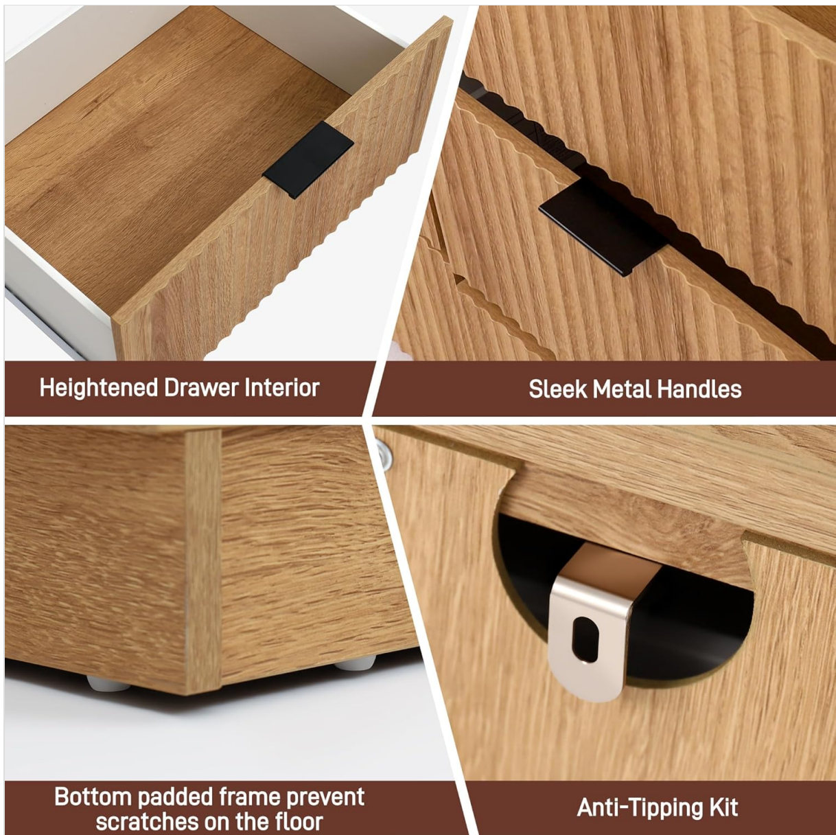
Heightened Drawer Interior