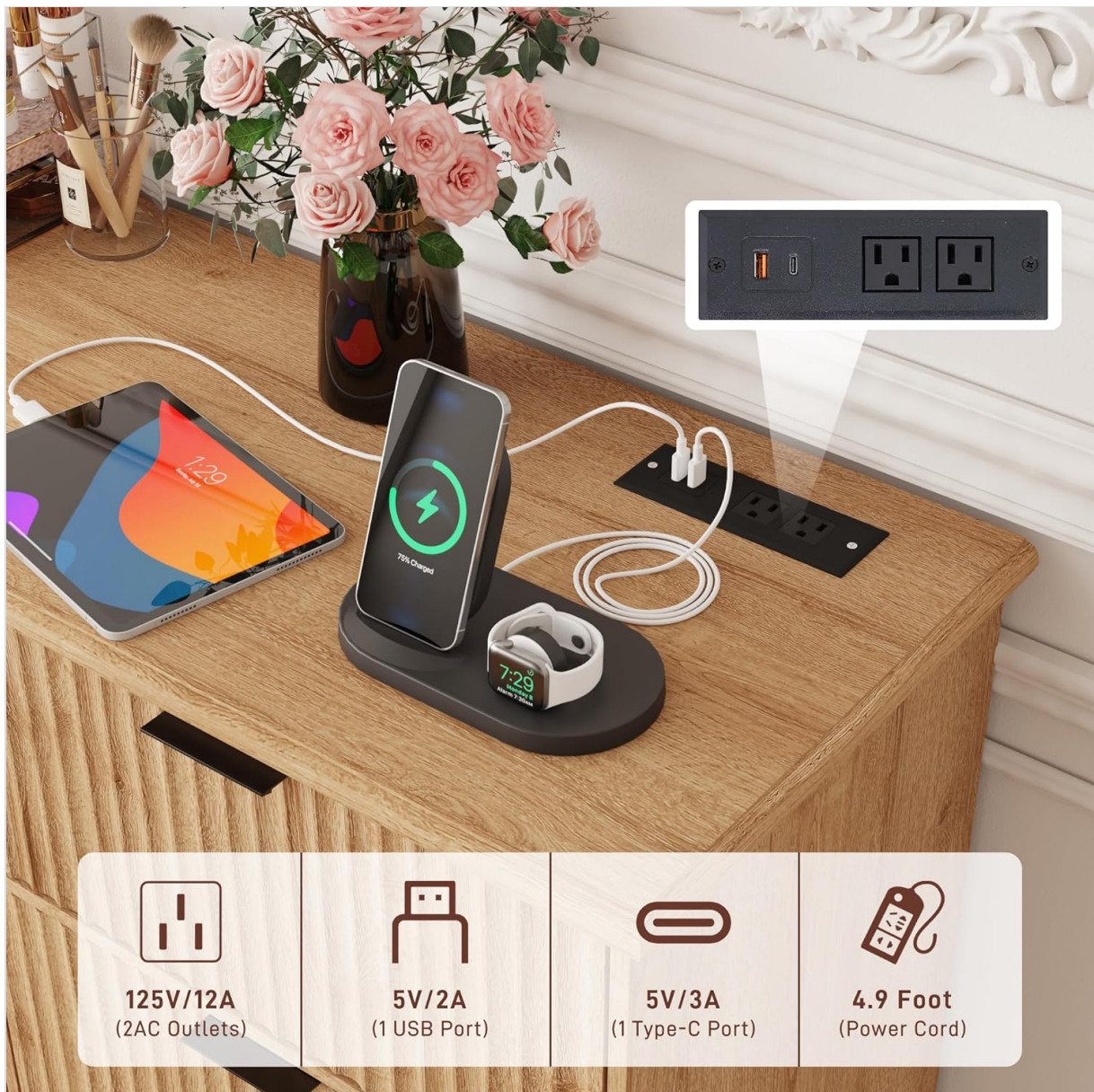
Image: The integrated charging station on the dresser top, featuring two AC outlets, one USB port, and one Type-C port, actively charging a tablet, smartphone, and smartwatch.