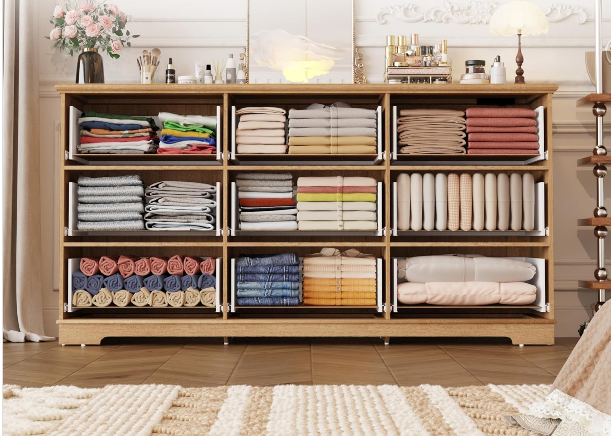
Image: The dresser with drawers open, illustrating ample storage capacity for various items such as clothing, ornaments, socks, bags, scarves, and toys.