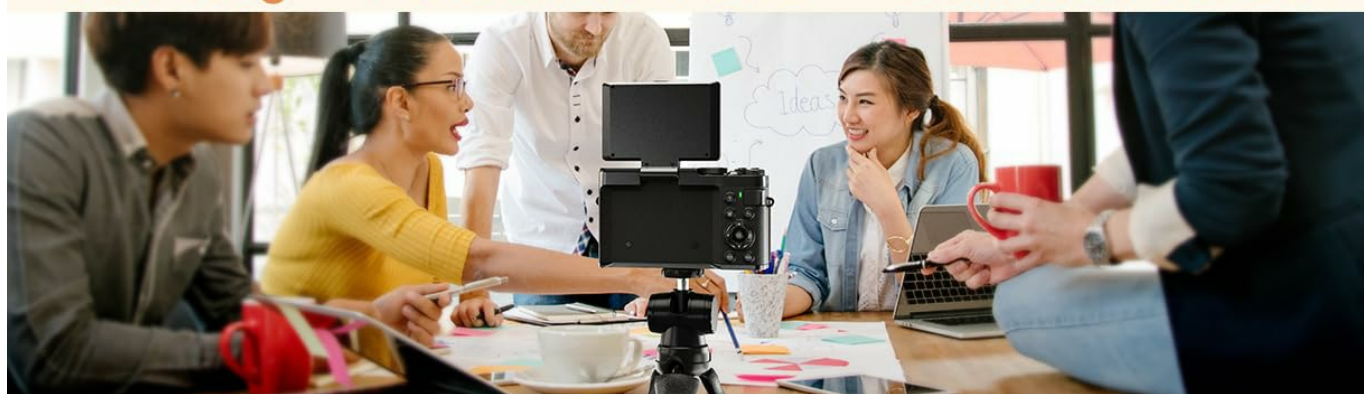
Image: The camera set up as a webcam, connected to a laptop for video interaction.

USB Plug → PC Camera Mode → Start Interaction!