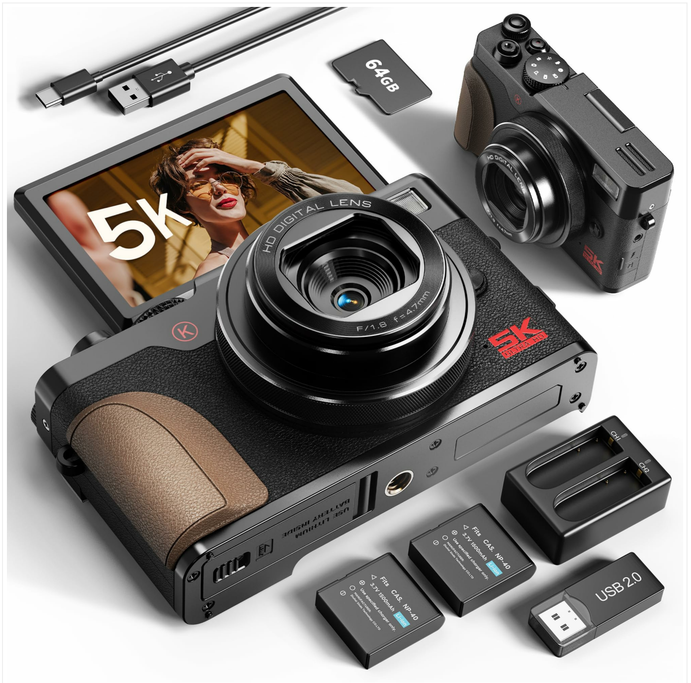
Image: The camera's 180-degree flip screen in use, ideal for vlogging and selfies.