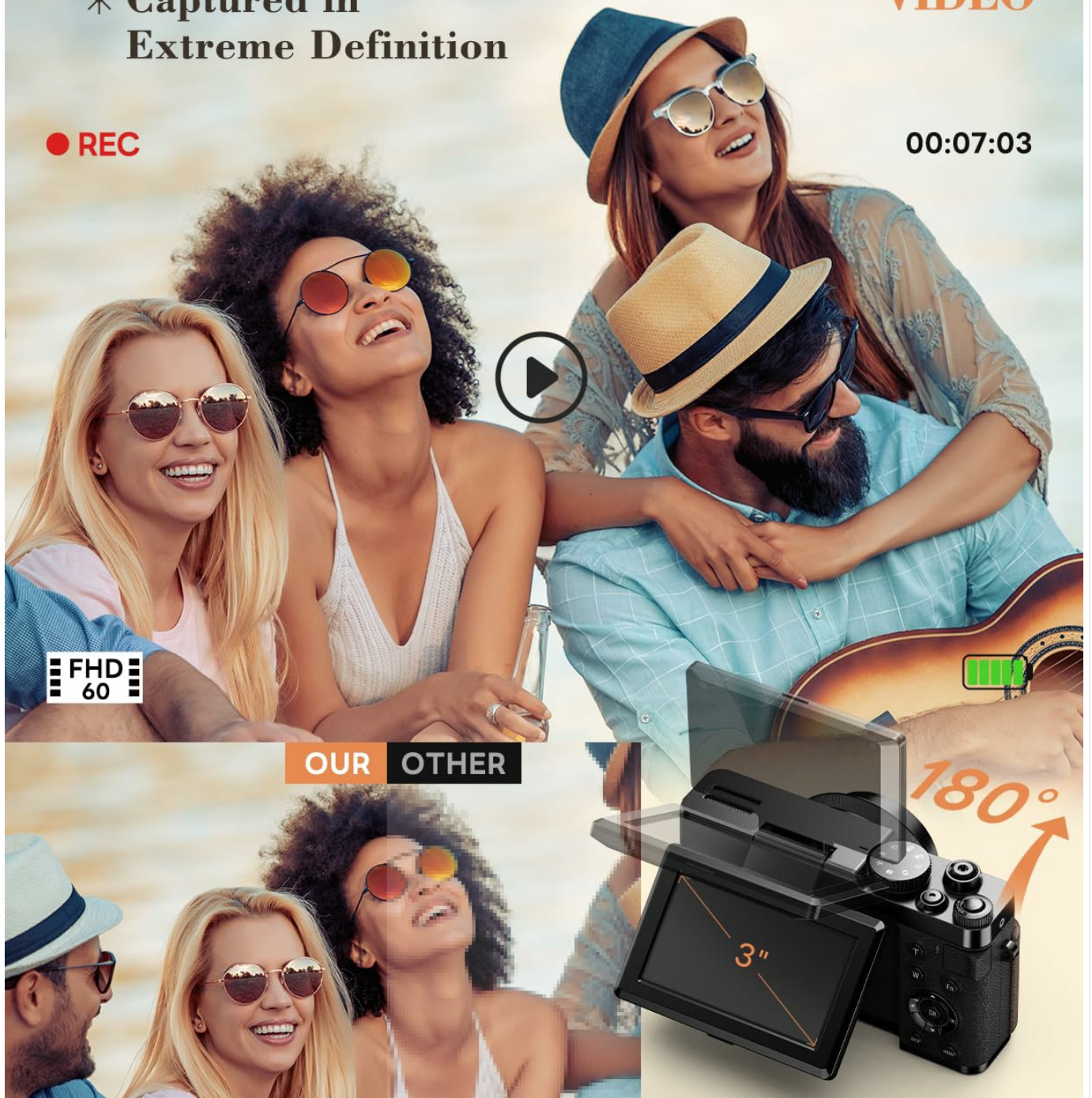
Image: The NBD 64MP 5K Digital Camera, showcasing its compact design and included accessories.