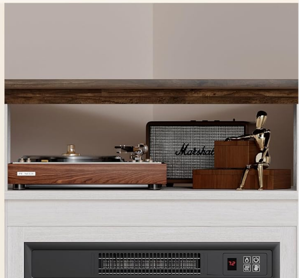
Figure 3: Front view of the assembled TV stand, ready for use.