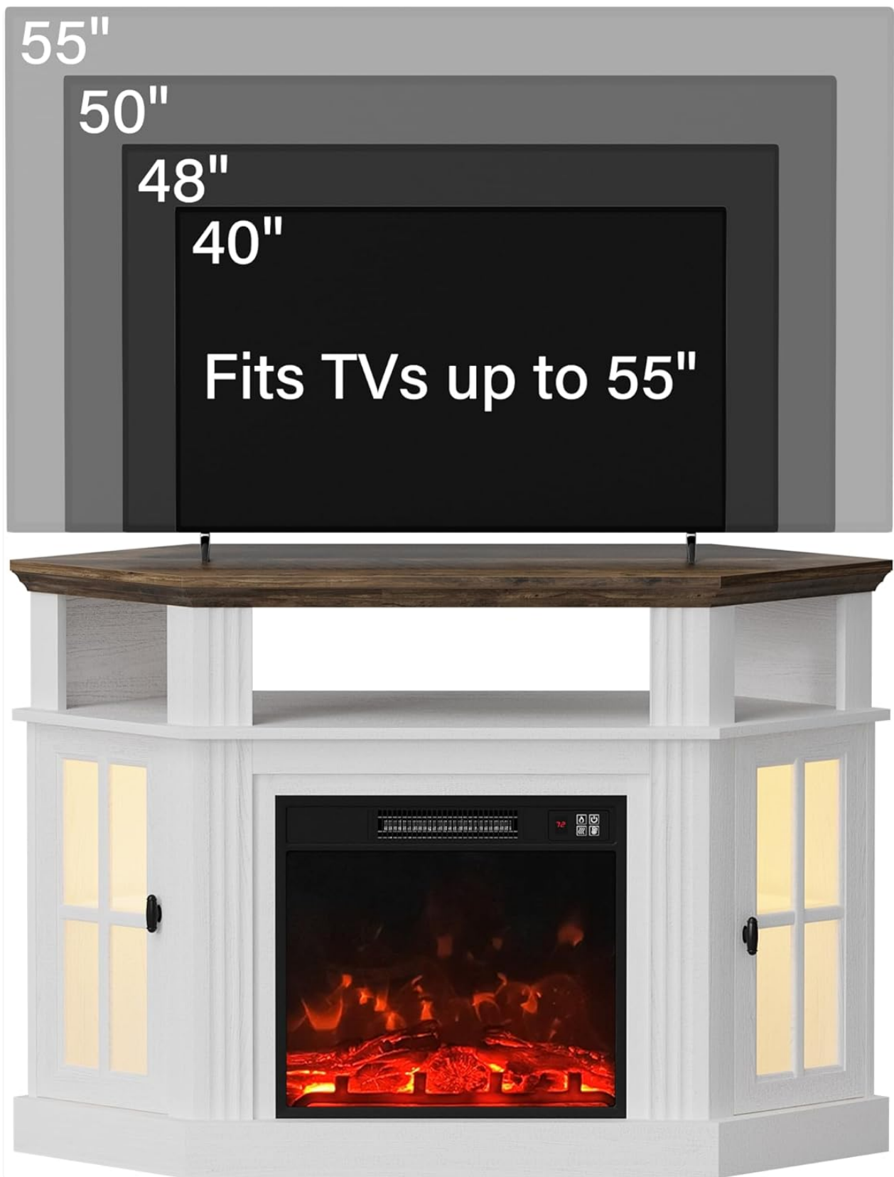
Figure 4: The TV stand is compatible with TVs up to 55 inches.