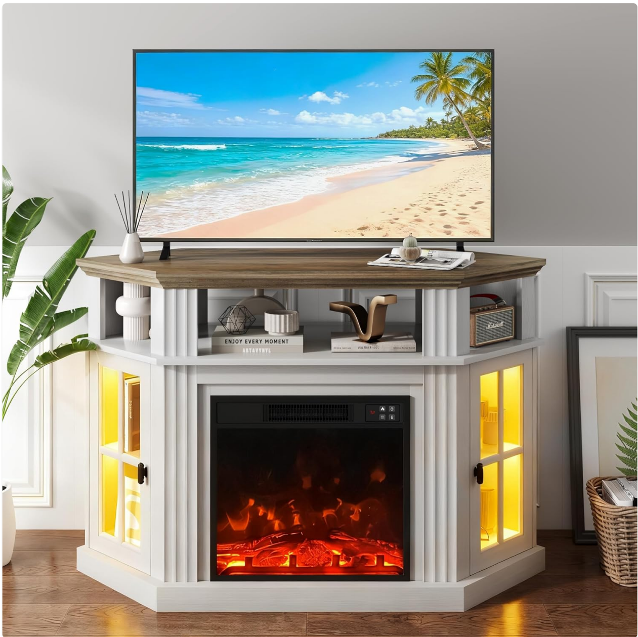
Figure 1: The YESHOMY LED Corner Fireplace TV Stand in a living room setting.