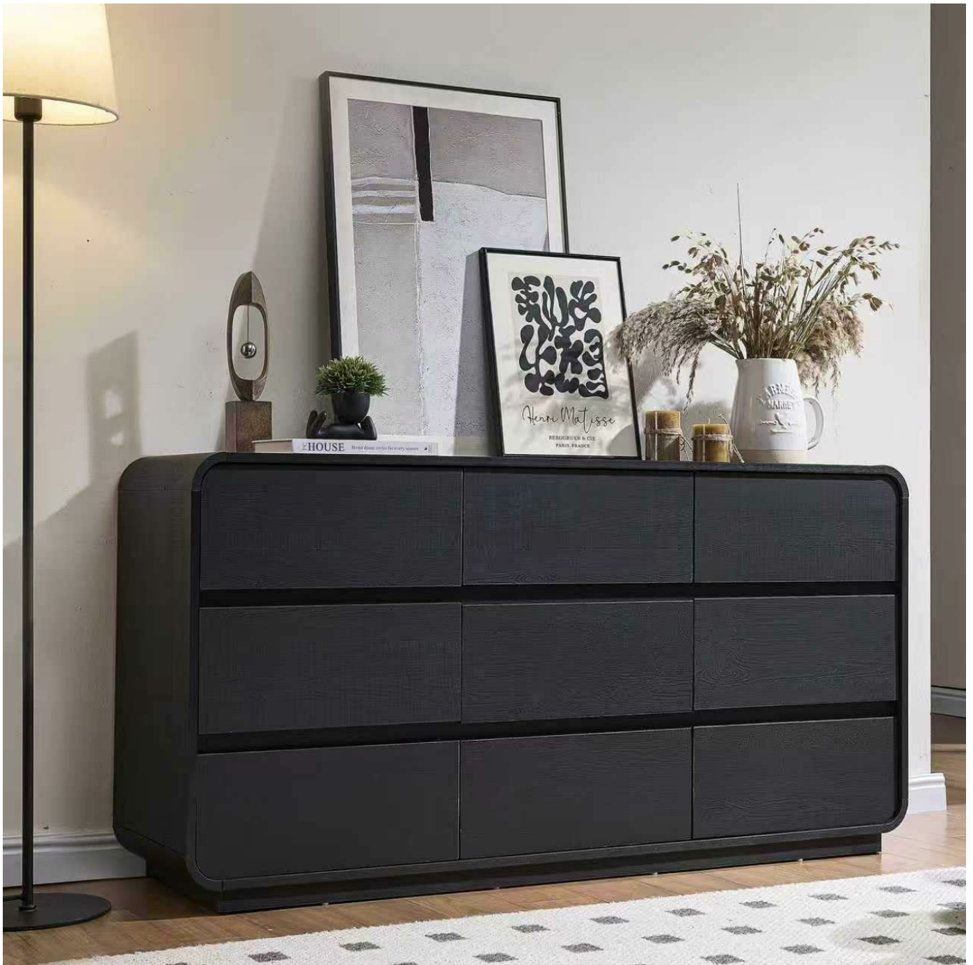
Image Description: A full view of the assembled Standifurno 9-Drawer Dresser in a black finish, showcasing its curved design and nine drawers.