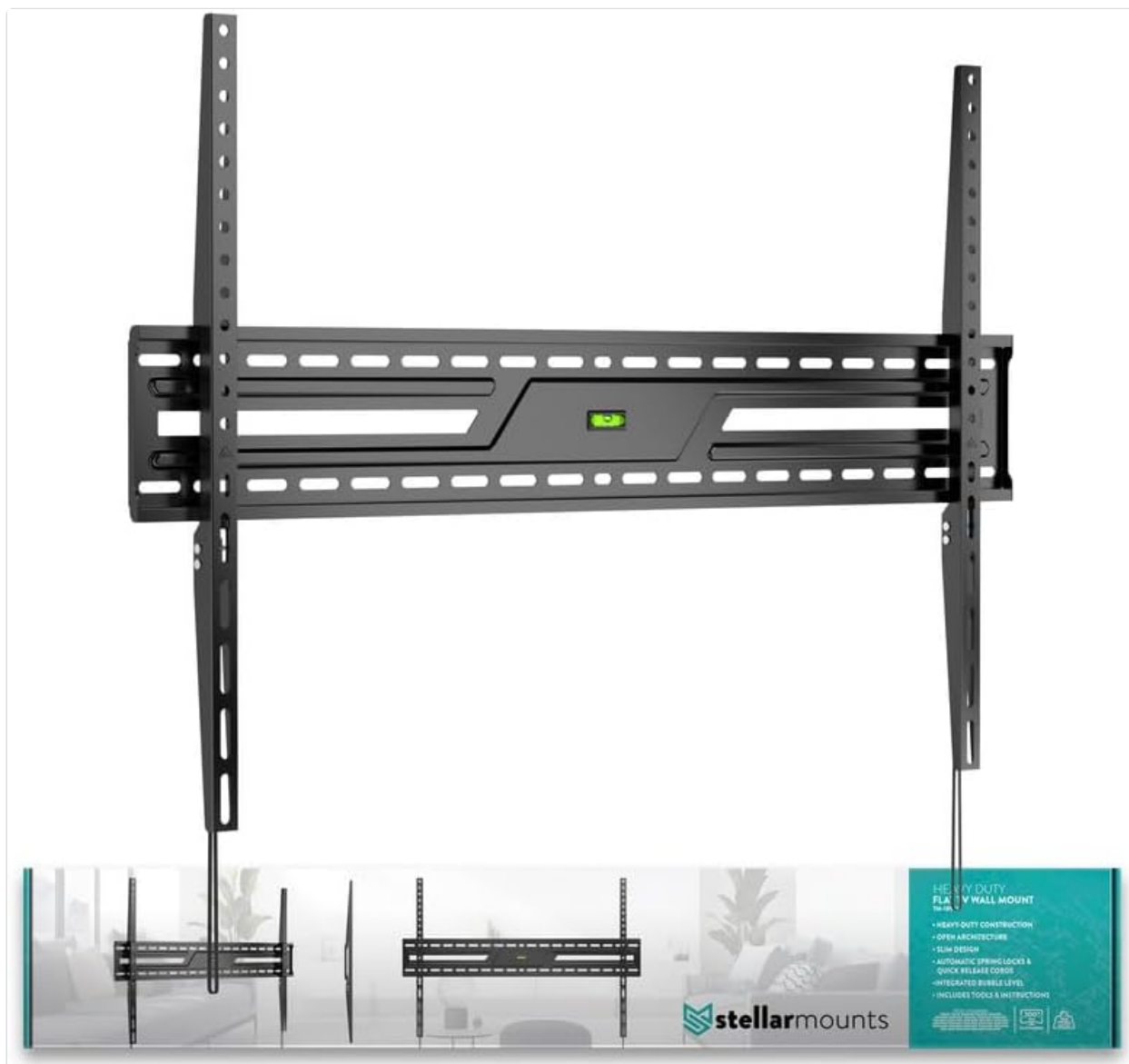
Image: Overview of the Stellar Mounts Ultra Slim Fixed TV Wall Mount, showing the wall plate, TV brackets, and packaging.