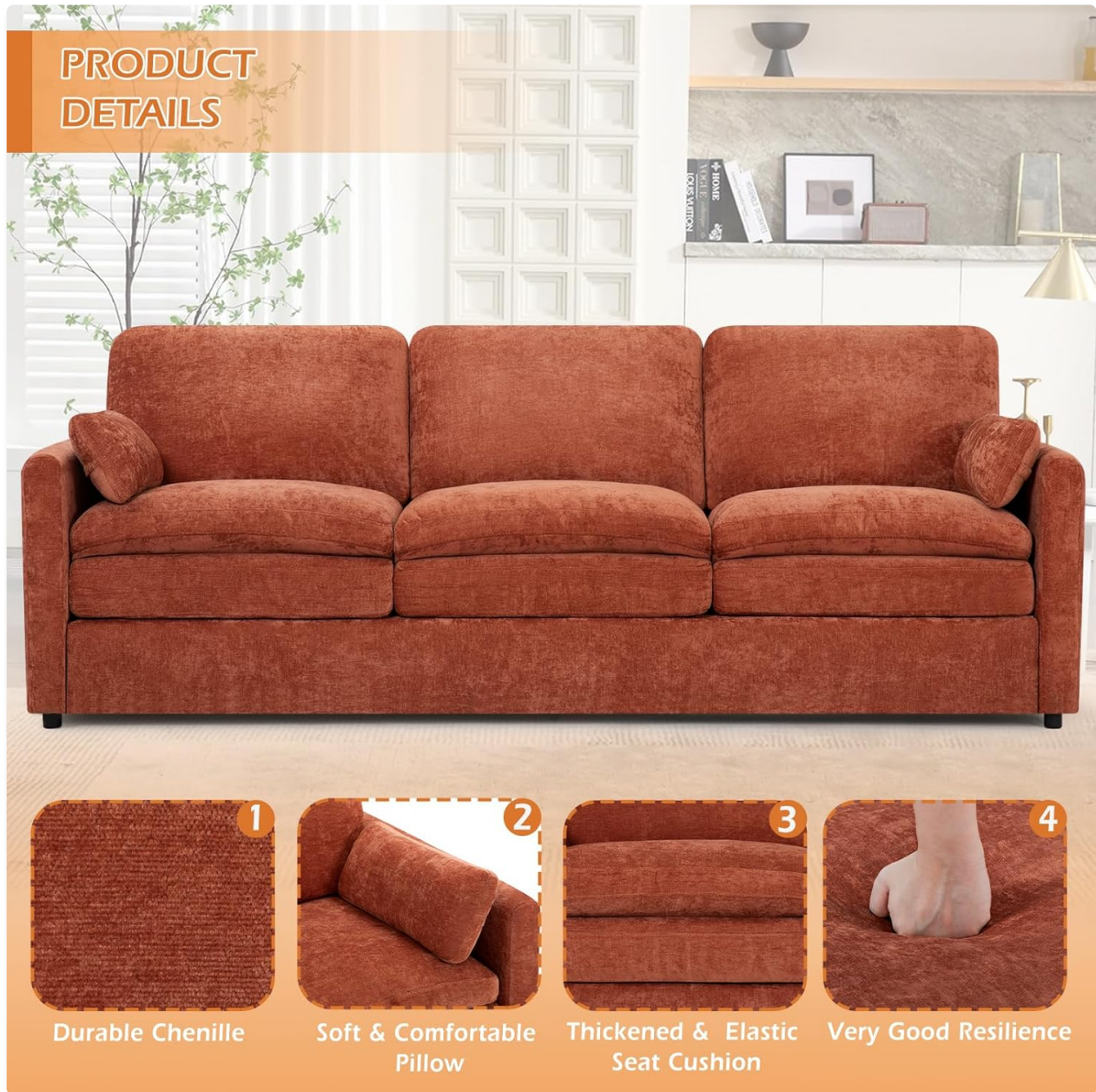
Image 5.1: Details of the sofa's construction, highlighting durable chenille, soft pillows, and resilient cushions.

This sofa is designed for comfortable seating in various indoor environments such as living rooms, apartments, offices, or waiting areas. Utilize the deeper and wider seating for optimal relaxation. The included throw pillows can be positioned for additional lumbar support or as armrests.