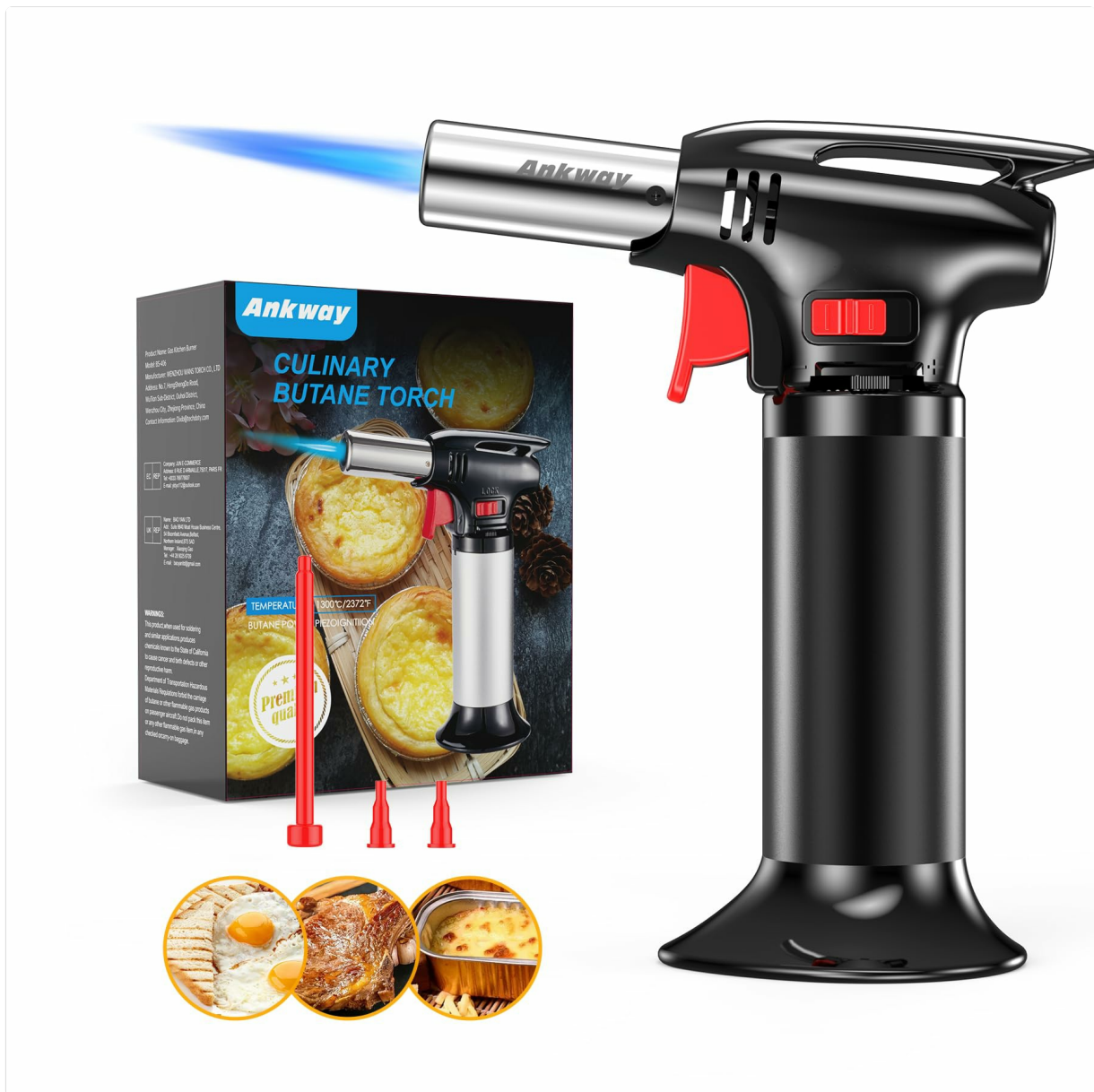
Image: Overview of the Ankway Butane Torch with labeled parts.