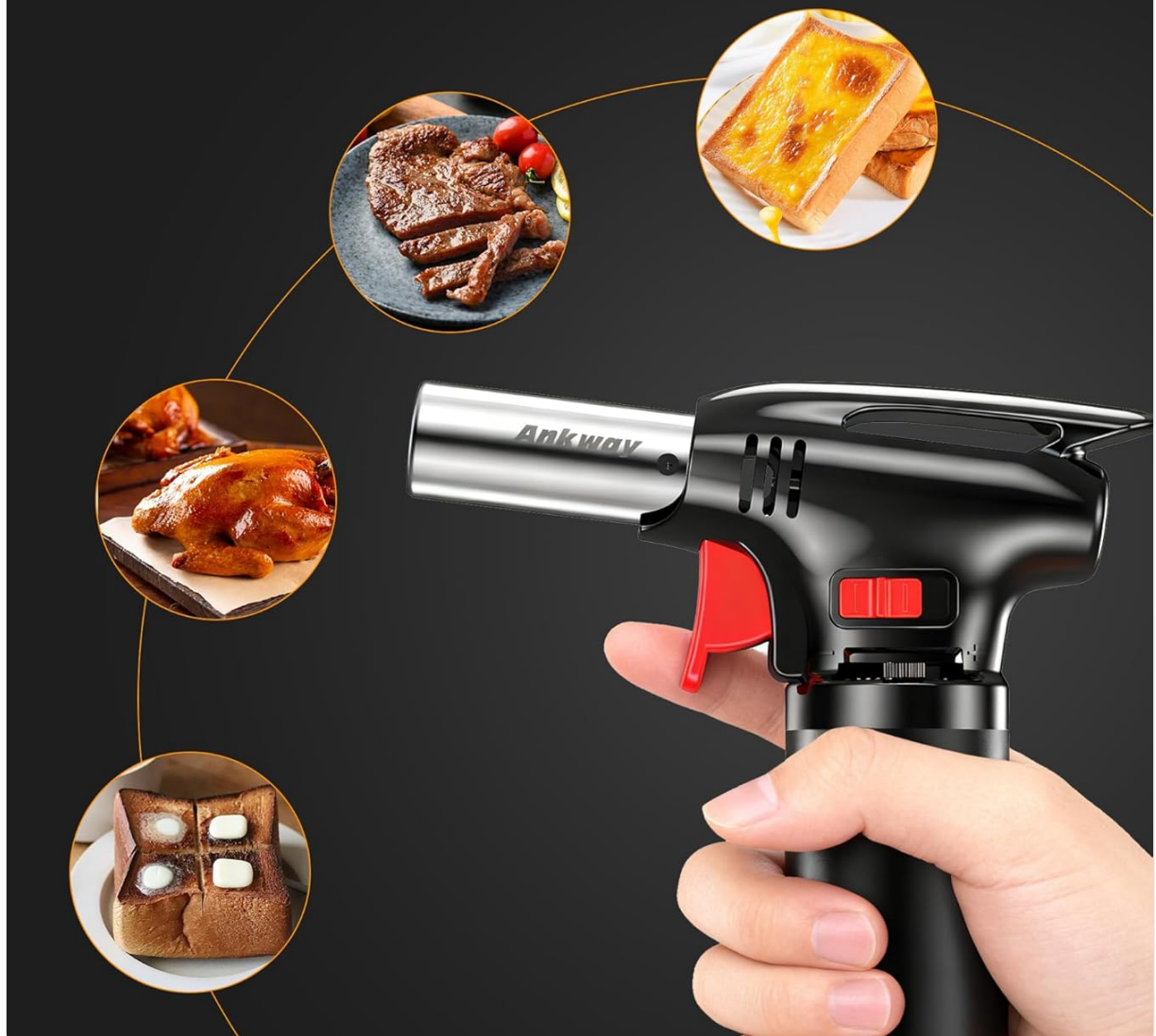
Image: Culinary uses of the butane torch, including searing and caramelizing.