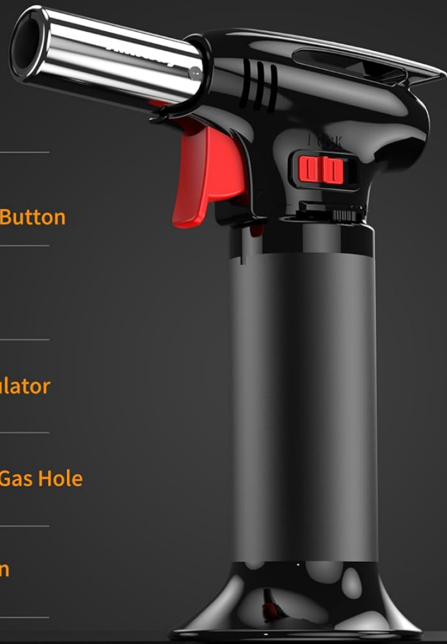
Image: Visual instructions for operating the butane torch.