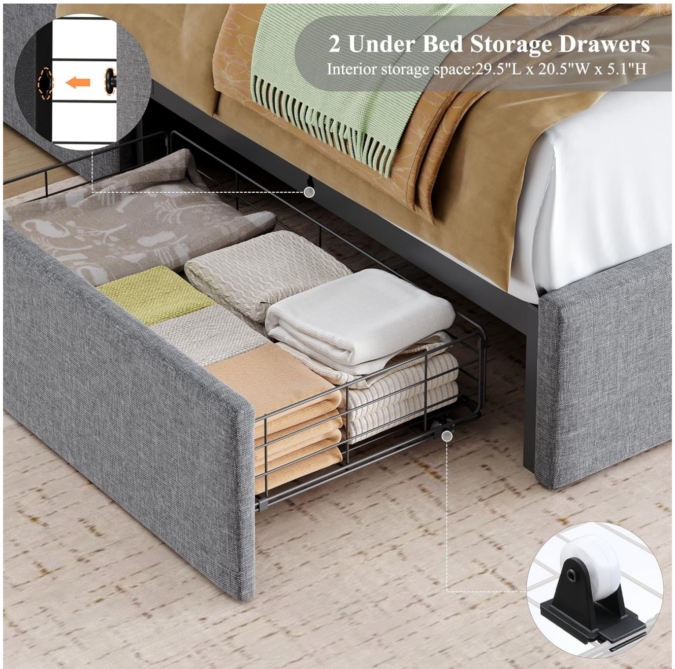
Image 4.2: Detail of the under-bed storage drawers, showing interior dimensions (29.5"L x 20.5"W x 5.1"H).