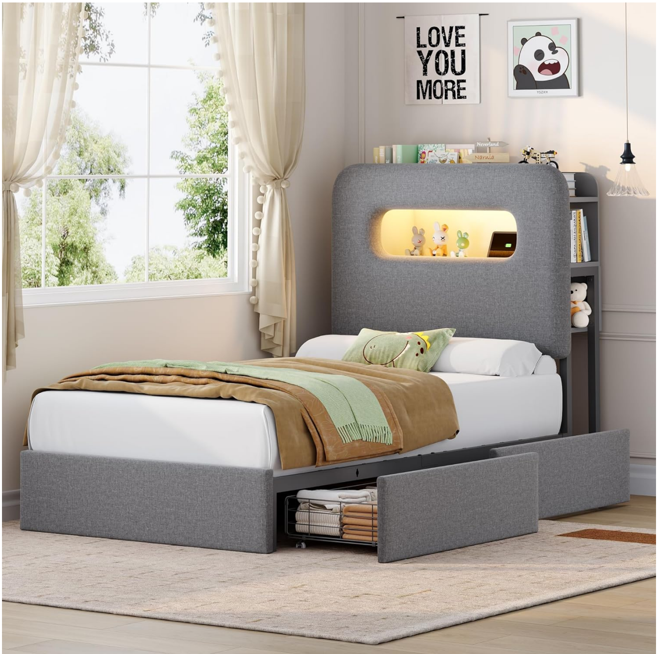
Image 6.3: The bed frame with both under-bed drawers extended, showcasing storage capacity.