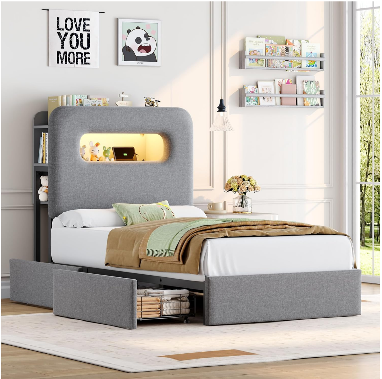
Image 1.1: Fully assembled HOSTACK Twin LED Bed Frame in a bedroom setting.