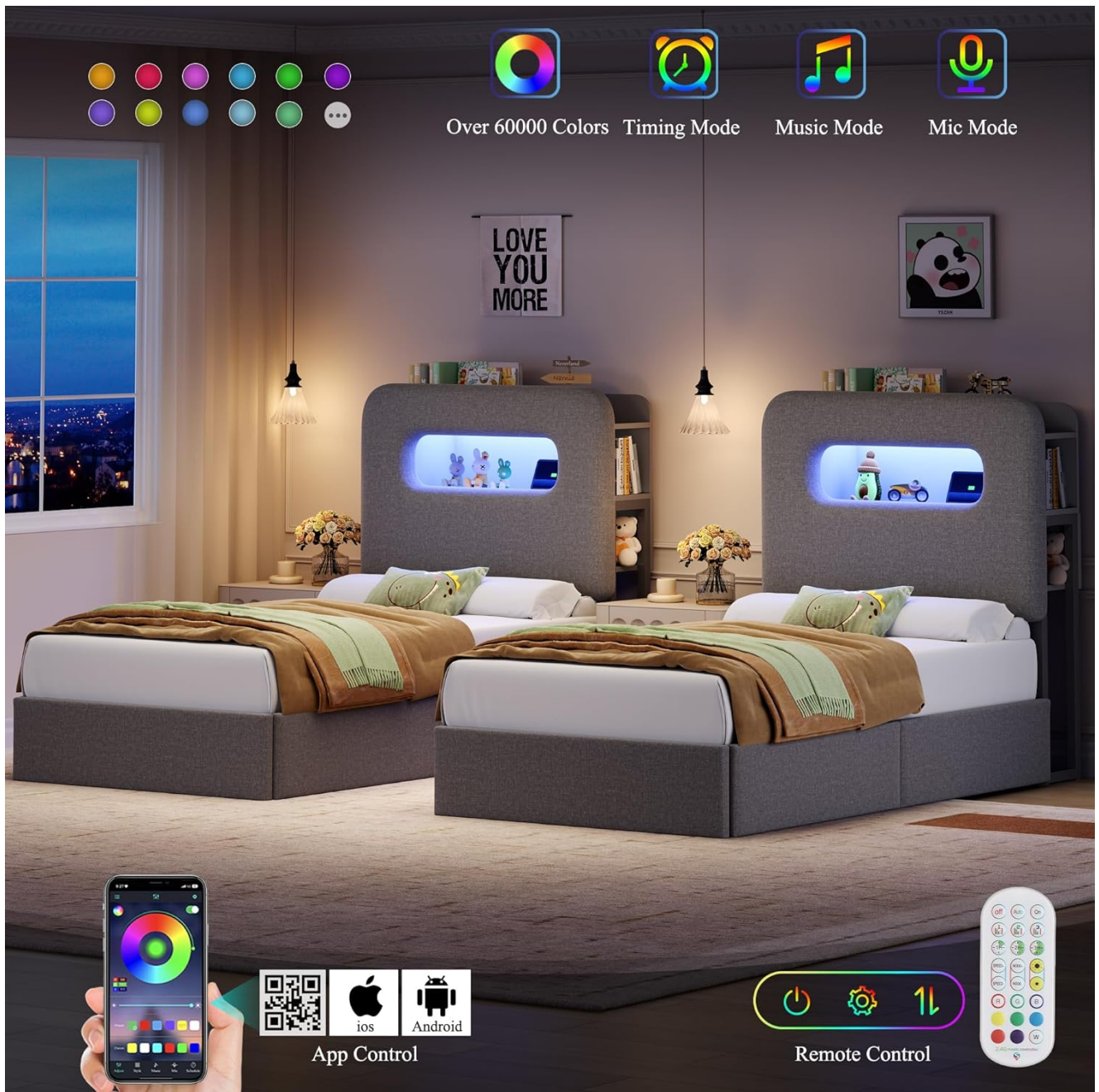
Image 6.1: Overview of LED light features, including remote and app control for color and mode selection.

To use the app control, scan the QR code provided in the packaging or search for the app in your device's app store (compatible with iOS and Android).